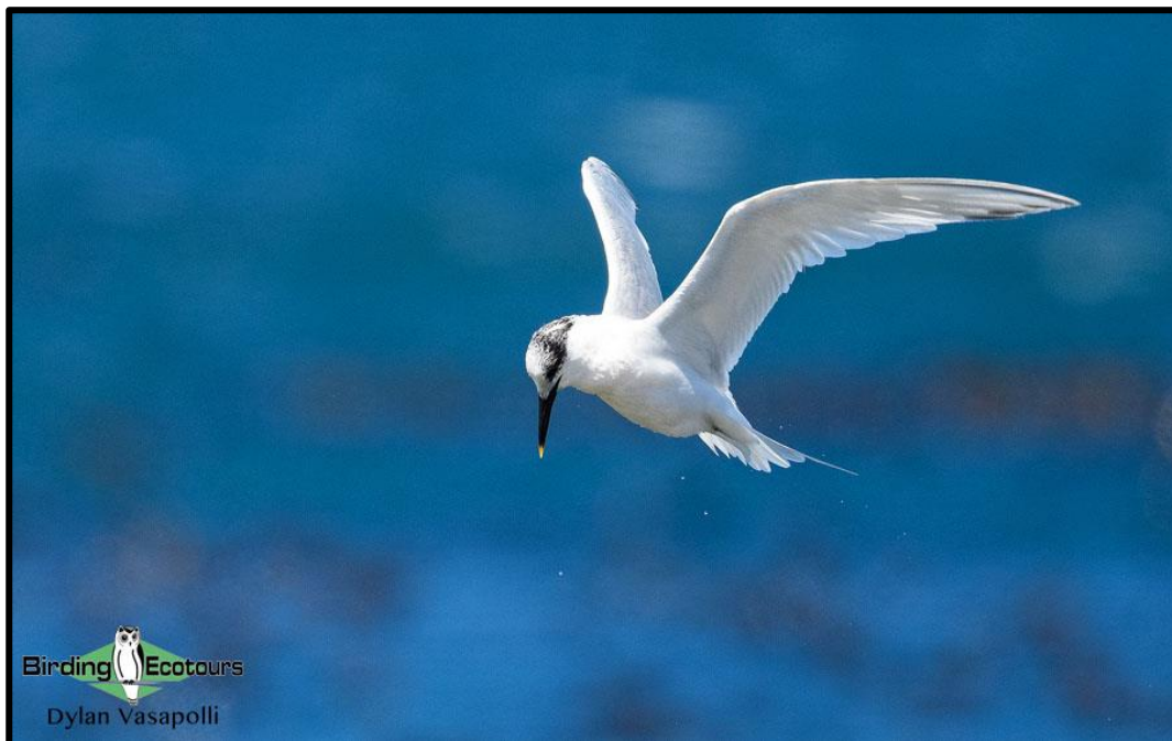
While exploring the Ria Formosa we had close views of Sandwich Tern .

The islets around the site were dotted with waterbirds like White Stork , Great Cormorant , Grey Heron , Little Egret , and Eurasian Spoonbill . We also enjoyed the wonderful sight of a large group of Greater Flamingos flying along the coast. Despite the distance their pink sheen was still clear to see. A Western Osprey also put on a fantastic show towards the end of our boat tour.