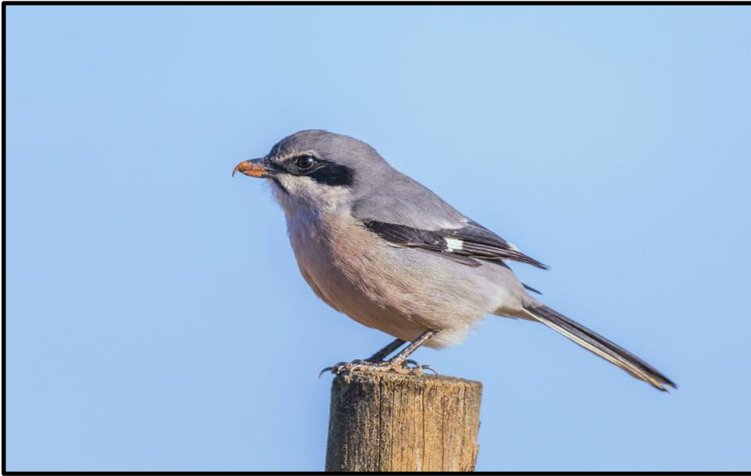
The beautiful Iberian Grey Shrike gave us prolonged and close views.