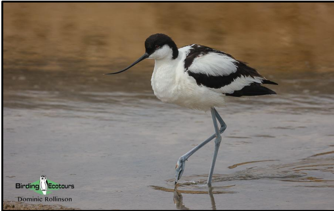
We enjoyed watching many shorebirds, including the stunning Pied Avocet .

Moving on we headed back into the agricultural areas towards the only real landmark in this open expanse, the stunning Ermida de Nossa Senhora de Alcamé . This attractive church was built for the farm workers of the area and stands proud above the flat scenery surrounding it. Here we would have a picnic lunch in the shade of the church as the day grew hotter. While lunch was generally quiet bird wise things changed as we were leaving. Soaring above us was a stunning pair of Bonelli's Eagle , a real star bird for the trip. We watched the pair until they moved away and out of view, a truly memorable experience with this magnificent raptor.