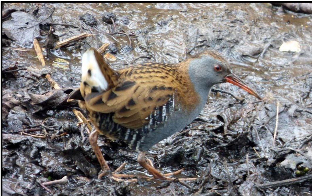
The group enjoyed fantastic views of the often-secretive Water Rail

With the sun getting lower in the sky, we retreated towards our hotel. A brief stop at the salt pans near the hotel gave a wonderful spectacle of around 200 Greater Flamingos feeding on one of the pans. These were joined by Sanderling , Mediterranean Gull , Yellow-legged Gull , Eurasian Magpie , European Stonechat , and our first Spanish Sparrow of the tour.