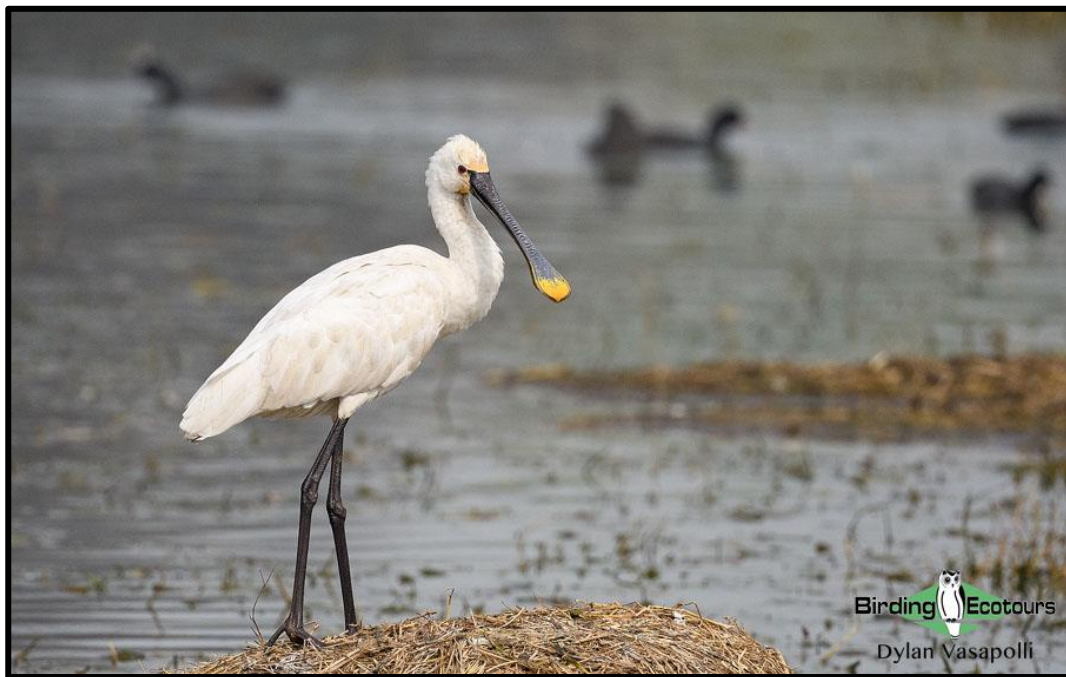
We were able to enjoy Eurasian Spoonbills along the Spanish border.

After our brief foray into Spain, it was time to return to Portugal. While driving we picked up a Great Egret at distance before reaching our next stop. As evening approached, we pulled into a farm track overlooking a vast grass field. In the distance the sound of Common Crane could be heard, and it wasn't long before 60 birds came down to roost on the hillside, giving lovely views in the evening sun. Shortly after, we were able to enjoy wonderful views of four Black-winged Kite . Despite being distant we had good views of them hunting as the sun set. Also present here were Northern Lapwing , Common Kestrel , Iberian Grey Shrike , Eurasian Skylark (singing distantly), Crested Lark , White Wagtail , Meadow Pipit , and Corn Bunting .