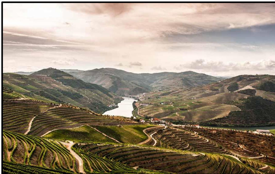
The beautiful vineyards of the Douro Valley (Photo mat's eye, Wikimedia Commons).

A total of 145 bird species were recorded during the tour (three of these were “heard only”), along with a few other interesting animals, including European Pond Turtle , Granada (Iberian) Hare , European Rabbit , Red Fox , and European Fiddler Crab . Species lists are at the end of this report. We enjoyed wine tasting at five gorgeous vineyards, visited numerous impressive cultural sites, and soaked in some staggering landscapes.