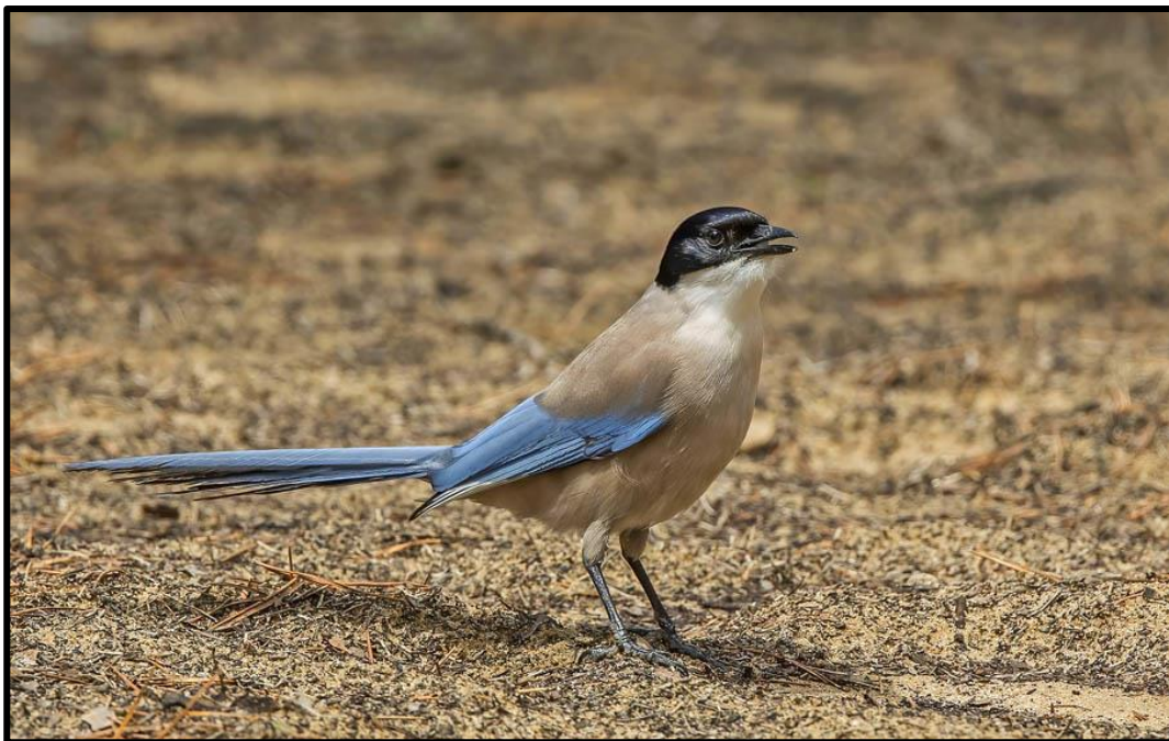
Iberian Magpie finally gave us fantastic views after teasing us throughout the early part of the tour.

A short stop at Rio Mondego-Ratoeira, a gorgeous section of river, gave us White Wagtail , Grey Wagtail , Common Waxbill , great views of three Common Buzzards , Little Grebe , Mallard , Grey Heron , Eurasian Magpie , Western Jackdaw , and Carrion Crow . Shortly before the river we again enjoyed wonderful views of Woodlark , this time in flight above the road, their beautiful song a joy for all to hear. While we watched these birds a Eurasian Sparrowhawk was seen briefly among the olive groves but disappeared quickly.