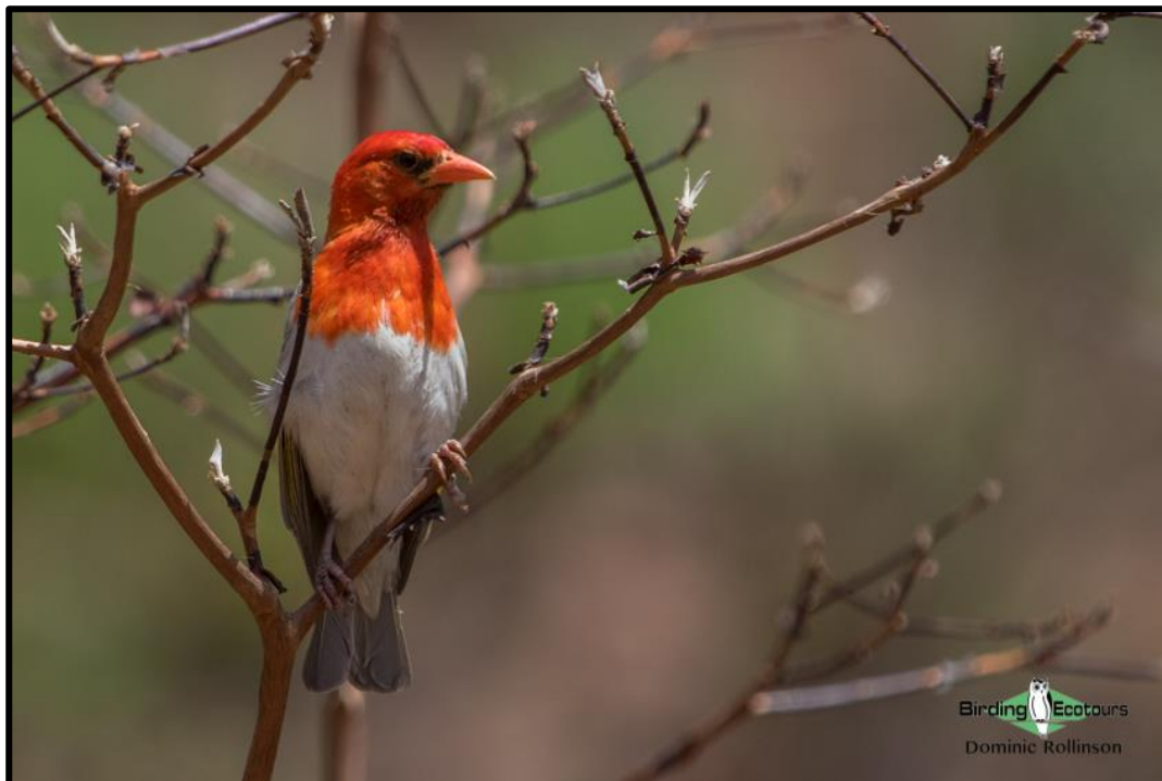
The stunning male Red-headed Weaver was seen at its nest in Mabusa Nature Reserve.

We birded for a few hours around Dullstroom this morning in the hope of finishing our remaining targets in the area. Gurney's Sugarbirds were most obliging as we arrived at the stakeout spot, and we managed a number of Denham's Bustards and Blue Cranes in the area too as well as a Marsh Owl hunting over a wetland in the early-morning light. Perhaps the highlight of the morning was watching a Serval hunting in the same wetland as it walked through the tall grass without paying much attention to us. Close to our accommodation we had good views of Pale-crowned Cisticola , Yellow-breasted and Long-billed Pipit , African Olive Pigeon , Jackal Buzzard , Streaky-headed Seedeater , and Olive Thrush .