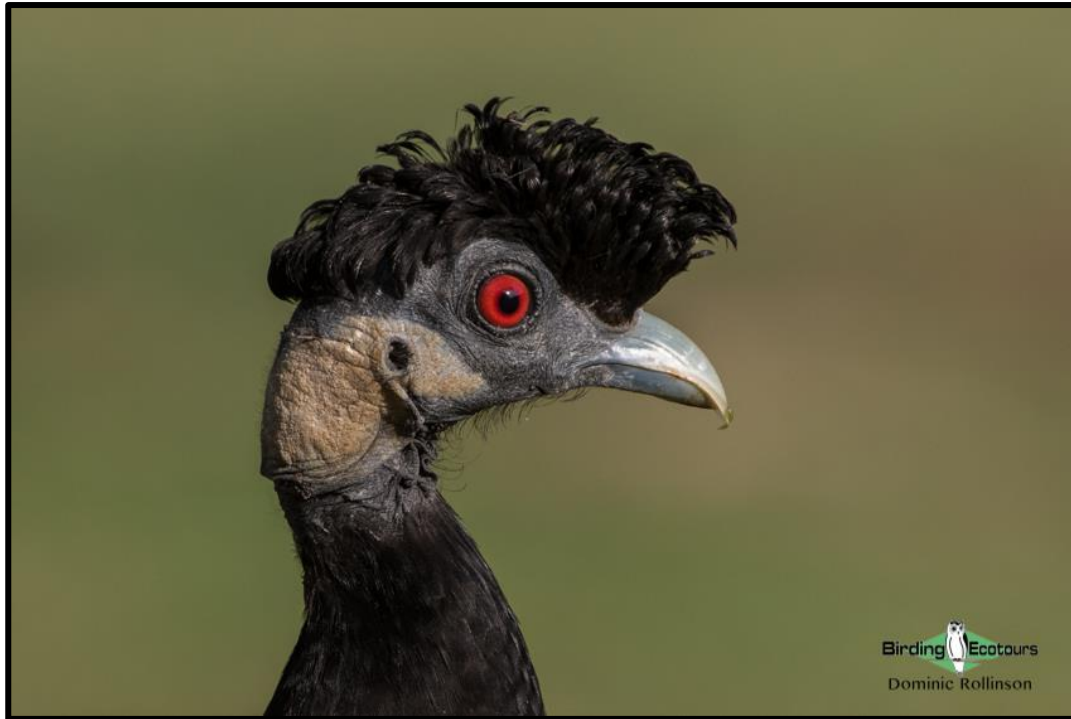
Crested Guinea fowl was common and confiding in St Lucia.