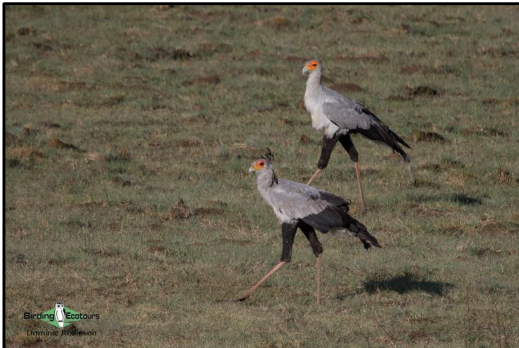
This pair of Secretarybirds were seen in the grasslands below the Sani Pass.