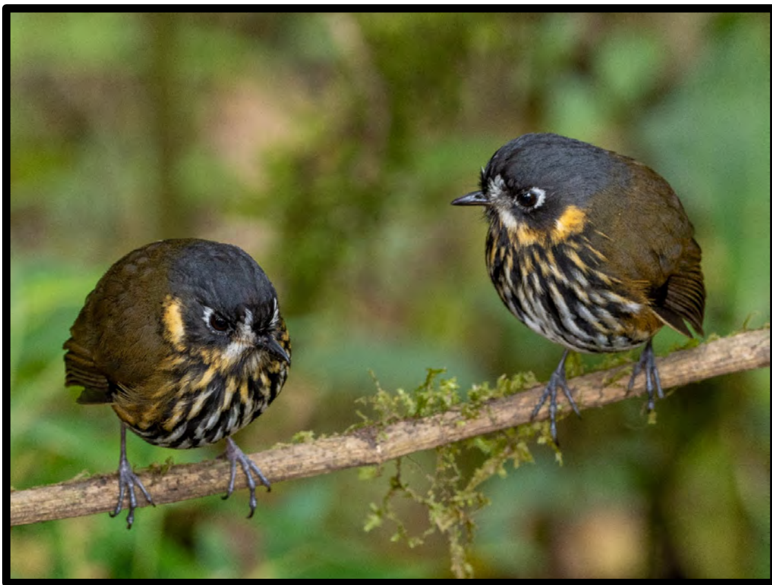
Crescent-faced Antpitta