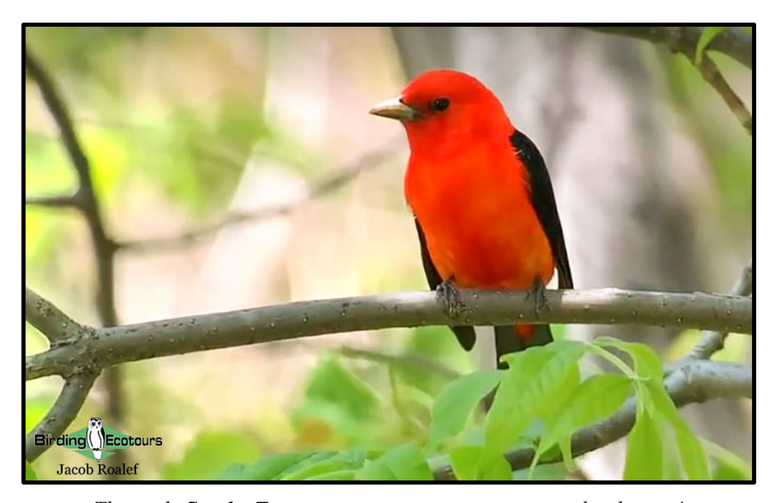
This male Scarlet Tanager gave us some amazing, eye-level views!