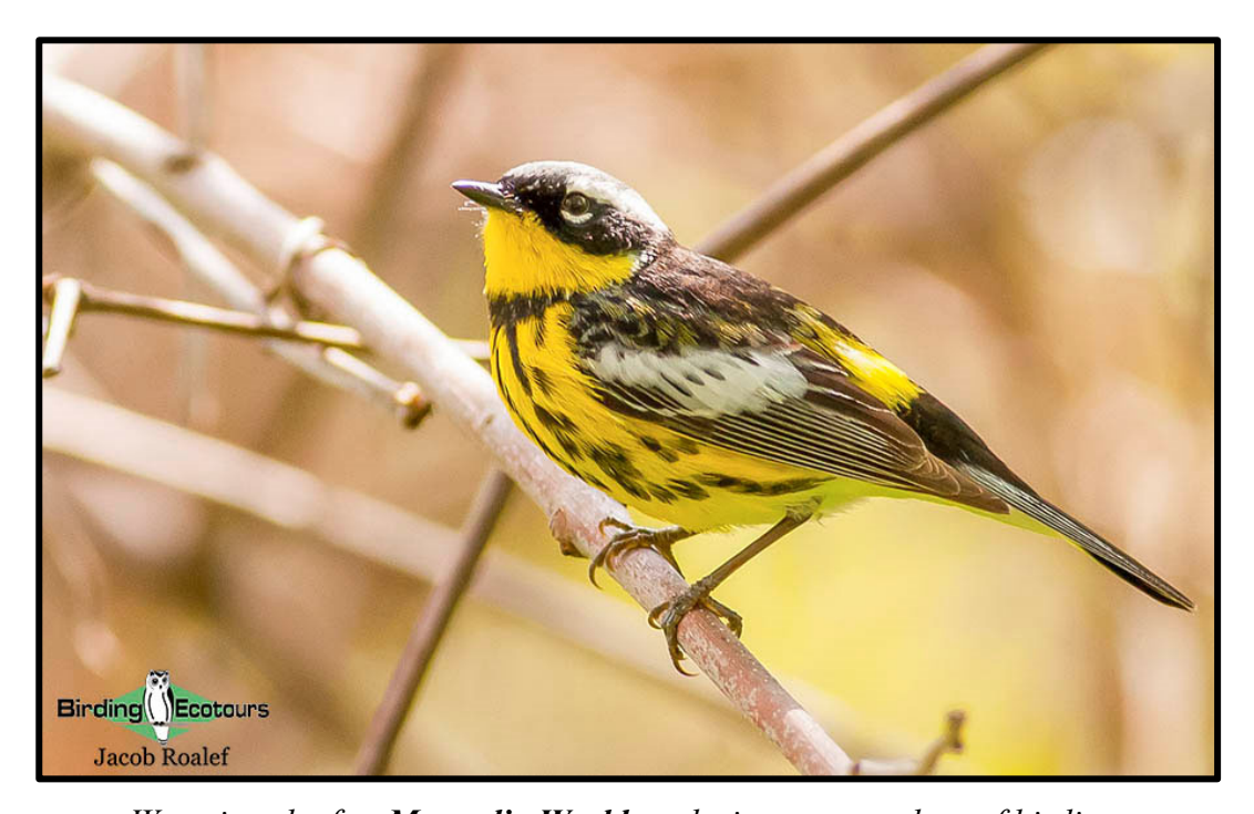
We enjoyed a few Magnolia Warblers during our two days of birding.

Greg and Mo were just on the beginning of a great road trip adventure and their first stop was two days of birding in northwest Ohio. We had an awesome time enjoying the beautiful weather, birds and each other's company. Overall we took our time and visited several hotspot locations for the area including <u>Pearson Metropark</u>, <u>Ottawa National Wildlife Refuge</u>, <u>Maumee Bay State Park</u>, and <u>Magee Marsh</u>. We tallied a nice 80 species for the two days and really focused more on close, enjoyable looks of the birds rather than a huge number of species.