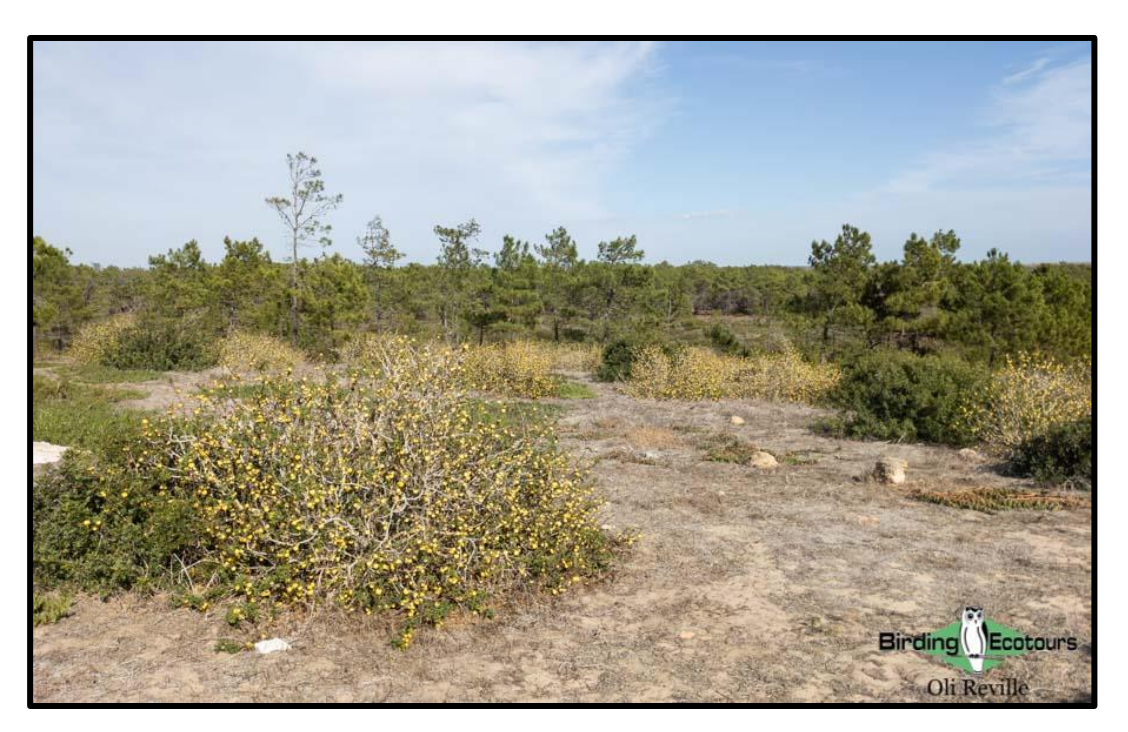
The excellent habitat around our raptor watchpoint at Sagres.