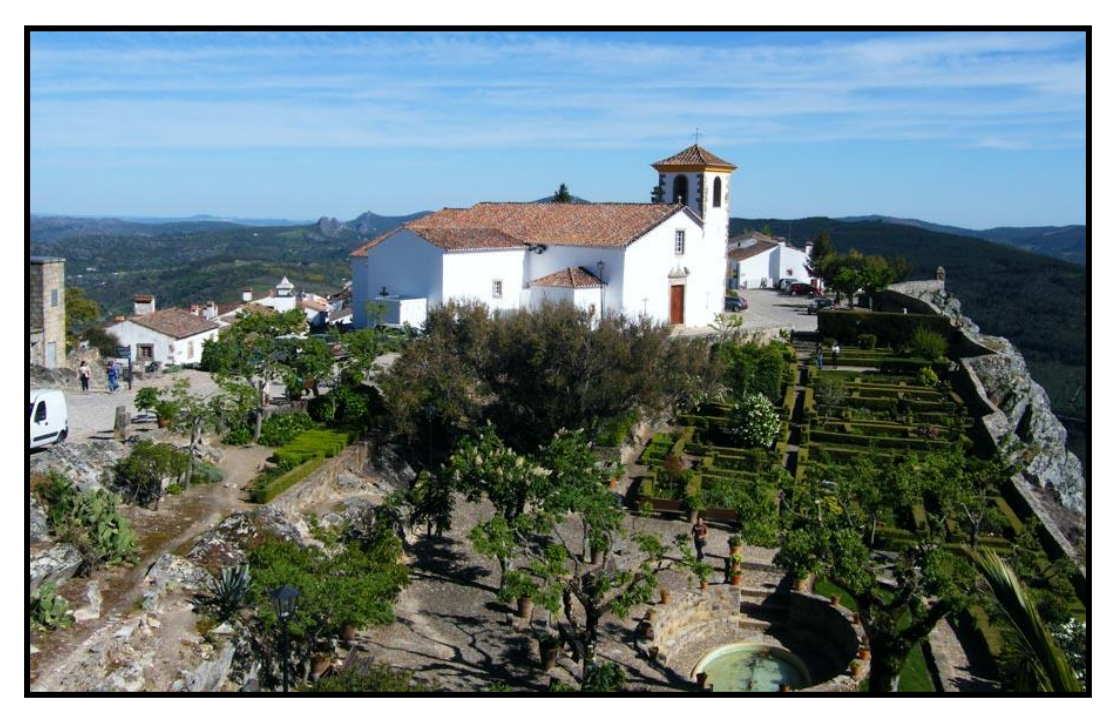
Seeing the ancient town of Marvão will be a cultural highlight of our tour.