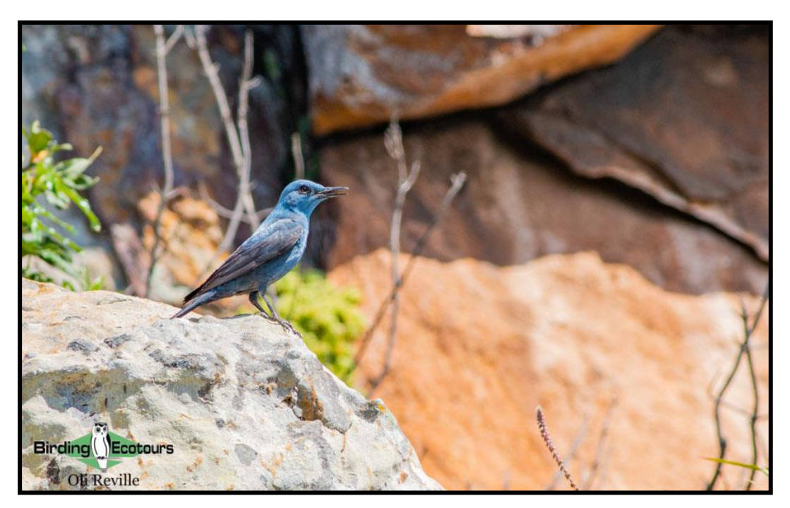
Blue Rock Thrush is a common bird of mountain areas in Portugal and always a crowd favorite.