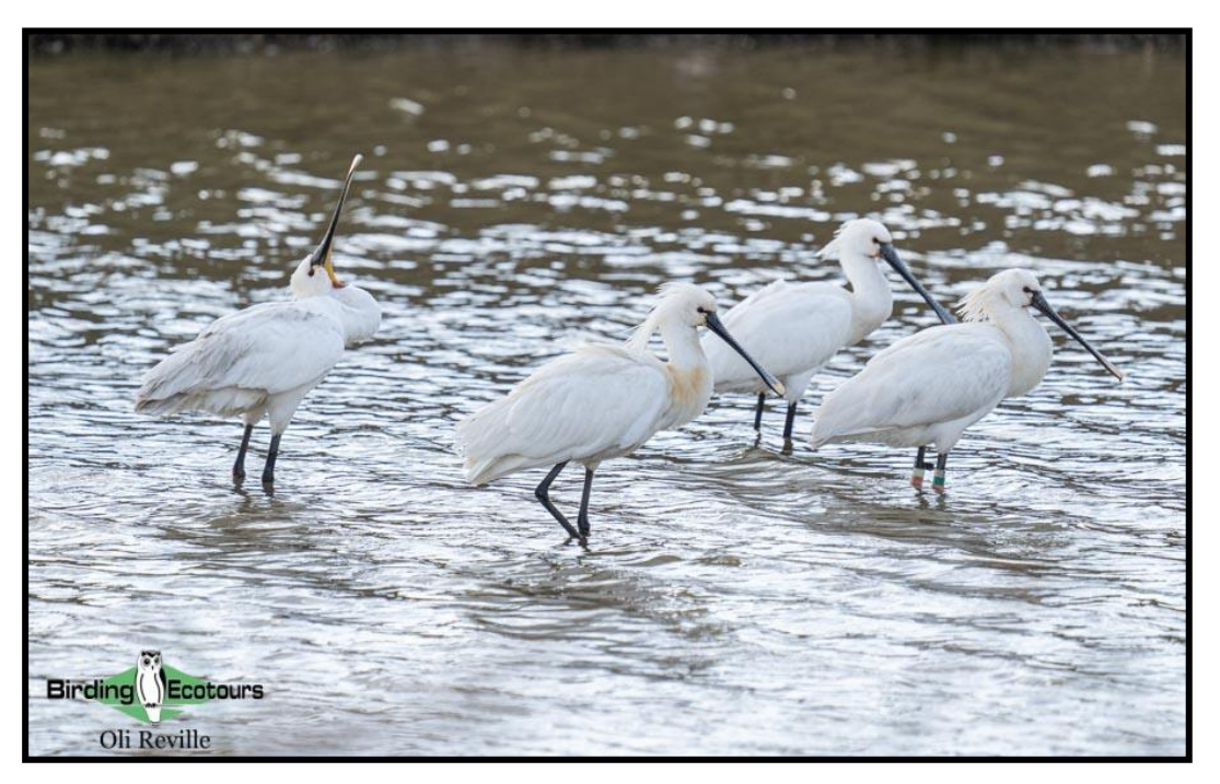
Eurasian Spoonbill is one of the iconic species of the Algarve.

Today we will also take a boat trip around a section of the park to get us closer to the wonderful wetland birds found here, which include Western Swamphen, Audouin's Gull, Slender-billed Gull, Yellow-legged Gull, Eurasian Spoonbill, Red-crested Pochard, Ferruginous Duck, Red-knobbed Coot, Purple Heron, Little Bittern, Squacco Heron, and many others.