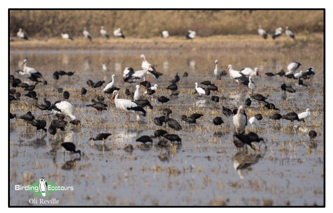
The Tagus Estuary is packed full of waterbirds!

Eagle, Long-eared Owl, White-winged Tern, Savi's Warbler, Dartford Warbler, Iberian Magpie, Calandra Lark, European Stonechat, Eurasian Penduline Tit, Short-toed Treecreeper, Spotless Starling, Common Waxbill, and so much more.