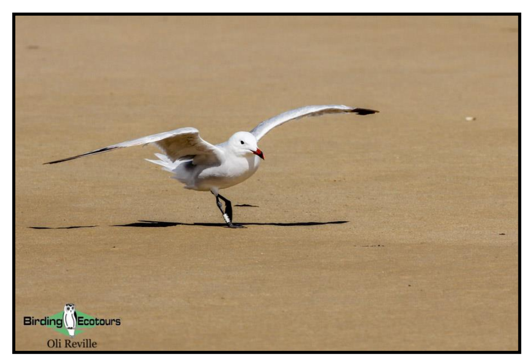
Audouin's Gull is one of the world's rarer gulls and is classified as Vulnerable by <u>BirdLife</u> <u>International</u>.