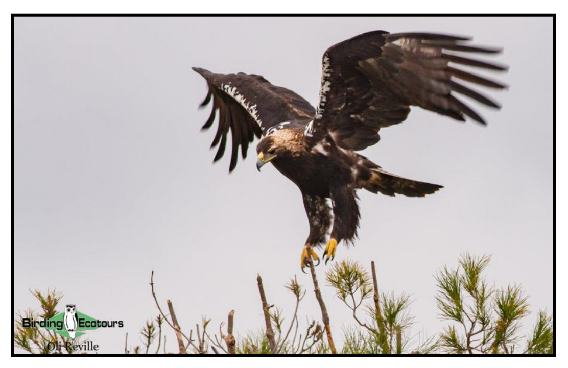
Spanish Imperial Eagle is one of the jewels in the crown of Iberian birding. It is an eye-catching species and because it is a regional endemic it is also highly prized by visiting birders.