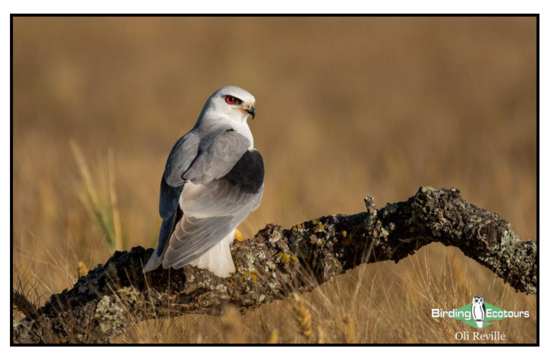
Black-winged Kite is a true grassland species and a stunning bird too.

Today we once again head east towards the Spanish border. We will begin by birding around the town of Mourão. This is an excellent area for raptors (birds of prey) with key targets including Griffon Vulture, Cinereous Vulture, Black-winged Kite, Red Kite, Common Kestrel , and Common Buzzard all occurring here. Western Barn Owl and Little Owl also occur and we will be sure to keep our eyes peeled for them too.