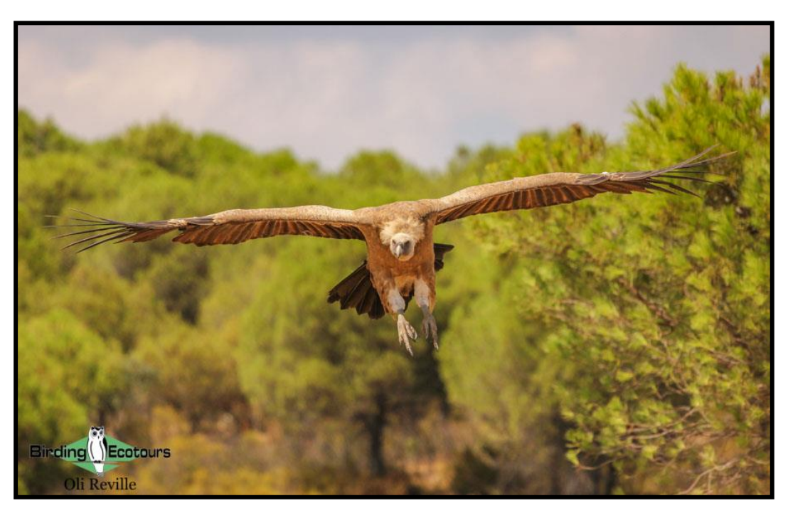
Sagres in Portugal is one of several places where we can get great views of the giant Griffon Vulture .

We begin our tour in the beautiful city of Porto, from here we will head straight into the picturesque Douro River Valley, east of the city, for our first look at rural Portugal and its wonderful vineyards. While in the area we will enjoy not only vineyards but other cultural highlights, such as the Côa Valley Archaeological Park, and we will also get to grips with mountain birding with species such as Griffon Vulture , Blue Rock Thrush , Iberian Grey Shrike , White-throated Dipper , and Black Wheatear all among some of our first targets.