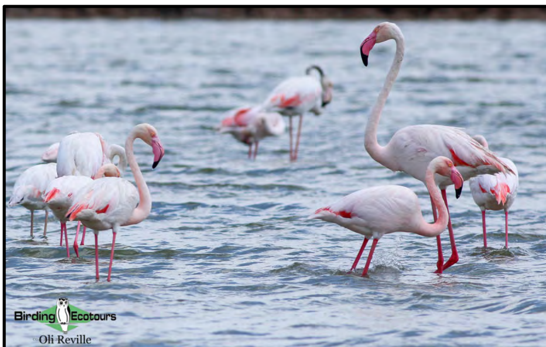
Gorgeous Greater Flamingoes always provide a touch of color in the wetlands.