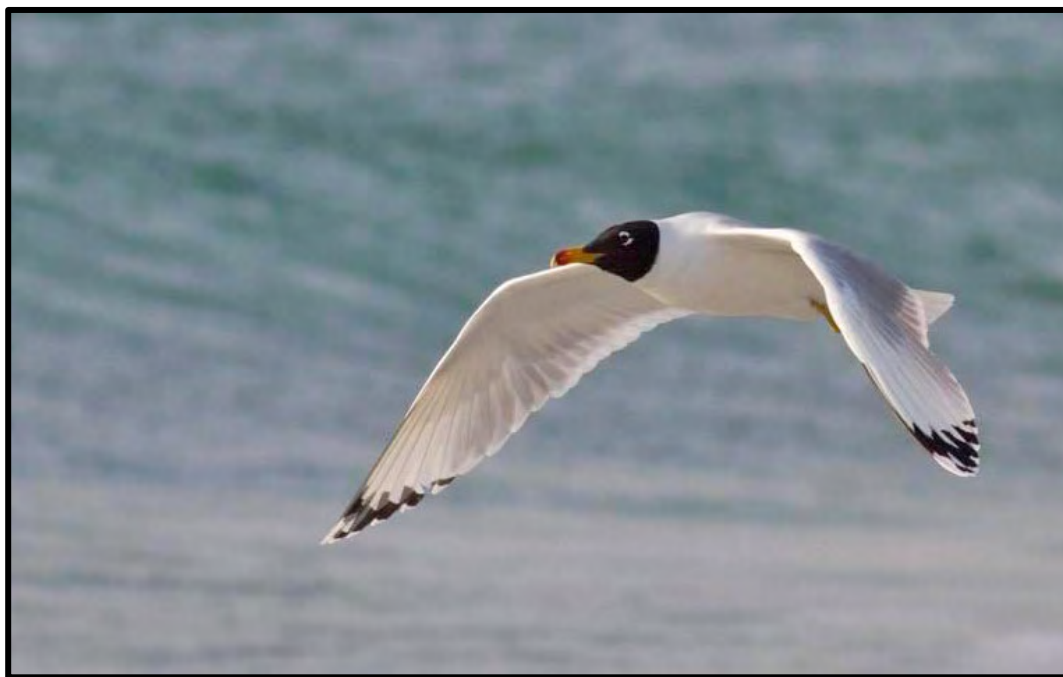
The elegant Pallas's Gull is a range-restricted species in the Western Palearctic, with Azerbaijan being one of the best places in the world to see this large gull.

We must also be sure to scan the large gull flocks that can winter here. As well as the more numerous Black-headed Gull , Mew (Common) Gull , Little Gull , and Caspian Gull , we may also come across Pallas's Gull . This giant of a gull has a restricted range in the Western Palearctic, with just a smattering of wintering areas found around the Caspian Sea and Red Sea, with breeding territories in southern Ukraine, so not an easy species to catch up with in general.