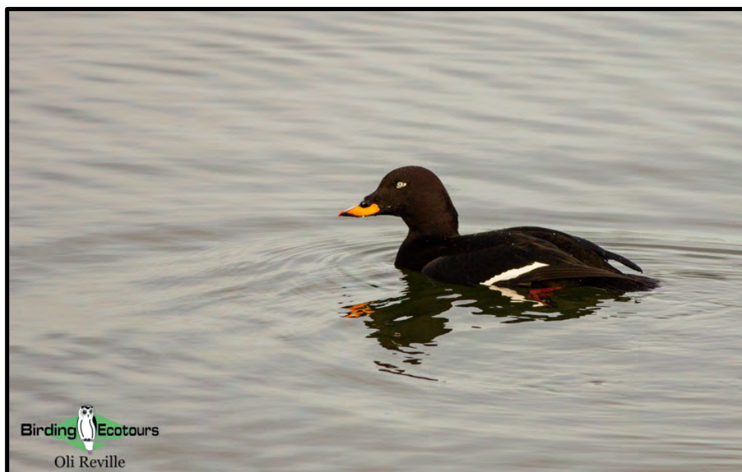
The stunning Velvet Scoter is a winter visitor to southern Azerbaijan.

In more general terms the dominant birds here consist of wildfowl, with a wide range of species present, including Greater White-fronted Goose , Greylag Goose , Whooper Swan , Tundra (Bewick's) Swan , Ruddy Shelduck , Common Shelduck , Northern Shoveler , Northern Pintail , Red-crested Pochard , Common Pochard , Tufted Duck , Eurasian Wigeon , Eurasian Teal , Common Goldeneye , and Smew all possible during our visit. There is also a chance of the stunning Velvet Scoter , Red-throated Loon (Diver), and Black-throated Loon (Diver).