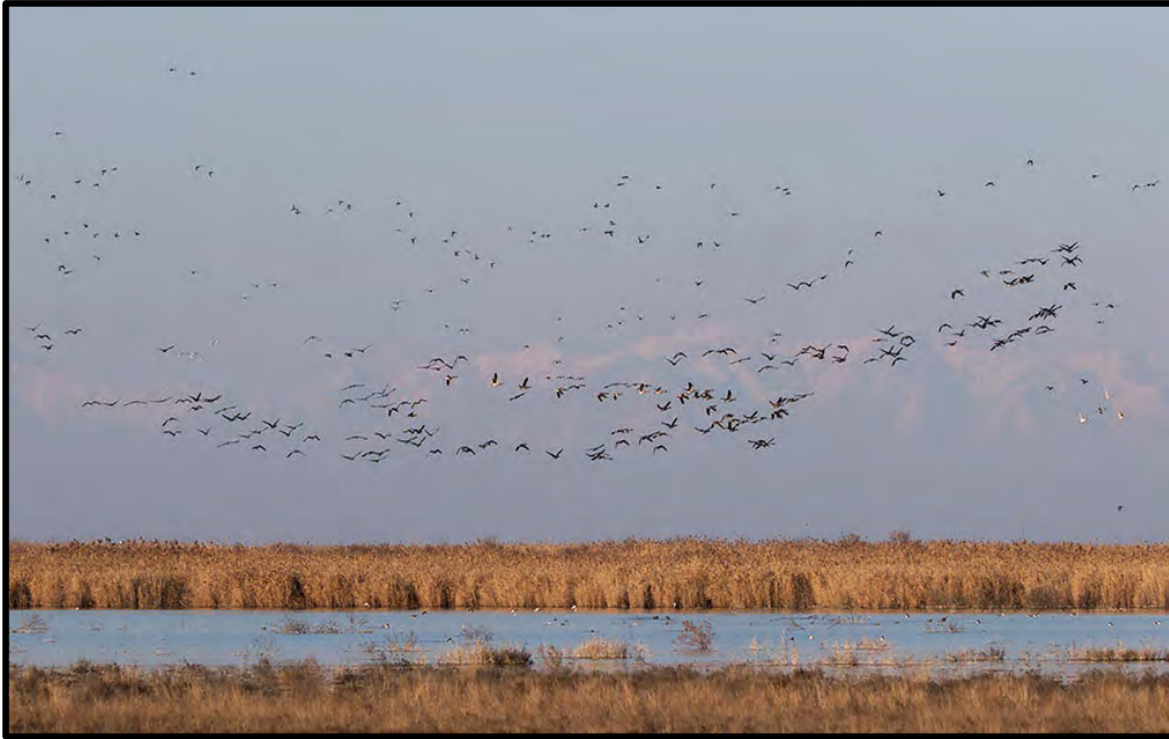
The Agh Gol National Park is an amazing birding area during the winter. The snow-capped Lesser Caucasus Mountains creating a stunning backdrop.