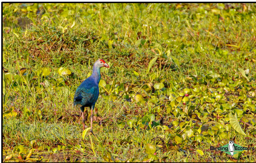
The huge and colorful Grey-headed Swamphen is another range-restricted species in the Western Palearctic, since being split from Western Swamphen, which we see in Spain .

Wallcreeper and Bearded Reedling (Tit), both monotypic families are also possible on this tour. These interesting and rare species are the real attraction of birding in Azerbaijan in winter. However, we will also come across a wide range of more common wildfowl, shorebirds (waders), birds of prey, and passerines that spend the winter in this fascinating part of the world. We will also look for a range of mammals with Goitered Gazelle , Red Fox , (European) Grey Wolf , Small Five-toed Jerboa , and Jungle Cat all being possible.