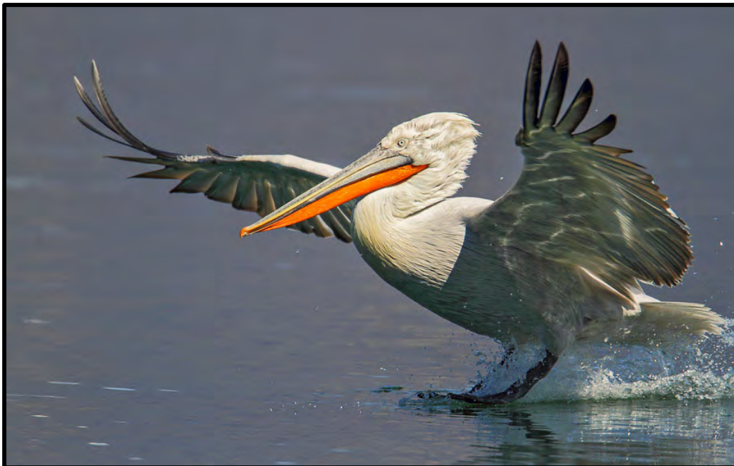
Dalmatian Pelican is a species of global conservation concern. We will look for this species at several sites in Azerbaijan.