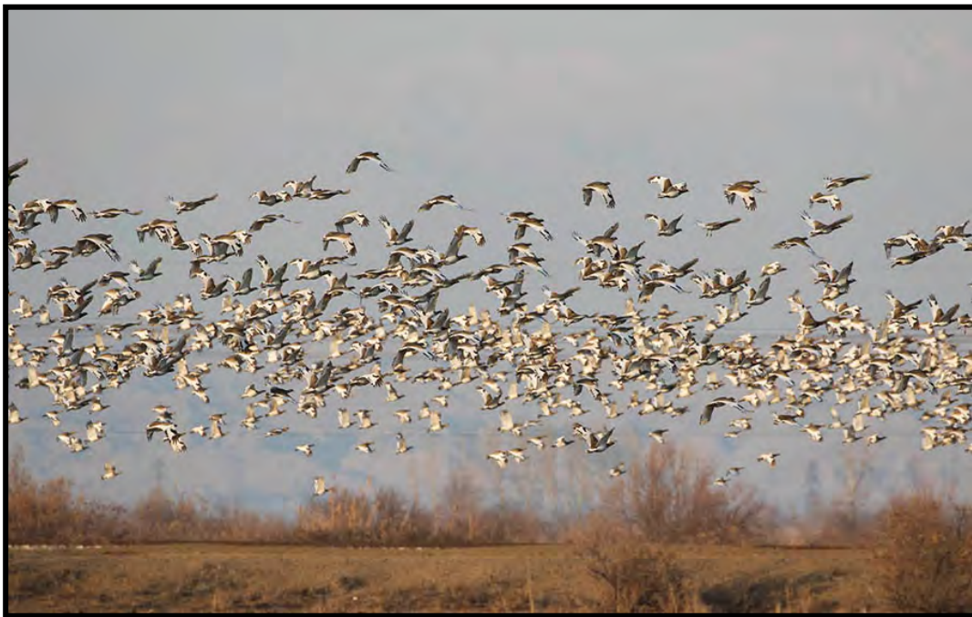
Azerbaijan is one of the most important overwintering locations in the world for Little Bustard with huge and impressive flocks congregating in the country.

While numerous familiar and widespread European species are possible on this tour, it is the Western Palearctic range-restricted species that we will be really targeting, including species like Grey-headed Swamphen , White-tailed Lapwing , Pallas's Gull , Black Francolin , Eastern Imperial Eagle , Red-fronted Serin , Marsh Sandpiper , Moustached Warbler , Syrian Woodpecker , and White-winged Lark . We also have a chance of surprise species like Black Lark and (Asian) Buff-bellied Pipit ( japonicus subspecies). Additionally, we should keep our eyes out for globally threatened species like Dalmatian Pelican , Pallid Harrier , Red-breasted Goose , Lesser White-fronted Goose , Marbled Duck , Ferruginous Duck , White-headed Duck , Armenian Gull , and vast flocks of Little Bustard .