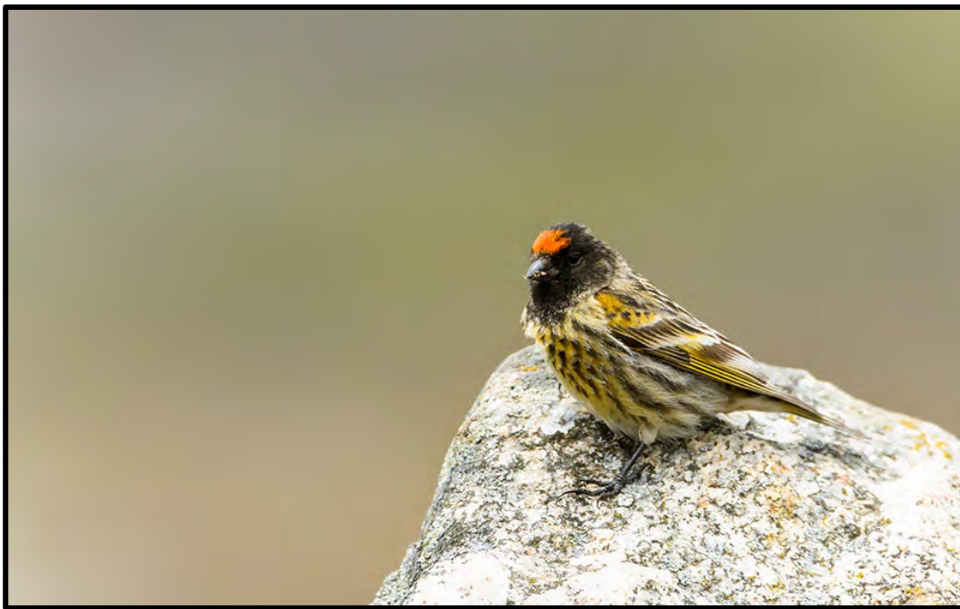
The rocky landscapes around Mingecevir are the perfect habitat for the beautiful Red-fronted Serin.