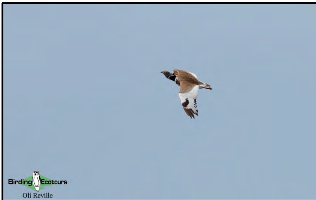
Little Bustard is a highly attractive bird when seen well. We are likely to see many individuals on this tour including some large flocks (as shown in the introduction).