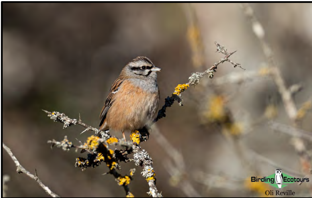
Rock Bunting is a very pretty passerine and is associated with rocky mountain habitat.

The river valley bushes should hold a range of passerines including good numbers of buntings and finches, like Rock Bunting , Corn Bunting , Yellowhammer , Brambling , and Hawfinch . Wintering thrushes should also be in attendance with Redwing , Fieldfare , Ring Ouzel , Common Blackbird , Song Thrush , and Mistle Thrush all likely to be present. We may also get the chance of finding locally rare woodpeckers, like Great Spotted Woodpecker and European Green Woodpecker here.