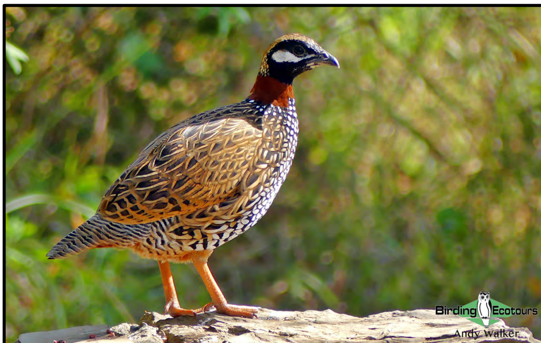
Black Francolin is a striking species that is mostly found in Asia .