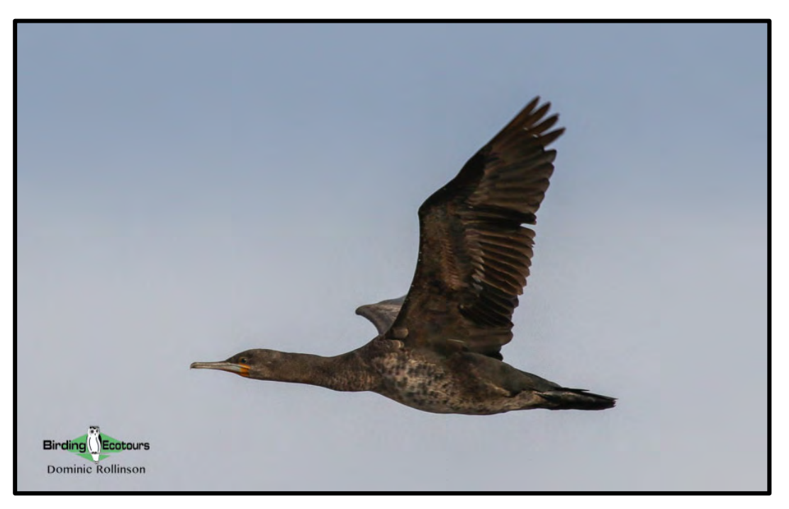
Cormorants, such as this Cape Cormorant, were seen well at Stony Point.

After a fantastic week of birding around the Cape unfortunately the tour came to an end this morning. As we were packing the vehicle an African Harrier-Hawk flew by briefly before we headed to the airport, where some of us would be carrying on to join our 18-day Subtropical South Africa tour starting in Durban later that afternoon.