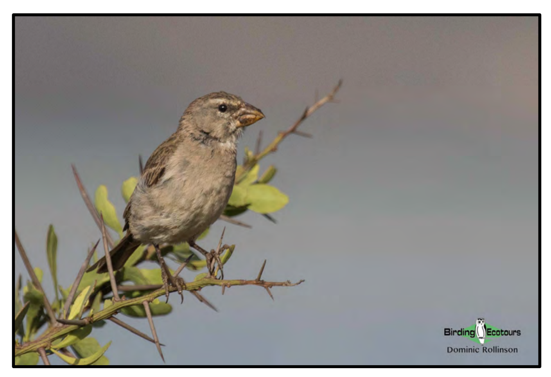
White-throated Canary was common in the Tankwa Karoo.

After leaving the farmlands we stopped briefly at a salt works in Velddrif, where we added Chestnut-banded Plover (many), Red-necked Phalarope , and Pied Kingfisher before we headed inland toward the Tankwa Karoo. Before crossing the mountains into the Tankwa Karoo Betty brought the car to a halt, as she had spotted a Secretarybird that provided us all with fantastic views of one of the weirder-looking birds on the planet. We also found another new bird en route in form of Grey-backed Sparrow-Lark . Before dinner some of us managed to hear the distant call of a Rufous-cheeked Nightjar , unfortunately the bird could not be seen!