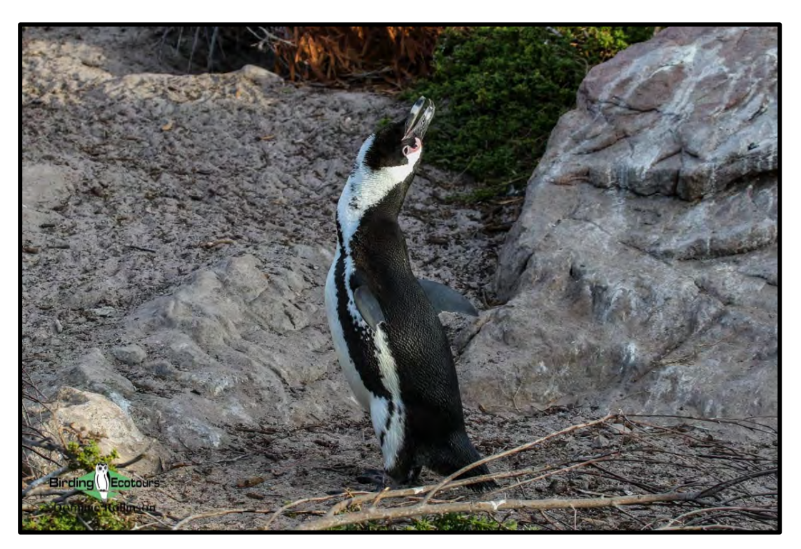
African Penguins were seen at their breeding colony at Stony Point.

During this eight-day tour we managed an impressive bird list of 222 species (plus an additional 11 species heard only), including many South African endemics and near-endemics, such as African Penguin, Cape Gannet, Bank, Cape, and Crowned Cormorants, Jackal Buzzard, Grey-winged Francolin, Cape Spurfowl, Blue Crane, Ludwig's Bustard, Southern Black Korhaan, Large-billed, Cape Long-billed, and Karoo Larks, Cape Rock Thrush, Karoo, Sickle-winged, Tractrac, and Ant-eating Chats, Cape Rockjumper, Ground Woodpecker, Cape Grassbird, Cape Penduline Tit, Karoo Eremomela, Cinnamon-breasted, Namaqua, and Rufous-eared Warblers, Fairy Flycatcher, Pririt Batis, Cape Sugarbird, Orange-breasted and Southern Double-collared Sunbirds, Swee Waxbill, Forest Canary, and Cape Siskin.