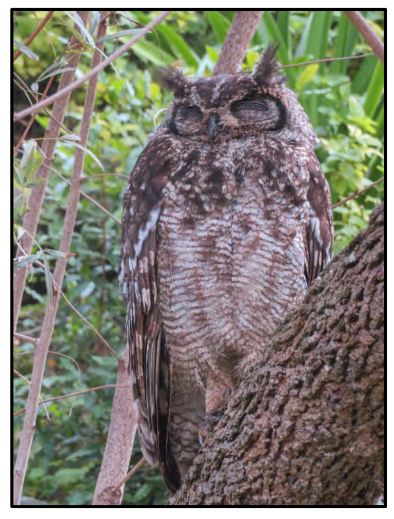
The resident Spotted Eagle-Owl showed well at Kirstenbosch National Botanical Garden.

Lemon Dove, Cape Batis, Bar-throated Apalis, Cape Bulbul, Swee Waxbill, Forest, Brimstone, and Cape Canaries, and a really vocal Klaas's Cuckoo, which annoyingly would just not show itself. The resident Spotted Eagle-Owls also showed really well for us and posed for photographs.