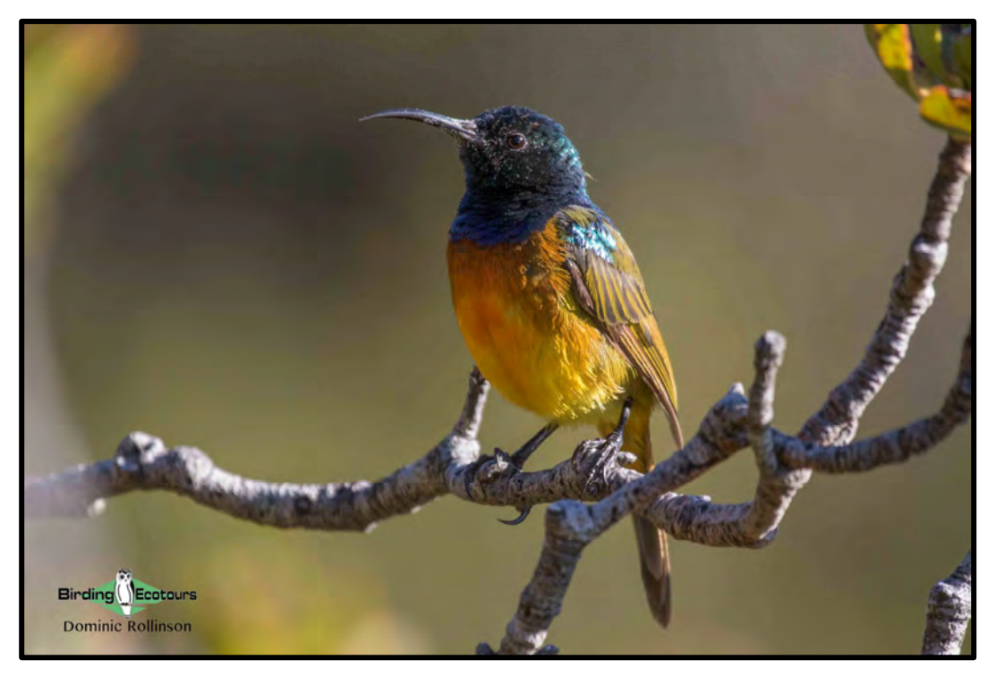
The beautiful Orange-breasted Sunbird is common in mountain fynbos of the Cape.

Pochard ) and a few common Palearctic shorebirds. Other species which took a bit more work to find included Black-necked (Eared) Grebe , White Stork , Spotted Thick-knee , Grey-headed Gull , Purple Heron , Whiskered Tern , Intermediate Egret , and Glossy Ibis . In the surrounding scrub and reedbeds we found Black-winged Kite , Little Rush and Lesser Swamp Warblers , Cape Longclaw , and Cape Weaver .