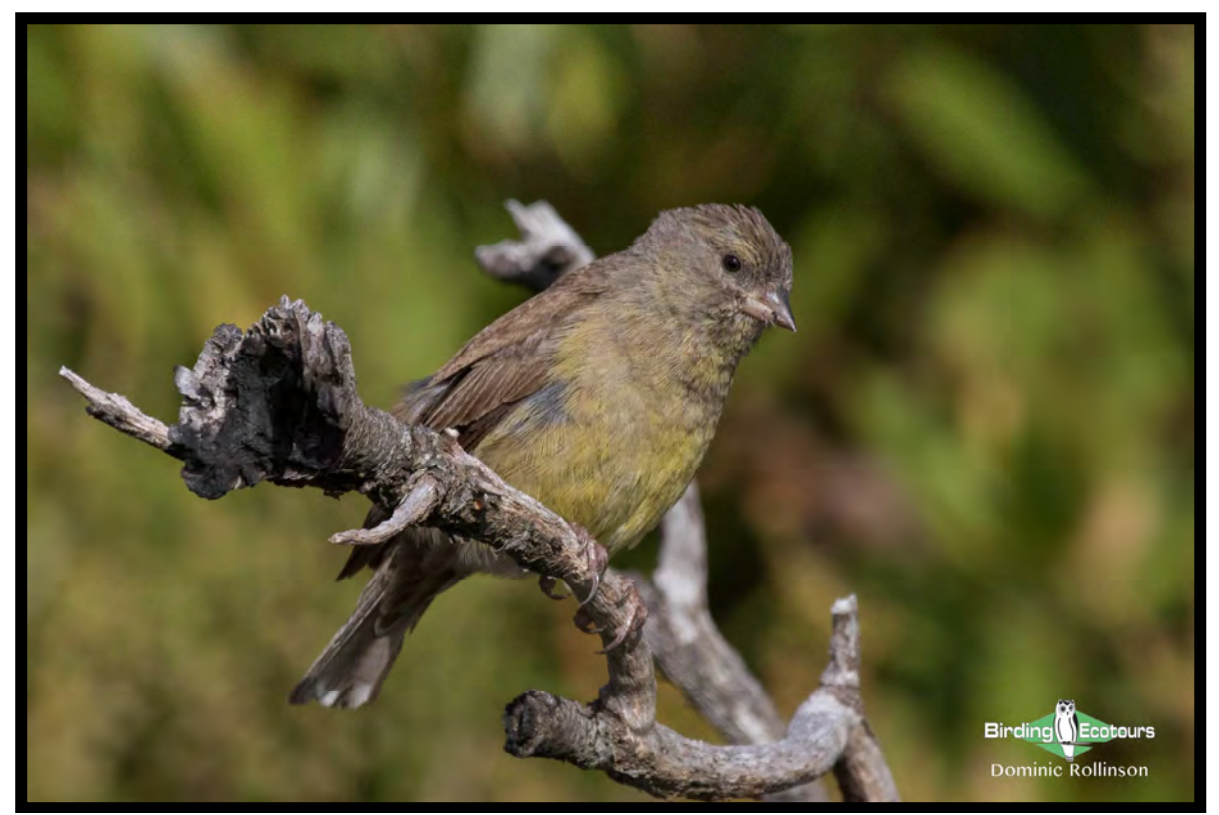
The endemic Cape Siskin put on a show for us at Rooi Els.