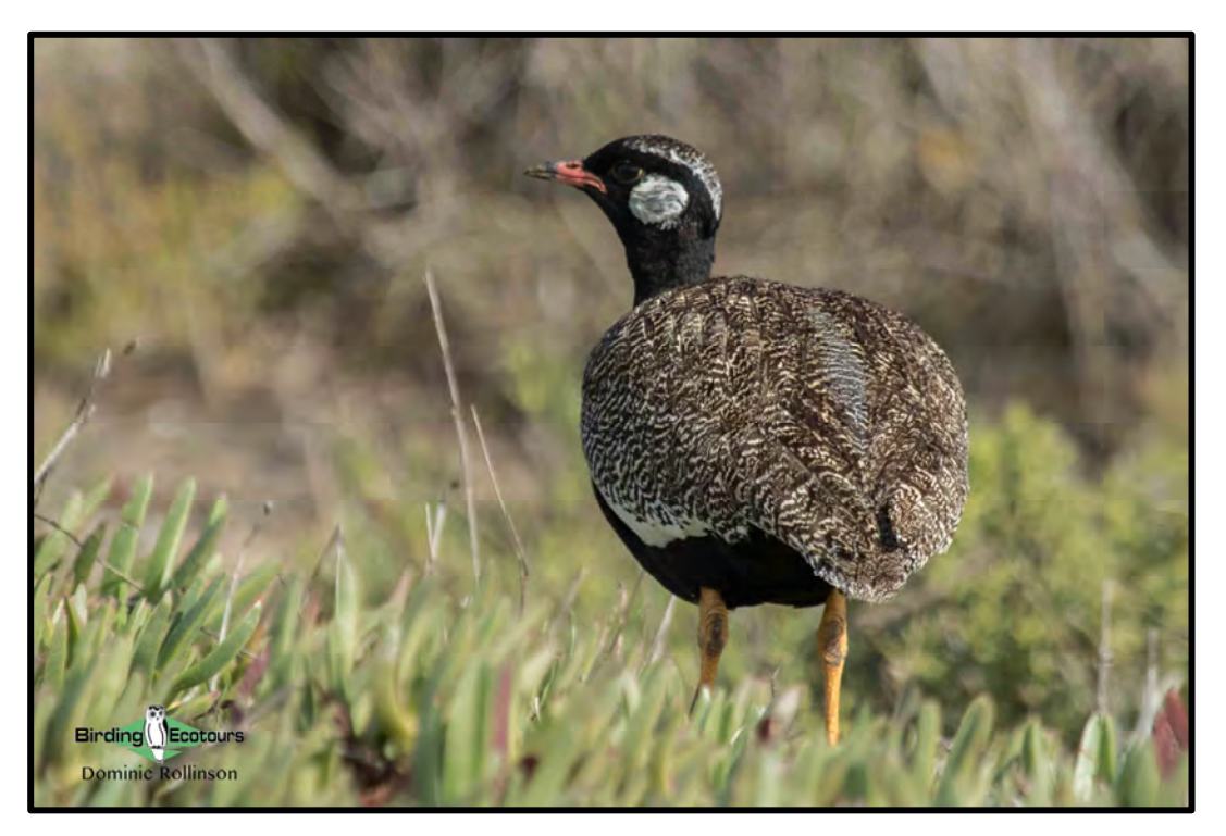
Southern Black Korhaan was seen on the west coast.

Once in the West Coast National Park we headed to Abrahamskraal bird hide, which overlooks the only freshwater in the park. Here we found Yellow Canary , Cape Weaver , African Swamphen , Black Crake , and White-throated Swallow , and, just as we were leaving, we had amazing views of an incredibly confiding African Rail . Later in the afternoon we stopped at Seeberg hide, which overlooks some mudflats within the huge Langebaan Lagoon. Here we found an assortment of shorebirds, including Whimbrel, Eurasian Curlew, Grey, Common Ringed, Kittlitz's , White-fronted , and Three-banded Plovers , Ruddy Turnstone , and Common Greenshank . The tern roost had large numbers of Greater Crested , Caspian , and Sandwich Terns and a single Common Tern . Other good birds seen throughout the park included Cape Penduline Tit , Chestnut-vented Warbler , Grey-winged Francolin , and great sightings of at least two Black Harriers !