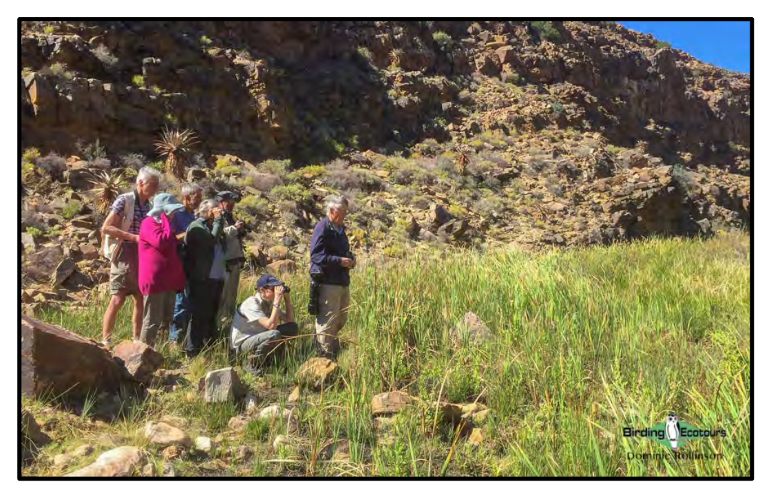
Waiting for a flufftail!

This morning we headed back to the reedbeds to have another crack at Red-chested Flufftail. As we arrived at the site we flushed a couple of African Snipes and then began the vigil of waiting for the flufftails to show themselves. After a long wait a couple of us managed brief views of a single male Red-chested Flufftail as it briefly crossed the path.