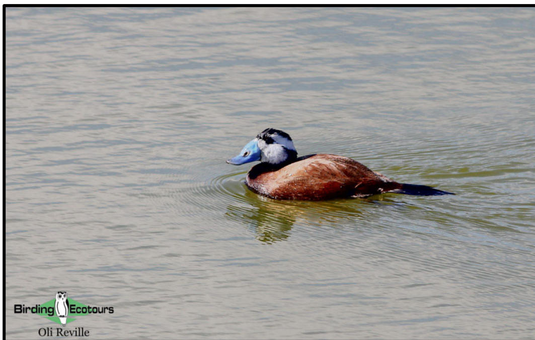
White-headed Duck will be a target during the tour.