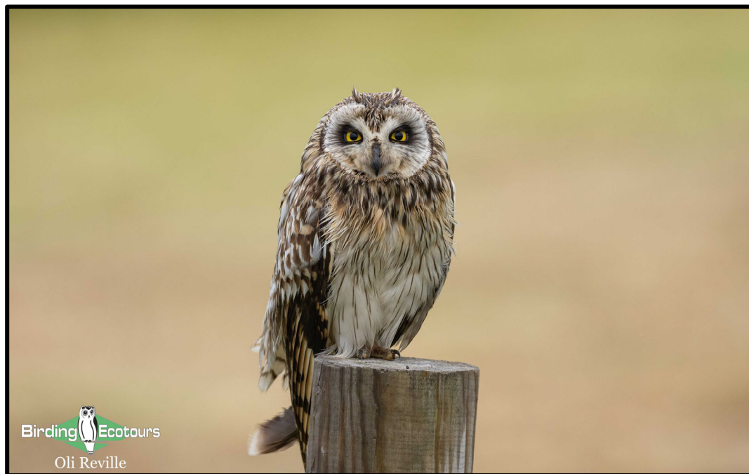
The coastal plains are an excellent place to find the stunning Short-eared Owl .

The final area we will visit in this part of the country is the vast Durankulak Lake . This is a vitally important migration stopover point but is also very productive in winter. It is here that we will observe the greatest concentrations of geese so far, and hopefully add the Vulnerable ( BirdLife International ) Lesser White-fronted Goose to our list. This area is also good for birds of prey like Long-legged Buzzard and Rough-legged Buzzard . Sadly, this will bring our tour to an end and we will fly from Varna to Sofia and have one final birding session in Sofia ahead of our flights home.