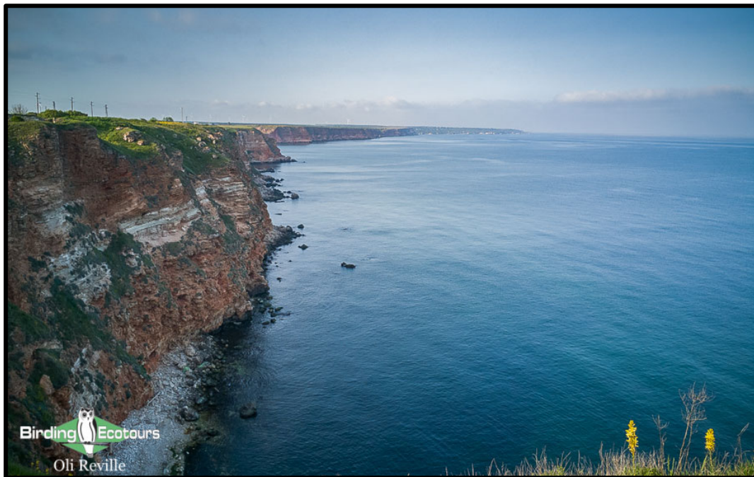
Cape Kaliakra, along the Black Sea coast, has amazing cliffs.

Overnight: Guest House Nash Dom, Kavarna Каварна