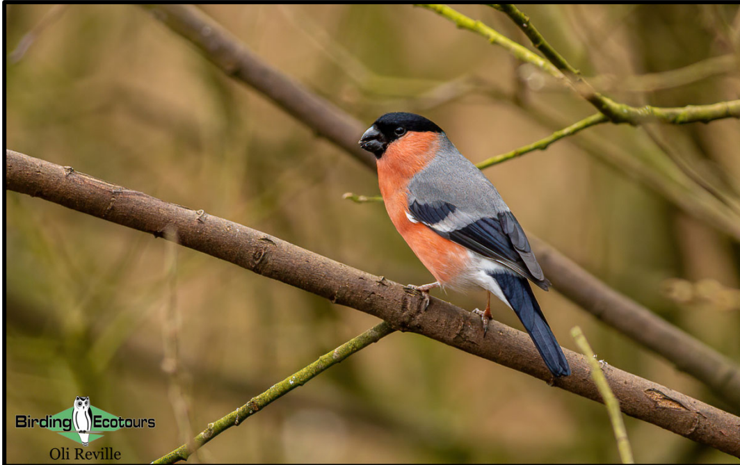
The gorgeous Eurasian Bullfinch is possible during this tour.

Finally, in recent years the lake has held rare species including Great Bustard , Moustached Warbler , and Pallas's Gull and so there is always the chance of something unexpected to turn up while we are here, we will keep our eyes peeled!