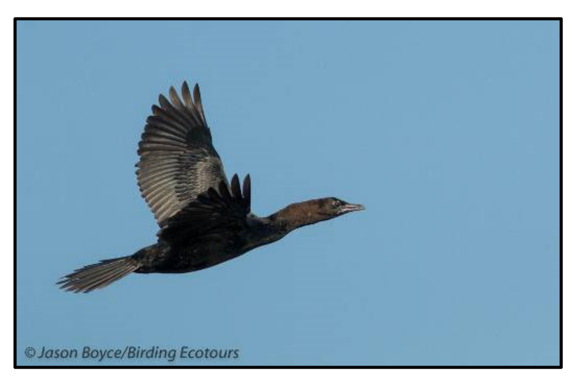
Pygmy Cormorant is a great bird for Europe.

plus Crested Lark, Syrian Woodpecker, Lesser Spotted Woodpecker, Little Owl, Northern Raven, the brilliant Blue Rock Thrush, and a smart-looking Long-legged Buzzard.