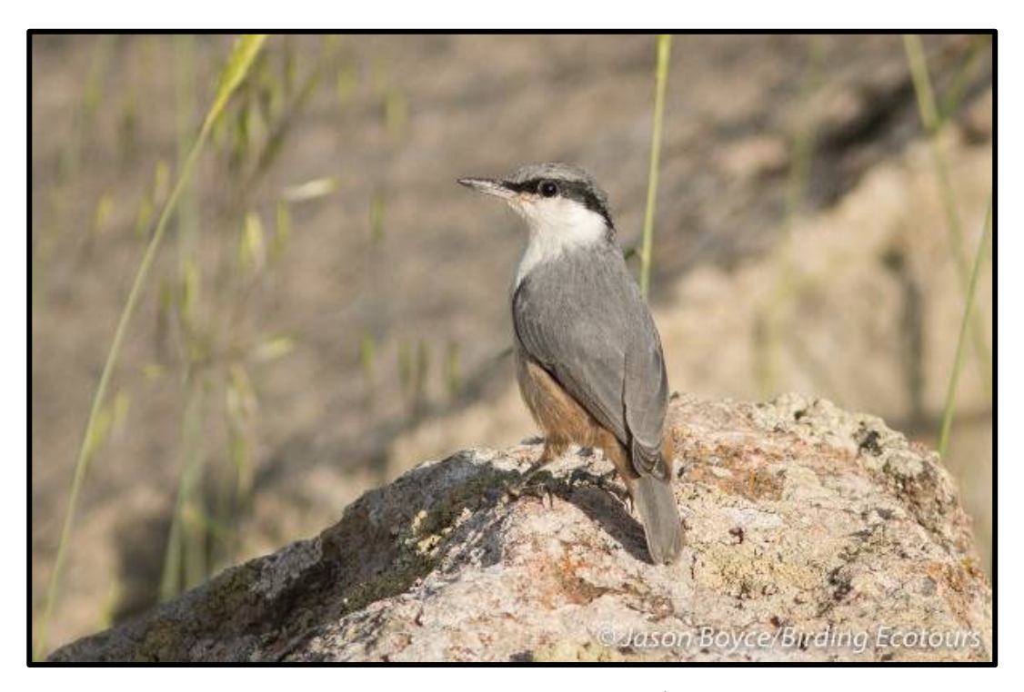
Western Rock Nuthatch gave us some very good viewing opportunities.

Today was to be our last full day's birding, and so we had a few things in mind, but mostly just set out to enjoy the last day of what had been a fabulous birding adventure. We started off with a family of really obliging Sombre Tits and a little further up the road managed both Western Rock Nuthatch once again and Rufous-tailed Scrub Robin. Eastern Orphean Warbler was heard a couple of times along the track and took some work before any good sightings were had. Masked Shrike and Olive-tree Warbler were once again active, while Common Nightingale and Cetti's Warbler made themselves heard. We spent quite some time staking out an area in some olive groves in order to get some visuals of the elusive Middle Spotted Woodpecker. The woodpecker kept landing behind stands of trees, but after a while we managed to see it climbing up some branches or flying across the road in front of us. We headed through some villages into the hillsides and found the likes of Alpine Swift, Eurasian Hoopoe, Short-toed Snake Eagle, and Eastern Olivaceous Warbler, as well as two separate European Honey Buzzards. Our last species, of which we eventually got some really nice pictures, was Subalpine Warbler, a stunning Sylvia warbler, to finish proceedings.