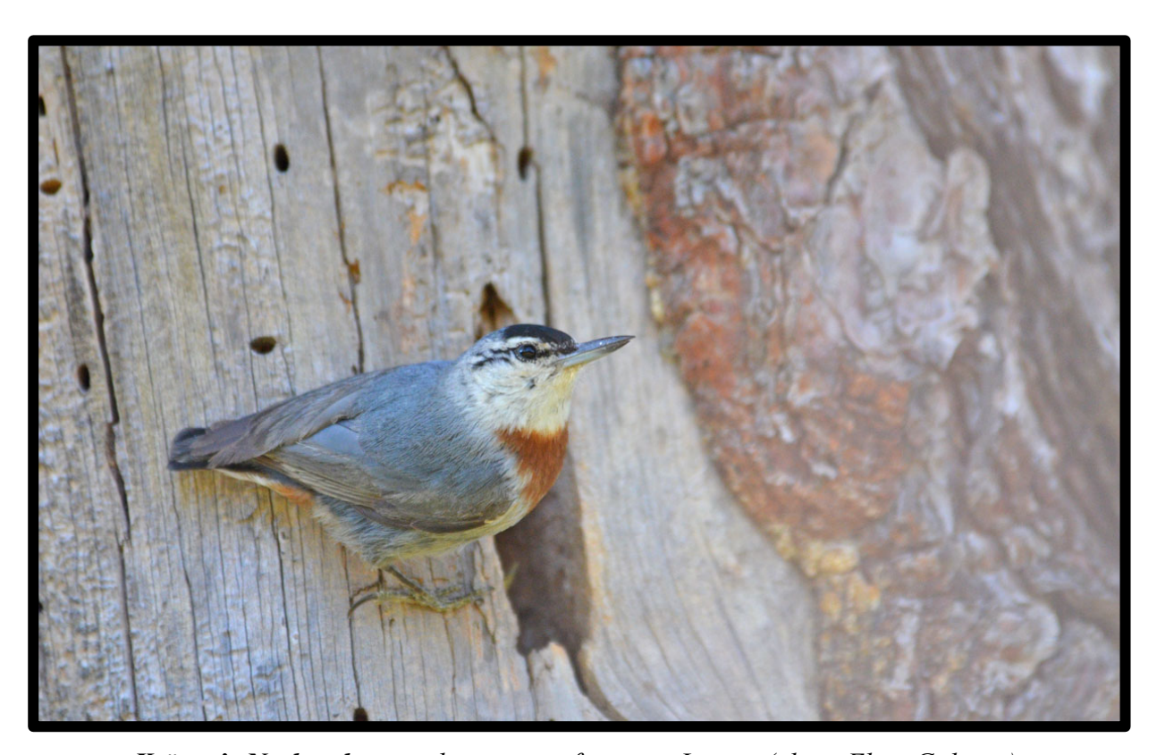
Krüper's Nuthatch was a big target of ours on Lesvos.