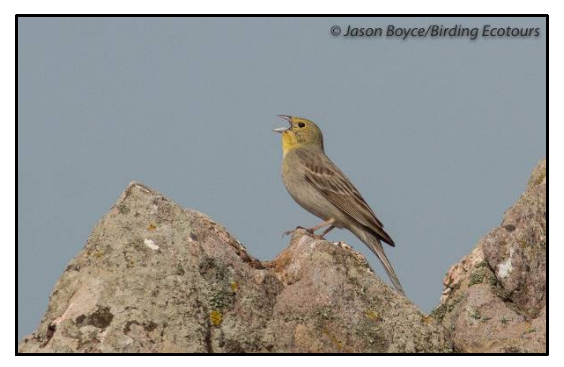
Cinereous Bunting is a highly sought-after species in the eastern Mediterranean.