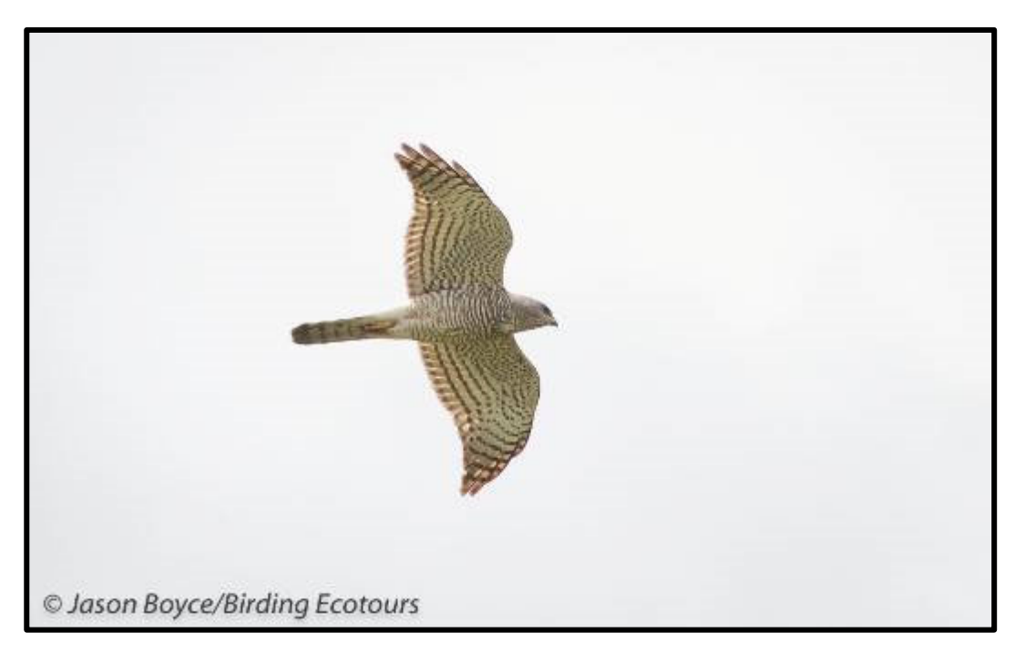
Watching displaying Levant Sparrowhawks was a tour highlight.

the likes of Western Rock Nuthatch and some raptors. We did well in the general area, managing to find Cirl Bunting, Subalpine Warbler, Black-eared Wheatear, a very brief view of Black Redstart, and Common Buzzard, as well as Short-toed Snake Eagle. One of the highlights of the trip in fact was watching some territorial Levant Sparrowhawks in some aerial displays as well as some aerial duels in the area of the quarry.