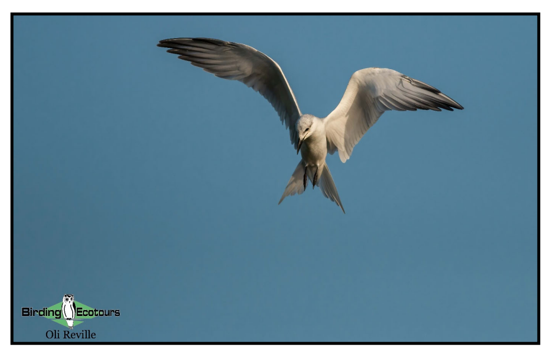
A typical sight involving Gull-billed Tern . They love to forage over agricultural fields.

Leaving Kavala behind we headed to the delta habitats of Nestos and Evros. Our first stop was at the Nea Kessani salt pans. Driving in we picked up Zitting Cisticola , Whinchat , and Bimaculated Lark throwing around some mimicry. In the summer the pans are home to good numbers of Greater Flamingos , shorebirds, and other waterfowl; some of the species we found here were Black-winged Stilt , Eurasian Oystercatcher , Little Ringed and Kentish Plovers , Curlew Sandpiper , Little Stint , Dunlin , Ruff , and Common Redshank . A group of four Gull-billed Terns was feeding over a nearby field on our way out.