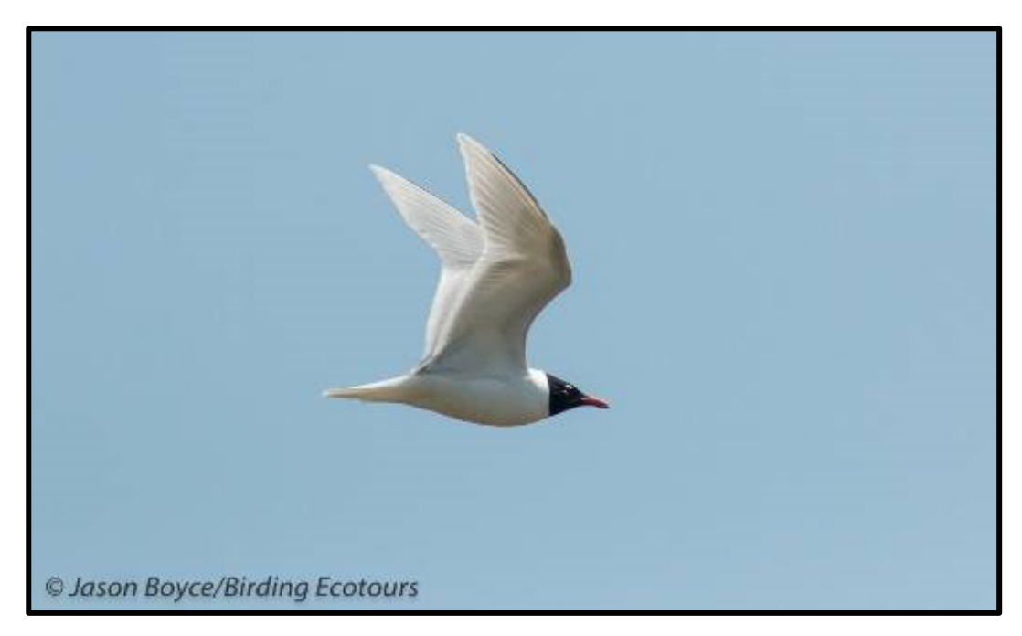
The exquisite breeding-plumaged Mediterranean Gull is a sight to behold.

and shrubs alongside the roads. We were not disappointed and had both males and females pose fairly well for the cameras. We also had the likes of European Turtle Dove, Common Reed Bunting, Glossy Ibis, Great Reed Warbler, Squacco Heron, and Purple Heron.