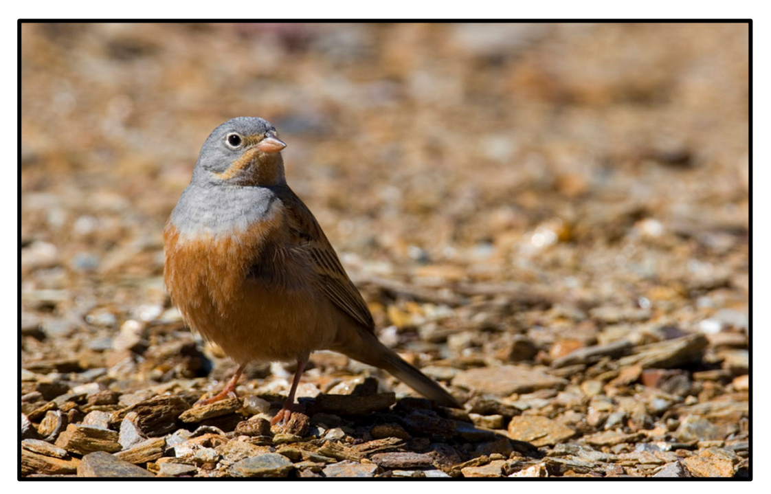
The gorgeous Cretzschmar's Bunting showed well.

Swift, European Shag, Eurasian Crag Martin, Blue Rock Thrush, Short-toed Snake Eagle, and Yelkouan Shearwater offshore while doing some sea-watching. Unanimously, today was one of the most enjoyable days of the trip.