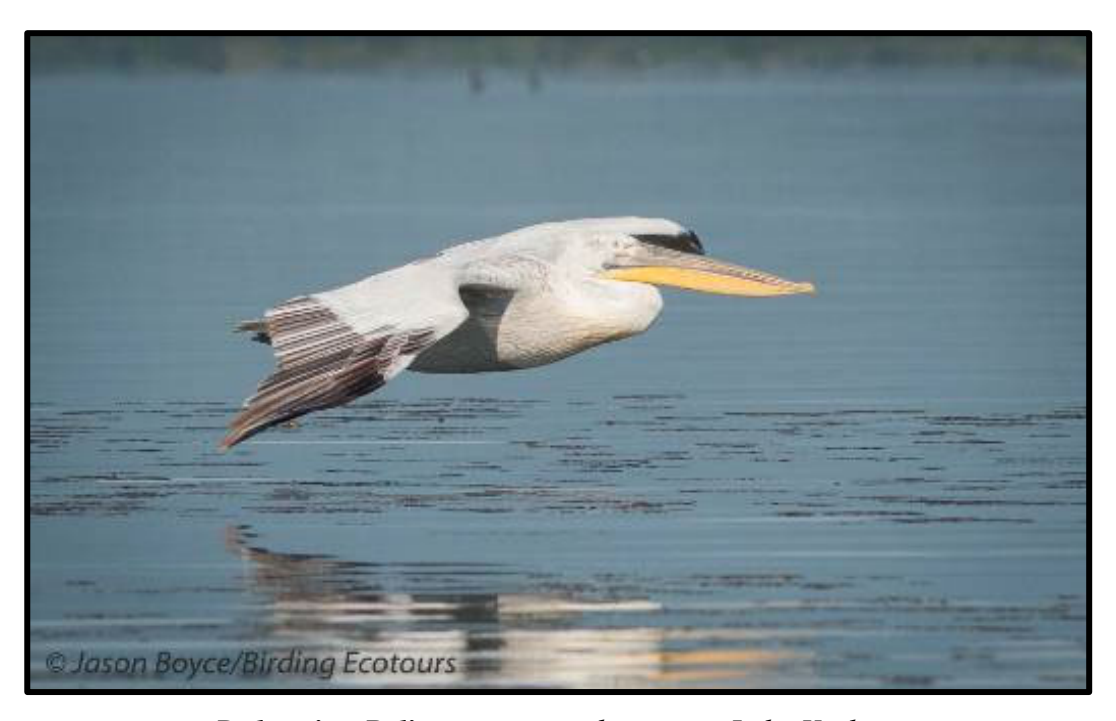
Dalmatian Pelican is a prized target at Lake Kerkini.

A fairly early start in Kerkini allowed us to catch some of the morning light, and with that came a lovely pair of Red-footed Falcons perched up on some of the telephone lines. It was also a good day for Cetti's Warbler – a very confiding individual singing his lungs out gave us a bit of a show and even allowed for some 'in the open' photographs, a real treat from a master skulker. The morning's birding was mainly around the eastern bank of Lake Kerkini; here we had our first taste of this beautiful lake and the birds that call it home for the summer. Species that entertained us that morning included some real European specials. Dalmatian Pelican and Pygmy Cormorant both showed well that morning along with other waterfowl, such as Great Cormorant, Great White Pelican, Great-crested and Little Grebes, Little Bittern, Eurasian Spoonbill, Squacco and Purple Herons, and Black-crowned Night Heron. Eurasian Golden Oriole, Common Cuckoo, and Common Nightingale were all in full song throughout both days around Kerkini; sightings of these species were not too common, though.