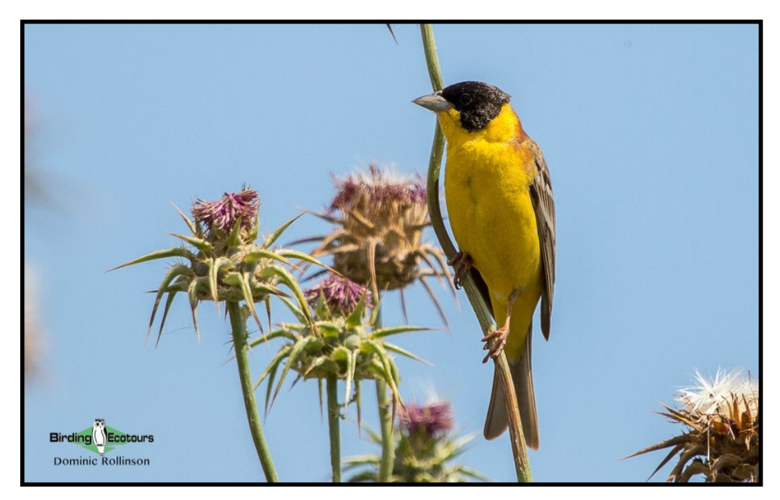
The stunning Black-headed Bunting was one of the 'birds of the trip'.

Looking back on this fantastic tour; the combination of Greece's rich history, fascinating archaeological sites, and western Palearctic spring migration really made for a superb trip. Many thanks to everyone for an unforgettable trip, and happy birding!