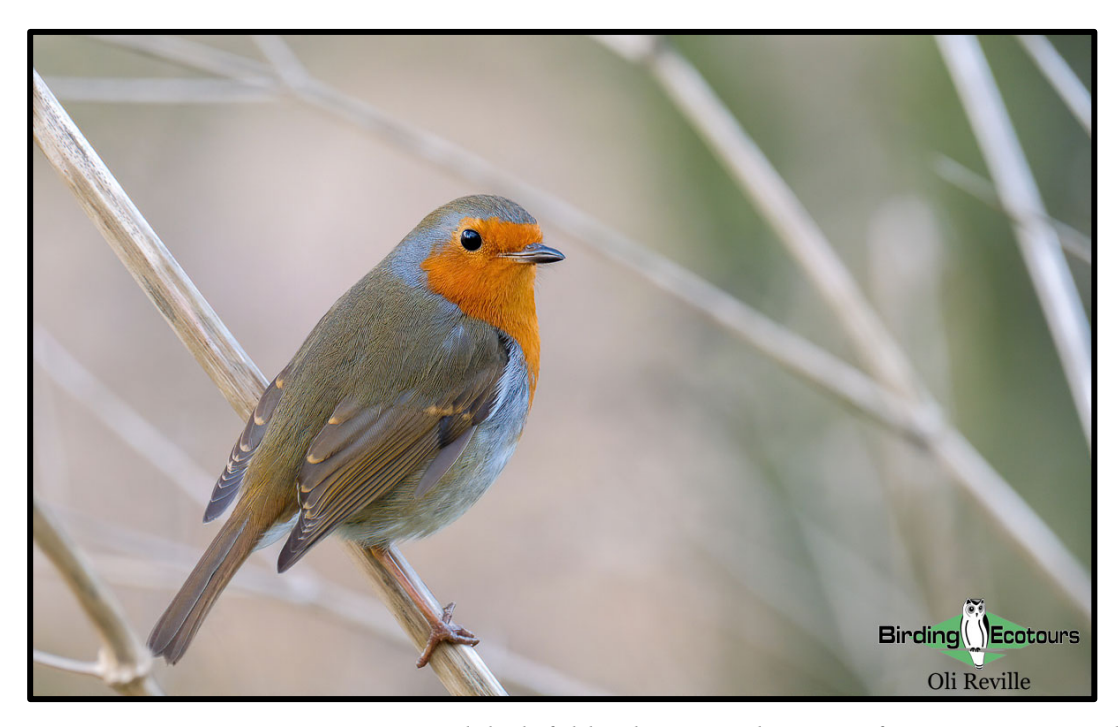
European Robin is a common yet delightful bird to see. They are often quite tame and approachable.

Athens, which can be considered the historical capital of Europe, has an incredible charm. Walking the streets of this modern metropolis allowed us to get the true feel of the city. After having visited the Acropolis the night before, we visited some of the surrounding area and many other important sites, such as the Areopagus hill (from where the below photograph of the Acropolis was taken), Philopappou Hill, the Roman Agora, the Temple of Olympian Zeus, as well as the Athens National Garden. Some of the species that caught our attention throughout the day were Eastern Olivaceous Warbler , Common Blackbird , European Robin , and Eurasian Magpie . An authentic Greek-style dinner in the Plaka neighborhood was complemented by the beauty of the Acropolis under floodlights.