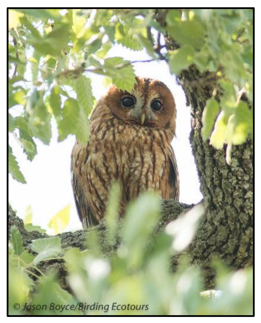
We had some incredible views of a day roosting Tawny Owl.