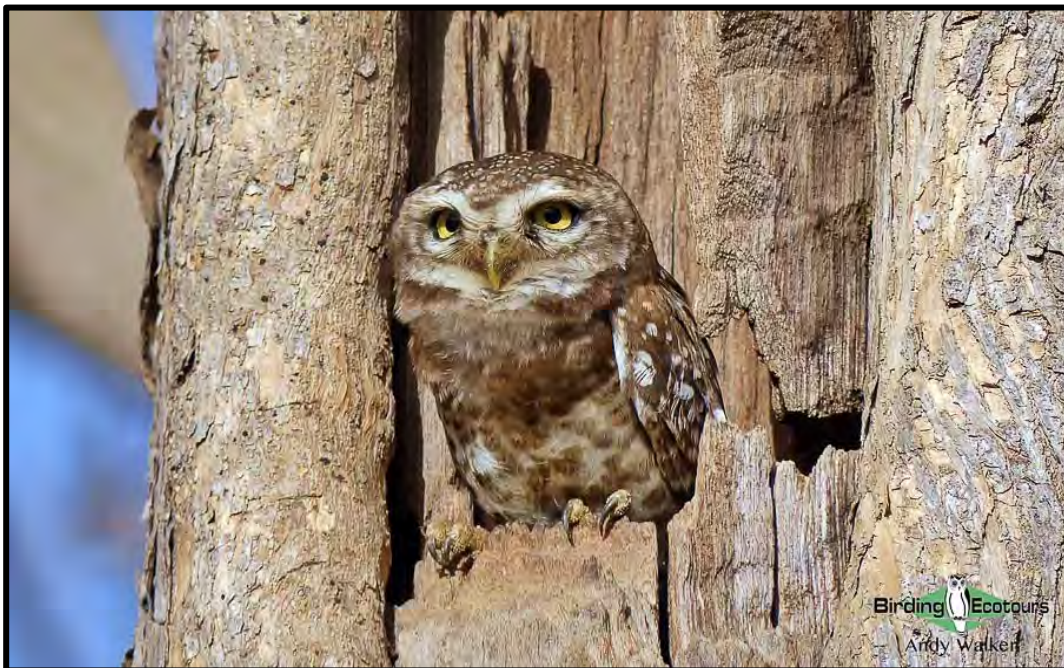
Spotted Owllet is a common species but always nice to see.

It was light early, so we were up early too. Well, we were awake before it got light due to the calls of Oriental Scops Owl , Asian Barred Owllet , Savanna Nightjar , Indian Cuckoo , and Asian Koel . We had a nice pre-breakfast birding in the grounds of our accommodation, finding numerous birds. The best of these included a pair of Great Hornbills at their nest, plenty of Red-breasted Parakeets , Yellow-footed Green Pigeon , Common Hill Myna , Great Myna , Chestnut-tailed Starling , Spotted Owllet (as well as seeing the Asian Barred Owllet ), Scarlet-backed Flowerpecker , and Black-hooded Oriole .