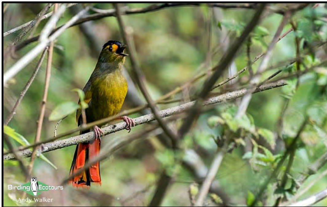
Bugun Liocichla , a Critically Endangered (BirdLife International), range-restricted endemic gave us some good views as we searched for Spotted Elachura.

We spent the morning birding around the Lama Camp area. Although we were unable to find any elachuras we did find a number of highly sought-after species, such as the Critically Endangered (BirdLife International) Bugun Liocichla (an endemic laughingthrush found only in the Eaglenest area). While walking here we found Bhutan , Scaly , Blue-winged , Striated , and Chestnut-crowned Laughingthrushes , Red-faced Liocichla , Streak-breasted Scimitar Babbler , Beautiful Sibia , Whiskered Yuhina , Streak-throated Barwing , Rusty-fronted Barwing , Bar-throated Minla , Red-tailed Minla , and Striated Bulbul . Both Red-headed and Grey-headed Bullfinches were found feeding in thistle seed heads, and we kept bumping into a mixed flock containing Ashy-throated , Buff-barred , Yellow-browed , Blyth's Leaf , and Lemon-rumped Warblers , Black-throated Bushtit , Yellow-cheeked and Green-backed Tits , White-throated Fantail , Green-tailed Sunbird , Black-faced and Grey-cheeked Warblers , Rufous-bellied and Crimson-breasted Woodpeckers , Short-billed Minivet , Blyth's Shrike-babbler , Little Bunting , White-tailed Nuthatch , Grey-winged Blackbird , and Rufous-breasted Accentor .