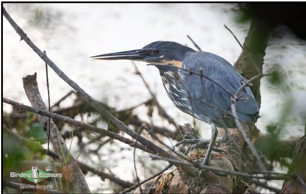
Keoladeo National Park can produce sightings of three bitterns; pictured here is Black Bittern .