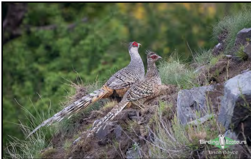
A pair of the prized Cheer Pheasant found above our base in Pangot