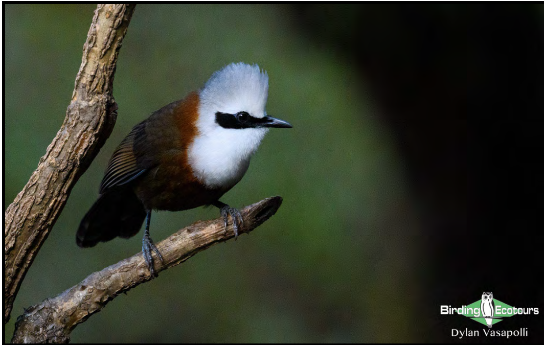
White-crested Laughingthrush can be seen moving through the undergrowth.