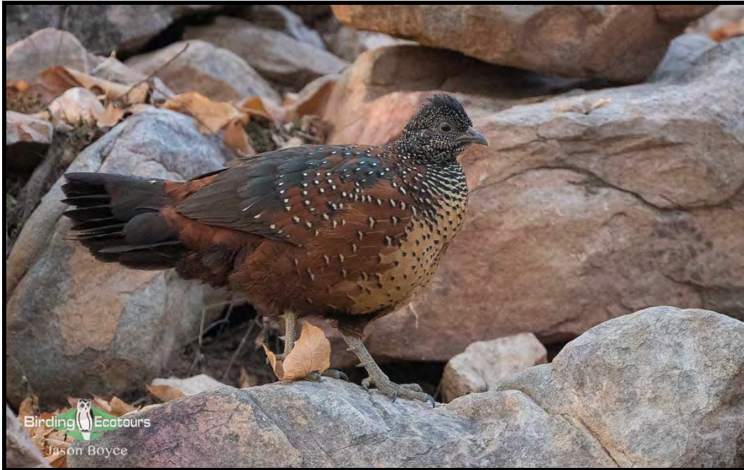
Certainly one of our biggest avian targets in Ranthambhore, Painted Spurfowl