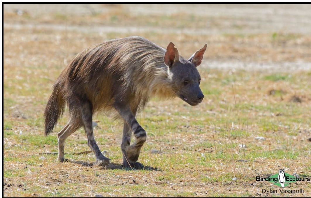
The Kgalagadi Transfrontier Park is one of the best places to find Brown Hyaena .

The vast Kalahari area is semi-desert, where some very tough African mammals can be found relatively easily. Moreover, it has a lot of mammals (notably smaller ones) that are only very rarely seen anywhere else and most certainly are not found on your typical Serengeti or Kruger safari. We invite you on a spectacular African experience that you will not forget in a hurry.