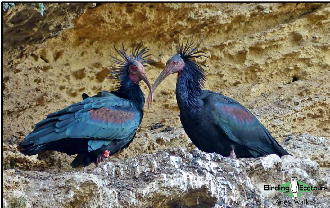
The Northern Bald Ibis is one of the world's rarest species, and arguably one of its most strange-looking.

After lunch we will head north to the remote coastal areas around Tamri. Here we will come across many species we have seen previously, but the real purpose of our visit is to find the bizarre-looking Northern Bald Ibis . This Endangered ( BirdLife International ) species is one of the world's rarest birds, with Morocco holding 95% of the current wild population, or an estimated 700 birds.