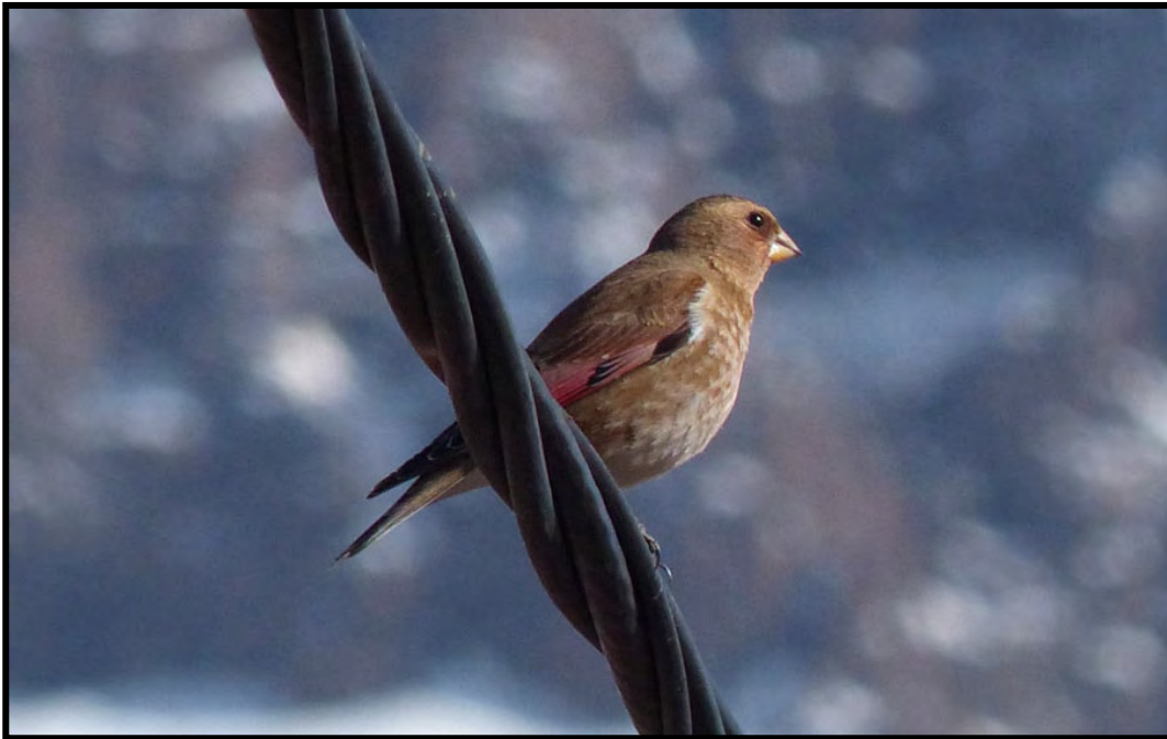
African Crimson-winged Finch is a real special of the Hight Atlas Mountains and a near-endemic (photo Brahim Mezane).

After an early breakfast we leave the mountains behind, perhaps pausing again en route for Levaillant's Woodpecker as well as African Blue Tit , and the distinctive local races of Red (Common) Crossbill (the poliogyne subspecies) and Common Chaffinch (the africana subspecies).