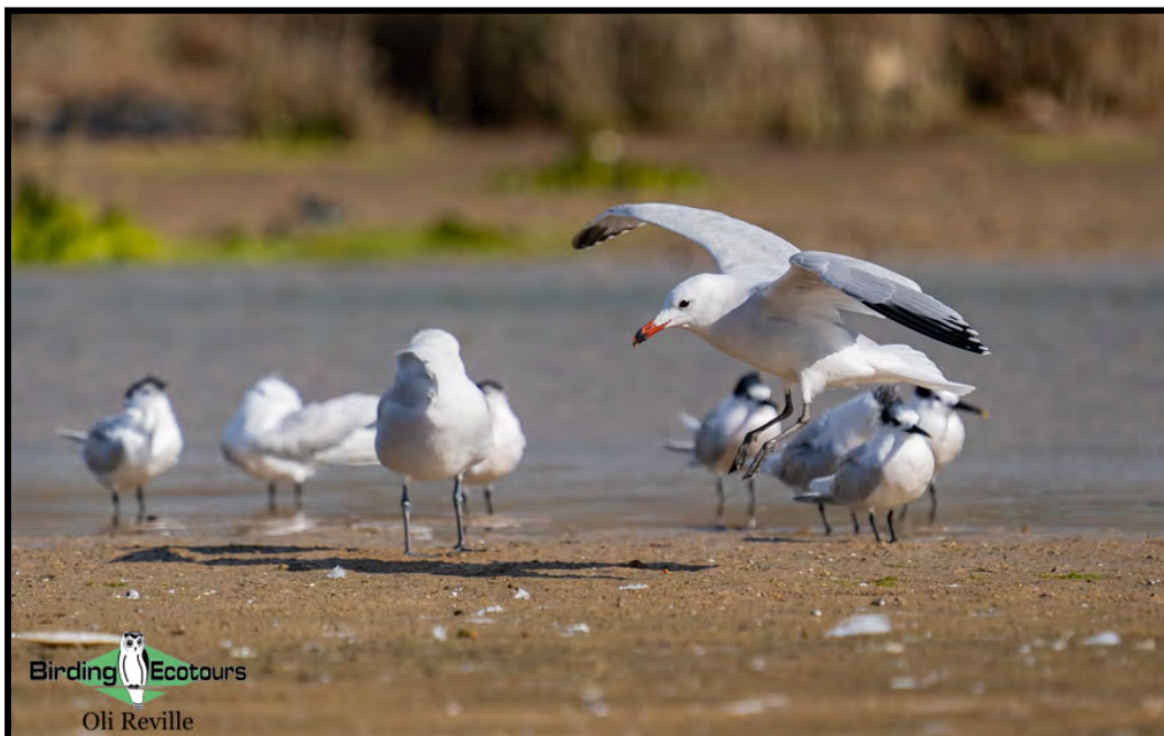
The Atlantic coast near Agadir is excellent for gulls and terns with the rare Audouin's Gull (front) a highlight.

Other notable species here include Garganey , Slender-billed Gull , Gull-billed Tern , Caspian Tern , Little Bittern , Glossy Ibis , Eurasian Spoonbill , Kentish Plover , Cream-colored Courser , Western Olivaceous Warbler , Western Black-eared Wheatear , Great Spotted Cuckoo , Lesser Short-toed Lark , and much more.