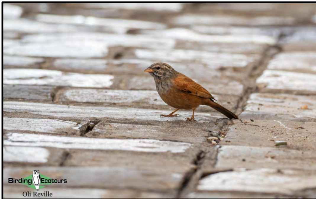
A common sight in Morocco but still very exciting for visiting birders – House Bunting.