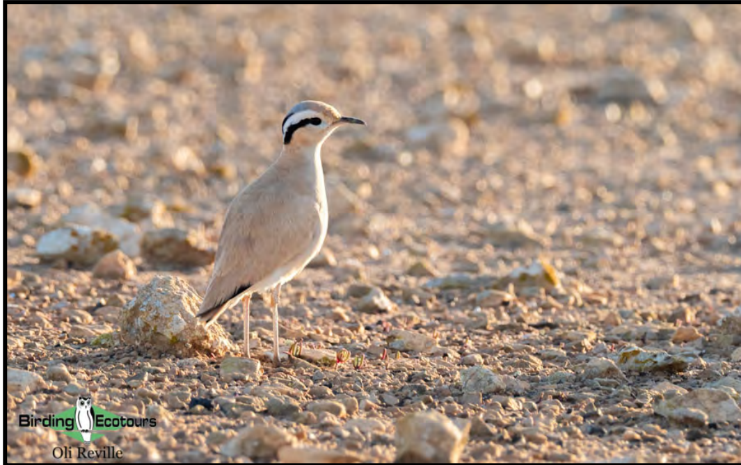
The Tagdilt Track is a great location for seeing the stunning Cream-colored Courser.