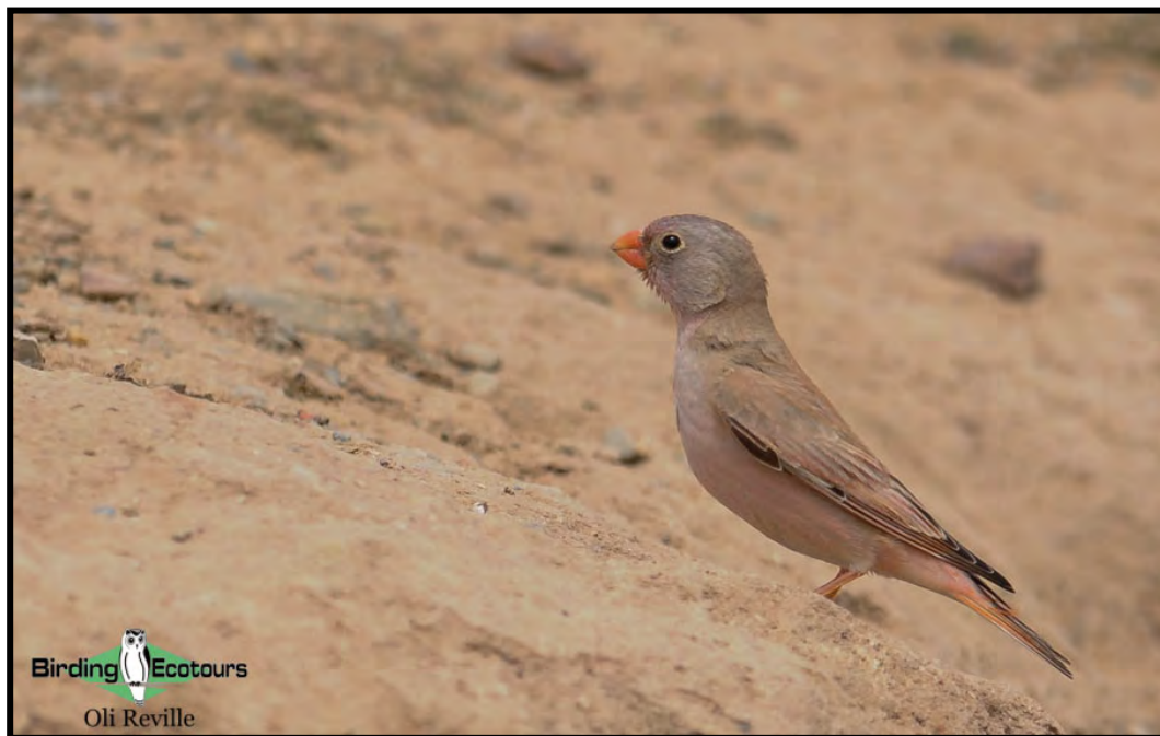
The subtly attractive Trumpeter Finch will be a feature on most days of our tour.