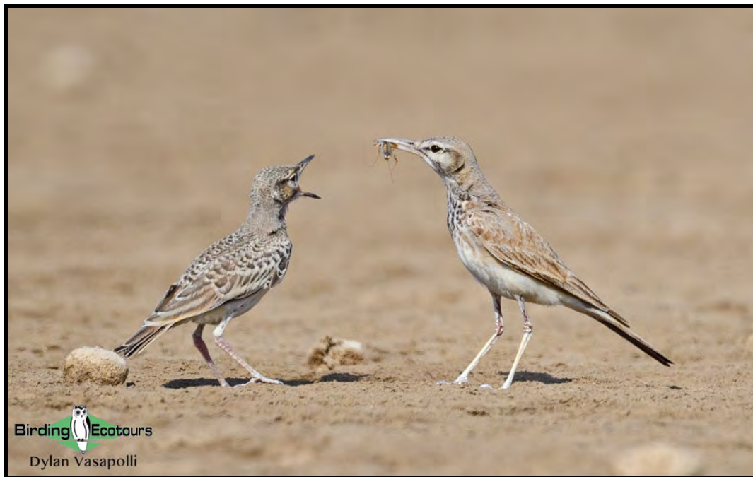
Greater Hoopoe-Lark is a highly sought-after and tough target in the desert.

As we move deeper into the desert some really special birds become possible, including Desert Sparrow , Greater Hoopoe-Lark , Thick-billed Lark , Temminck's Lark , Bar-tailed Lark , Dunn's Lark , Tristram's Warbler , and with luck, the increasingly rare Houbara Bustard , a species which has declined rapidly due to pressure from hunting. We will also target other exciting species such as Egyptian Nightjar , multiple sandgrouse species, Cream-colored Courser , Pharaoh Eagle-Owl , Long-legged Buzzard , and much more. Here we will also look for the Streaked Scrub Warbler , a prized monotypic family.