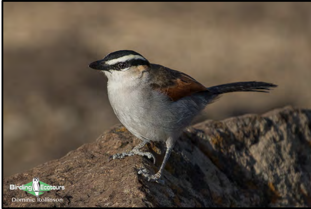
Black-crowned Tchagra is a particularly great bird for the Western Palearctic region.