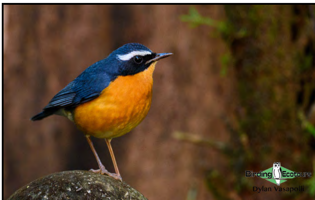
We will look on the ground for the gorgeous Indian Blue Robin .