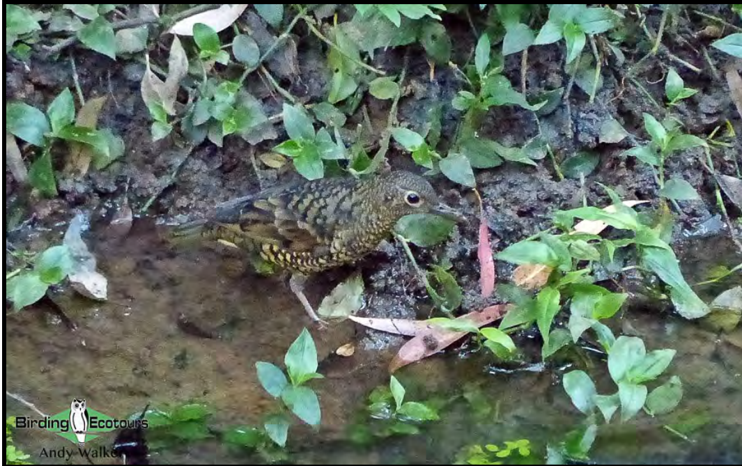
The secretive Sri Lanka Thrush , another highly sought endemic that skulks along the ground