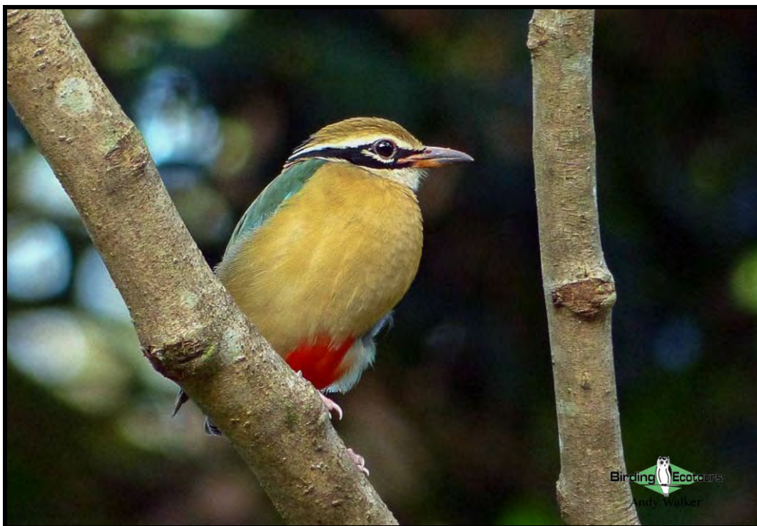
The stunning Indian Pitta spends its non-breeding season in Sri Lanka.