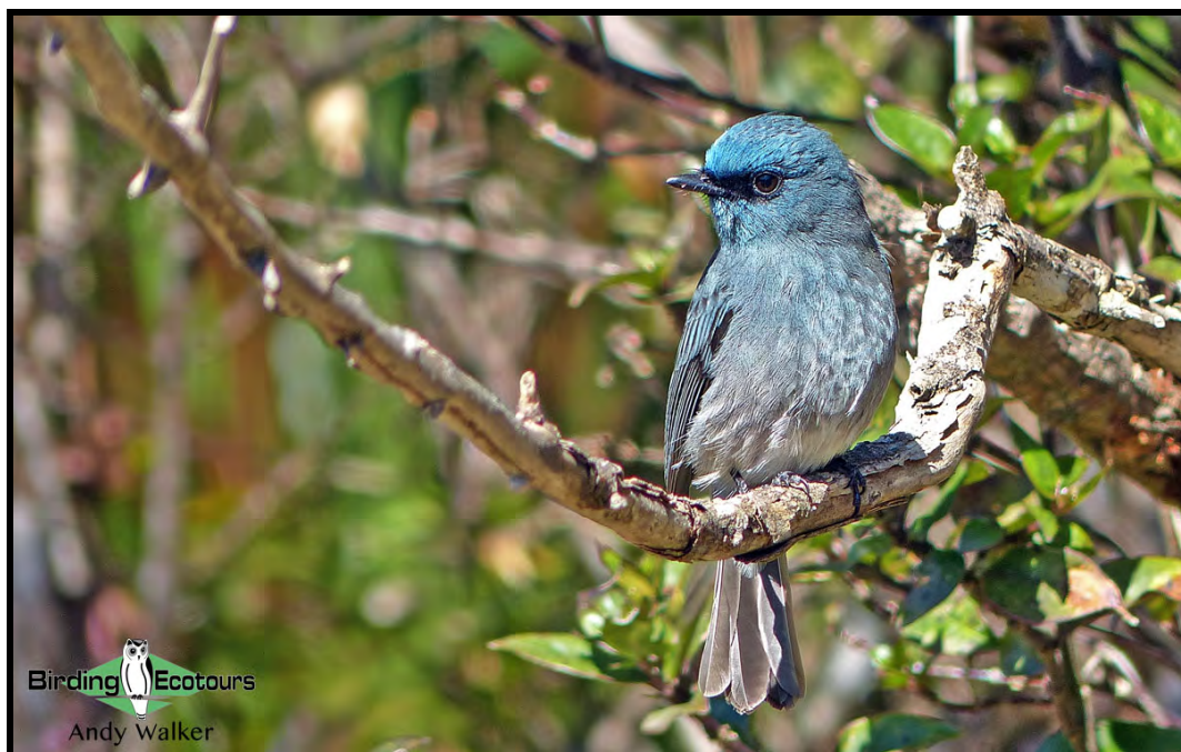
The endemic Dull-blue Flycatcher is found in the mountains of Sri Lanka.

In the morning we will be birding for any missing montane specials before driving to Kandy at an elevation of 477 meters (1,565 feet), the last Sinhalese kingdom in Sri Lanka, which was ceded to the British in 1815. En route we will pause at a tea factory to see the recently split Hill Swallow , which nests inside the factory. After a cuppa we will reach our accommodation, which is a hotel situated close to birding sites and the sacred city of Kandy, a UNESCO World Heritage Site.