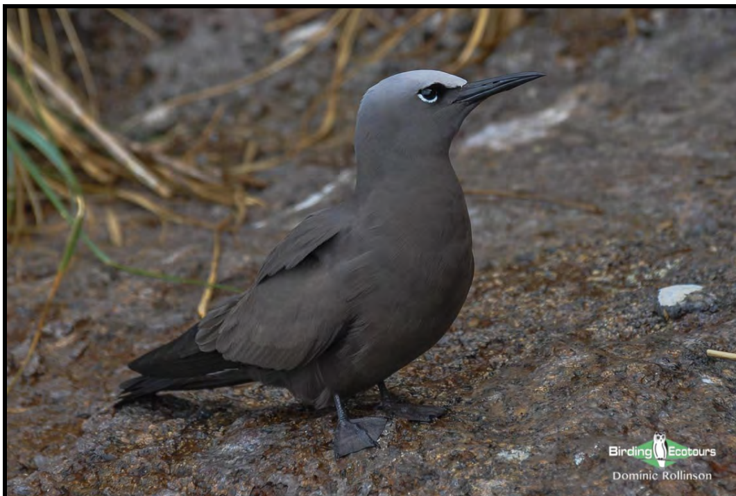
Brown Noddy should be seen on our whale-watching tour.

planet – the magnificent and unrivaled Blue Whale , which can reach lengths of over 30 meters (over 100 feet)! Seeing these huge creatures will be hard to beat, although we could also possibly find Sperm Whale , Bryde's Whale , Orca (Killer Whale), Short-finned Pilot Whale , Risso's Dolphin , Spinner Dolphin , or Long-beaked Common Dolphin . A range of seabirds are possible (e.g. Bridled Tern , Pomarine Jaeger (Skua), Wilson's Storm Petrel , Brown Noddy , etc.); however, our main focus of the pelagic is on the sea mammals.