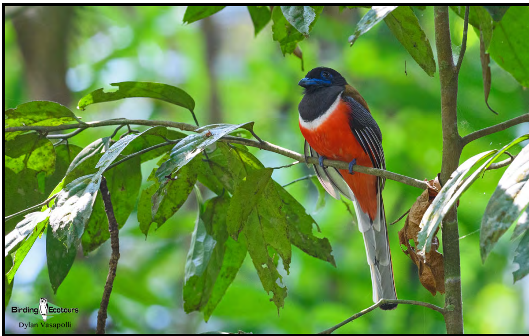
Found only in Sri Lanka and the Western Ghats (in India), Malabar Trogon is sure to delight.

This tour also offers plenty of wildlife-viewing opportunities with Asian Elephant , the Sri Lankan endemic subspecies of Leopard ( Panthera pardus kotiya ), and Blue Whale all being possible, along with a range of monkeys, squirrels, and deer. The itinerary covers a variety of habitat types, including lowland, monsoon and cloud forests, grasslands, lagoons, coastal mudflats, fresh and brackish waterbodies, imposing riverine woodland, and forest, and will include a pelagic trip off Sri Lanka's southwest coast into the sparkling Indian Ocean.