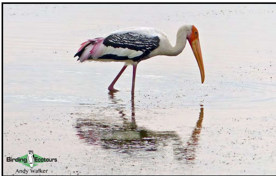
Painted Stork can be seen in Udawalawe National Park.

The birds on offer here include Sri Lanka Woodshrike , White-bellied Sea Eagle , Green Bee-eater , Blue-faced Malkoha , Coppersmith Barbet , Yellow-eyed Babbler , Rosy Starling , Jacobin Cuckoo , Grey-bellied Cuckoo , Jerdon's Bush Lark , Ashy-crowned Sparrow-Lark , Indian Pitta , White-browed Fantail , Little Swift , Brahminy Starling , Paddyfield Pipit , Blyth's Pipit , Orange-breasted Green Pigeon , Spot-billed Pelican , Yellow-wattled Lapwing , Painted Stork , Woolly-necked Stork , Indian Peafowl , Indian Robin , Black-winged Kite , and Indian Stone-curlew . Migrant species like Red-rumped Swallow (with paler red belly and rump), Western Yellow Wagtail , White Wagtail , and Citrine Wagtail may show up too.