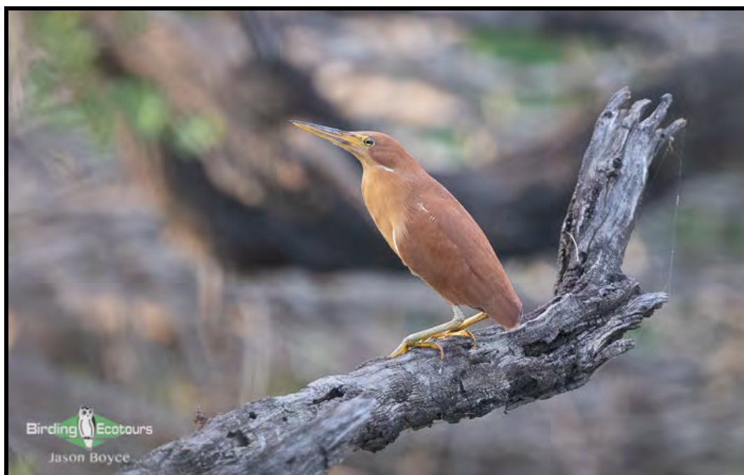
Cinnamon Bittern can be seen at Bundala National Park.

Western Reef Heron, Striated Heron, Little Egret, Black-headed Ibis, Glossy Ibis, Eurasian Spoonbill, Black-necked Stork, Little Cormorant, Indian Cormorant, Oriental Darter, Spot-billed Pelican, Yellow-wattled Lapwing, Black-tailed Godwit, Garganey, Northern Pintail, Northern Shoveler, Caspian Tern, White-winged Tern, Whiskered Tern, Common Tern, Greater Crested Tern, Lesser Crested Tern, Little Tern, Brown-headed Gull, and Greater Flamingo. Other species possible in the area include Clamorous (Indian) Reed Warbler, Eurasian Hoopoe, Ashy-crowned Sparrow-Lark, Brown Fish Owl, Yellow-crowned Woodpecker, and Ashy Drongo.