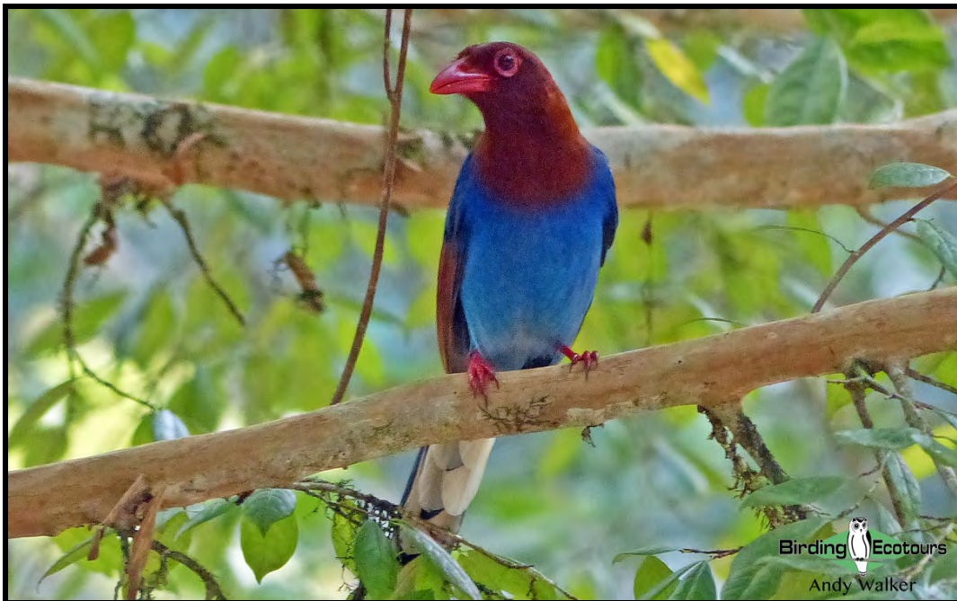
Sri Lanka Blue Magpie is gorgeous and can at times be quiet as it moves through dense vegetation, giving occasional great and close views.

Further target birds we will look for include the montane endemic Sri Lanka Wood Pigeon , which descends to Sinharaja in search of seasonal fruits. With the right technique more