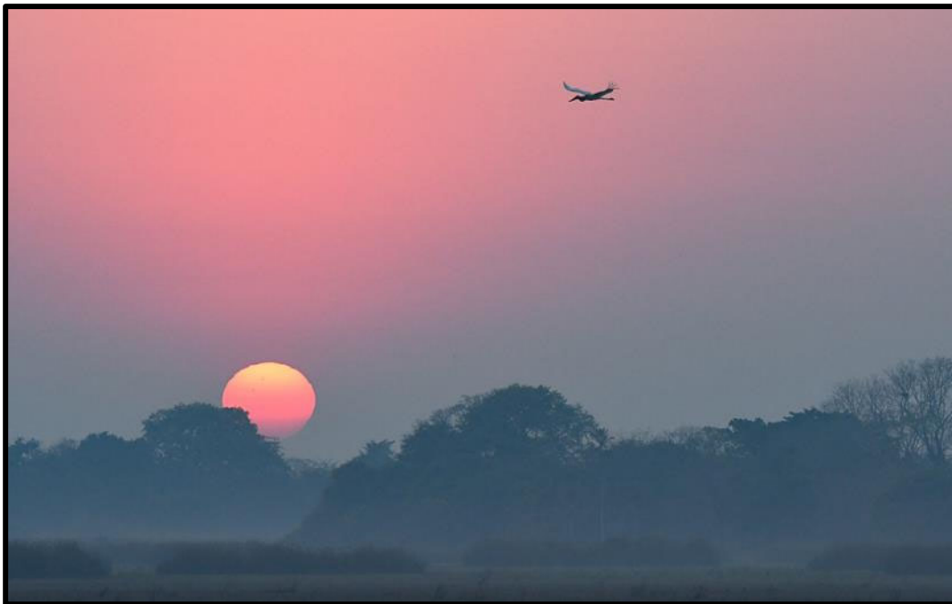
Sunsets in the Pantanal can be stunning!

Overnight: Hotel Pantanal Norte , Porto Jofre