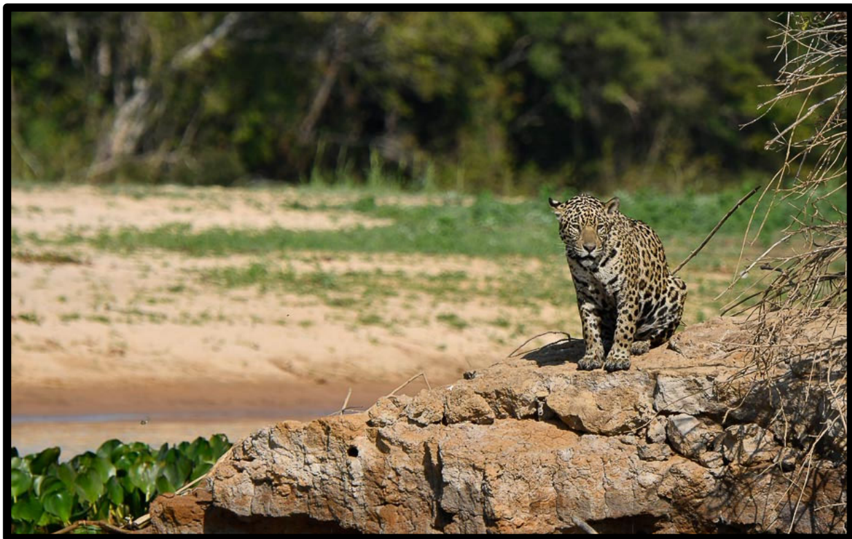
Jaguar is one of the many mammal highlights of this fantastic tour.