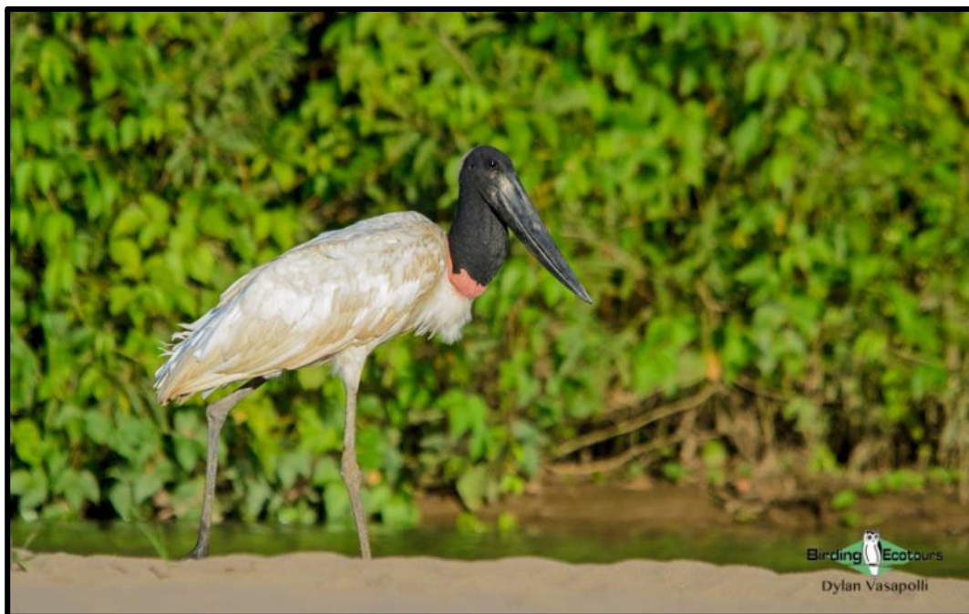
The massive Jabiru can be seen on exposed sandbanks throughout the Pantanal.