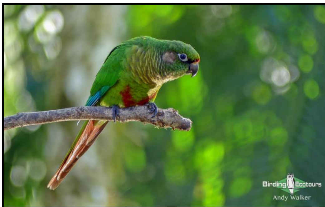
Maroon-bellied Parrot, yet another parrot species we will target on this tour.