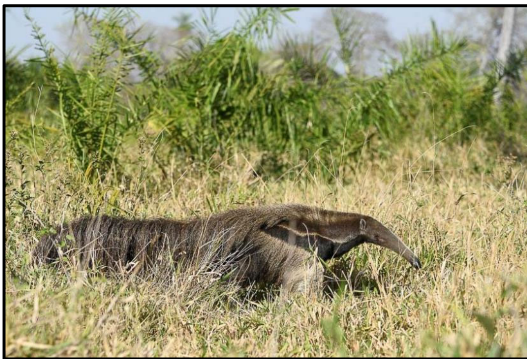
Pousada Piuval offers some of the best chances for Giant Anteater in the Pantanal.

The Pantanal is perhaps South America's greatest wildlife refuge and here we should get daily sightings of Capybara (the largest rodent in the world), primates such as Black-tailed Marmoset , Bearded Capuchin (sometimes treated as a full species here, 'Azara's Capuchin') and Black-and-gold Howler Monkeys . With luck, we might encounter Marsh Deer , Crab-eating Raccoon , South American Coati , Yellow Armadillo , Lowland (Brazilian) Tapir and Giant Anteater .