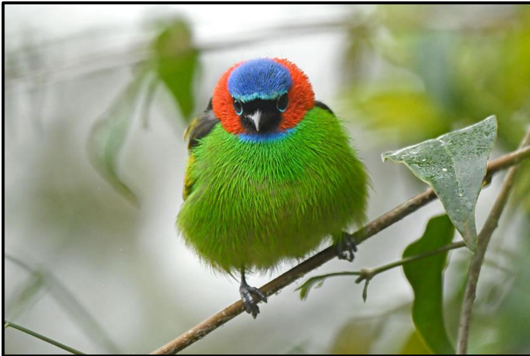
Red-necked Tanager, one of the many brightly colored tanager species we should see on this tour.

The gallery forest in Chapada dos Guimarães can provide species such as Brown Jacamar , Saffron-billed Sparrow , Whooping Motmot , Pheasant Cuckoo and the secretive Sharp-tailed Streamcreeper . The grasslands of Chapada dos Guimarães might provide the restricted Yellow-faced Parrot and, with a lot of luck, the secretive Maned Wolf .