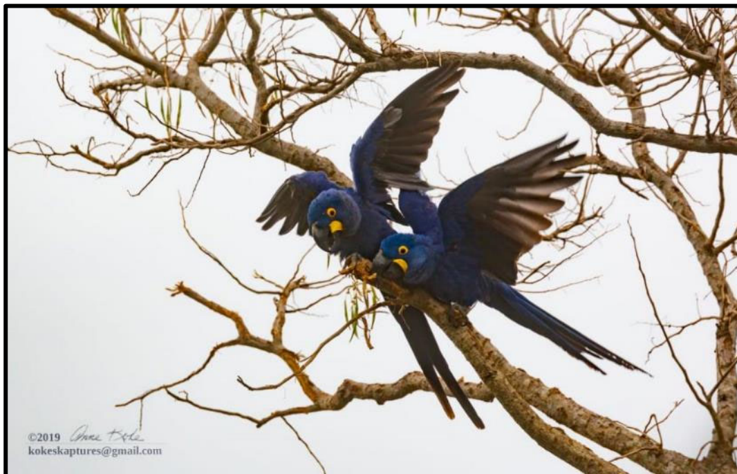
Hyacinth Macaws are often a crowd-favorite in the Pantanal.

We will embark on our birding and mammal adventure by exploring the Pantanal, a vast, seasonally flooded wetland, renowned for its incredible concentrations of birds at the end of the dry season. We schedule this tour during this season, when the fish trapped in the shrinking pools of water attract hordes of herons, egrets, storks, and other wetland species. The star of these huge concentrations is the massive Jabiru , towering over a diverse collection of shorter South American waterbirds, such as Sunbittern , Plumbeous , Bare-faced , Green , and Buff-necked Ibises , Grey-cowled Wood Rail and Southern Screamer . There is normally a large diversity of raptors around too, with Savanna Hawk , Snail Kite , Black-collared Hawk and Crane Hawk regularly encountered. Our river trips provide the opportunity to look for species such as Capped Heron , Sungrebe , the striking Agami Heron , Anhinga and a plethora of kingfishers including Green , Amazon , Ringed , American Pygmy and Green-and-rufous . Other target species include Band-tailed Antbird and, with some luck, the seldom-seen Zigzag Heron . Boat trips along rivers also provide the best chances of seeing Endangered (IUCN) Giant (River) Otters ; the largest otter in the world and one of the 'Big Five' of South American mammals. This is the best place on the planet for seeing Jaguar and during the dry season sightings are almost guaranteed. This humongous cat is probably the star of the entire show on this tour.