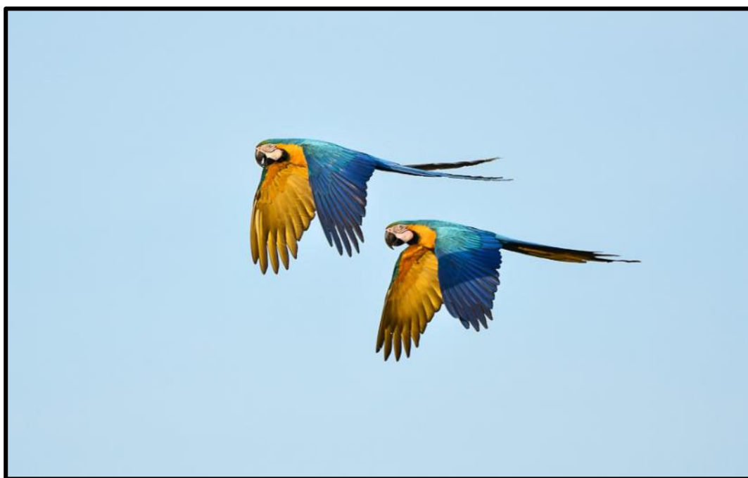
Another huge and brightly colored macaw, this time Blue-and-yellow Macaw.

Overnight: Pousada Piuval Lodge (in superior rooms, when available)