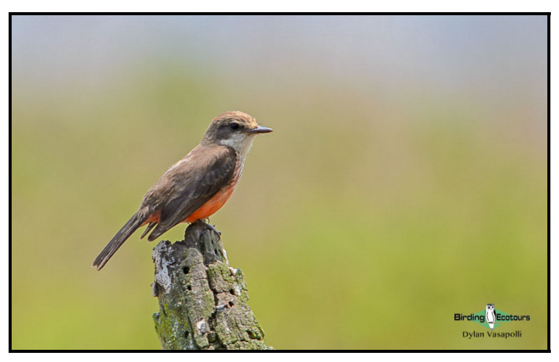
Vermilion Flycatcher, another beautiful species we will be targeting on this extension.