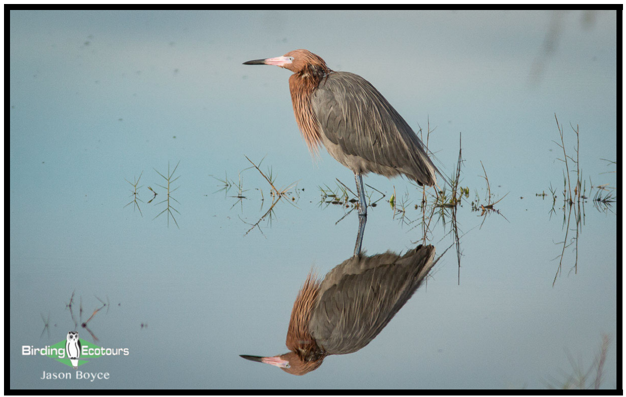
A beautiful reflection of Reddish Egret , which is one of our targets on this tour.

20 – 24 SEPTEMBER 2022 20 – 24 SEPTEMBER 2023