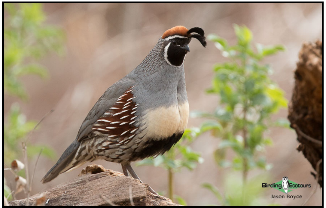
We will be searching for the distinctive-looking Gambel's Quail.

This extension to our <u>Complete California</u> tour can also be booked as a stand-alone tour.