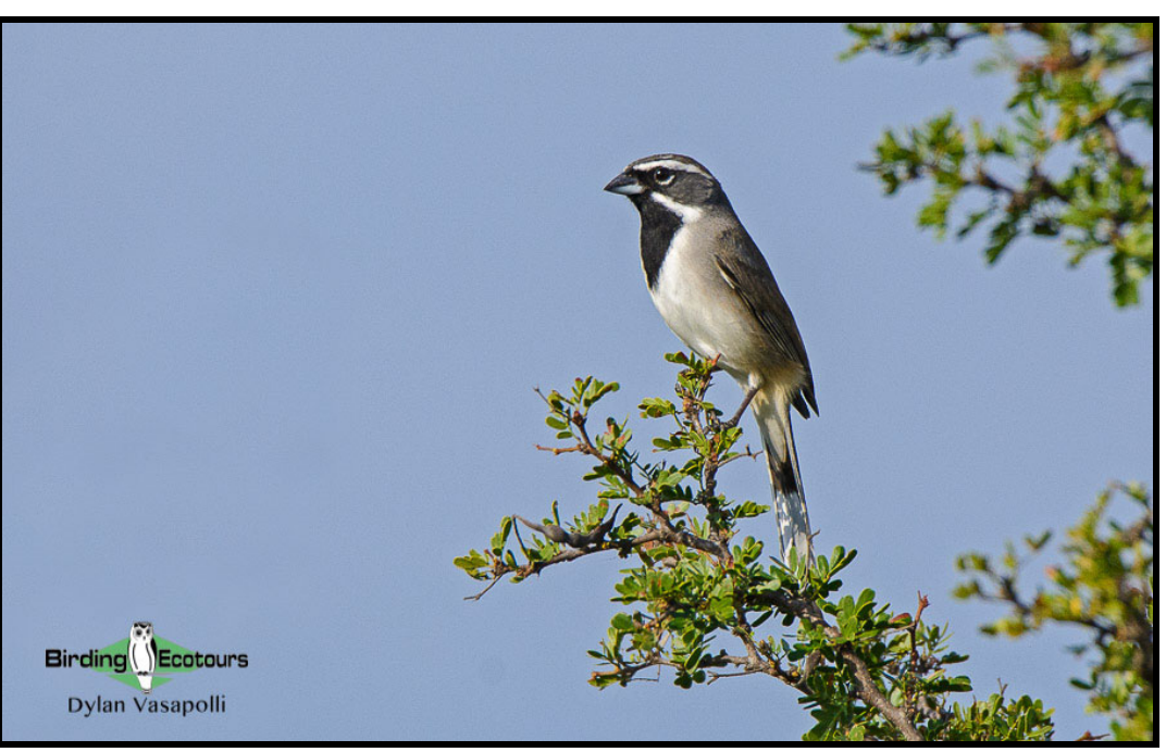
The striking Black-throated Sparrow.