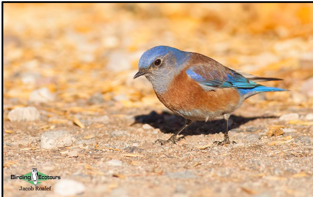
The brilliant color of this Western Bluebird really pops in the sunlight.