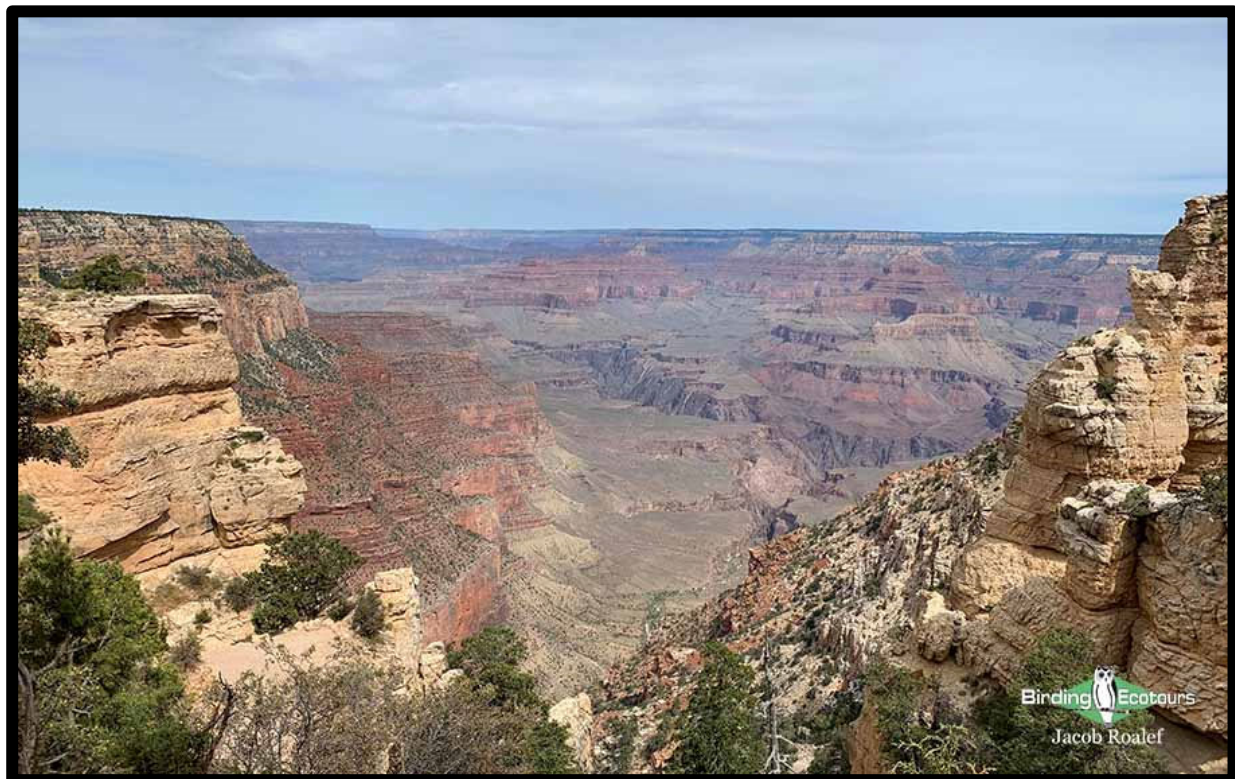
One of the many amazing views of the Grand Canyon and surrounding area.