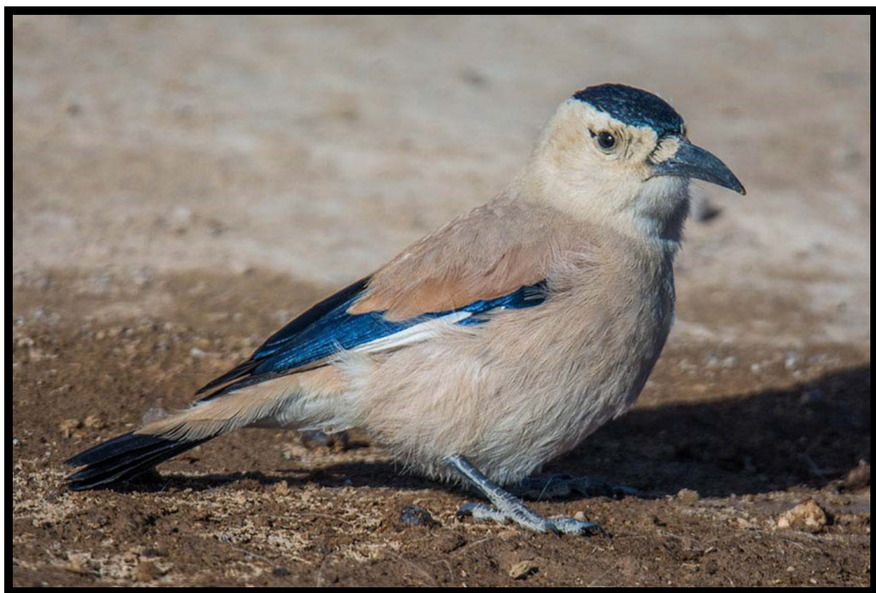
Henderson's Ground Jay is always a top target on this trip