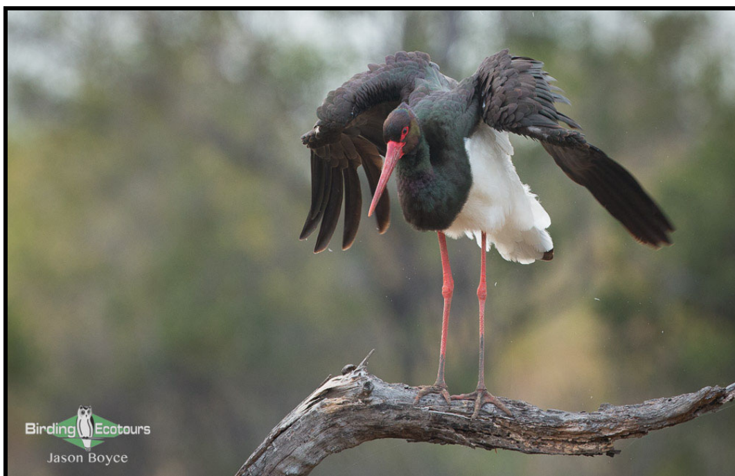
Black Stork can be seen in Gun-Galuut Nature Reserve.