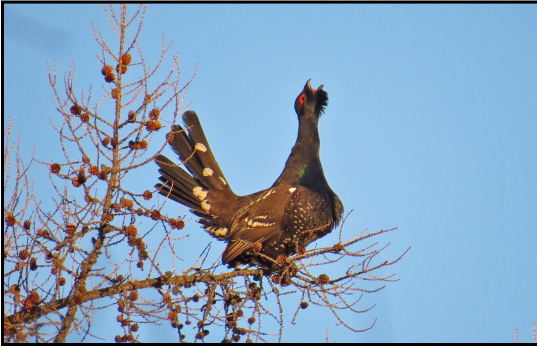
Black-billed Capercaillie will be another big target bird during our time in Gorkhi Terelj National Park.

We will drive to Gorkhi Terelj National Park and check into a tourist ger camp near the birding site for a two-night stay as we explore this fascinating area. Here we will look for forest and forest/steppe birds, including the tough and highly sought Black-billed Capercaillie and Chinese Bush Warbler , along with plenty of other quality birds like Siberian Rubythroat , Daurian Partridge , Ural Owl , Oriental Cuckoo , Eurasian Three-toed Woodpecker , Red-flanked Bluetail , Daurian Redstart , Dark-sided Flycatcher , Taiga Flycatcher , Black-faced Bunting , Stejneger's Stonechat , and White-cheeked Starling .