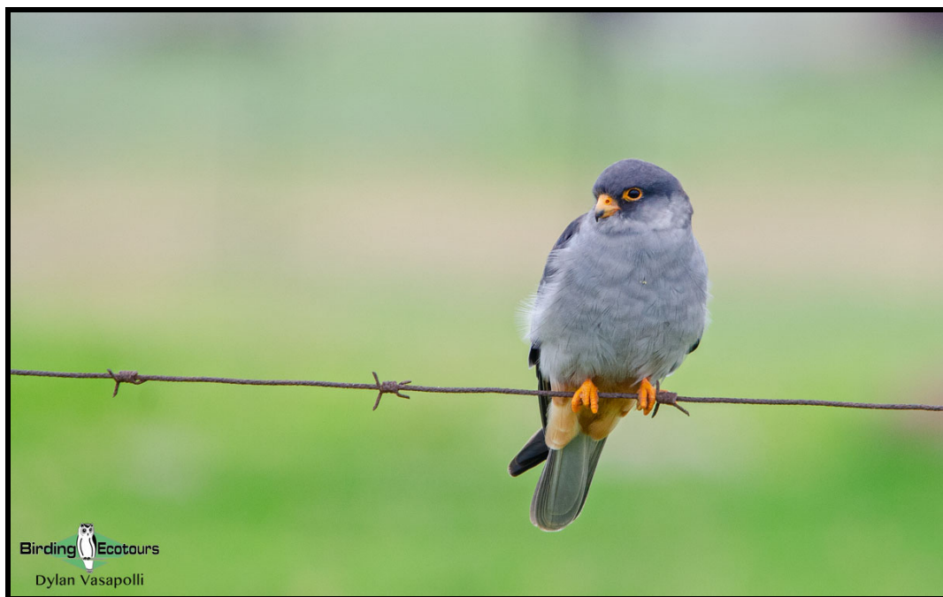
The beautiful Amur Falcon is an incredible long-distance migrant – this is a male.

This Mongolian birdwatching tour offers the ultimate adventure to find an array of dream birds from the Eastern Palearctic. We will start (and end) our Mongolian birding adventure in Ulaanbaatar (also widely known as Ulan Bator). We will visit several different areas and key habitats in the region where we will look for a range of important target species. On arrival in the city some of our target birds should be waiting for us near our hotel, such as Azure Tit , Azure-winged Magpie , Amur Falcon , and Long-tailed Rosefinch .