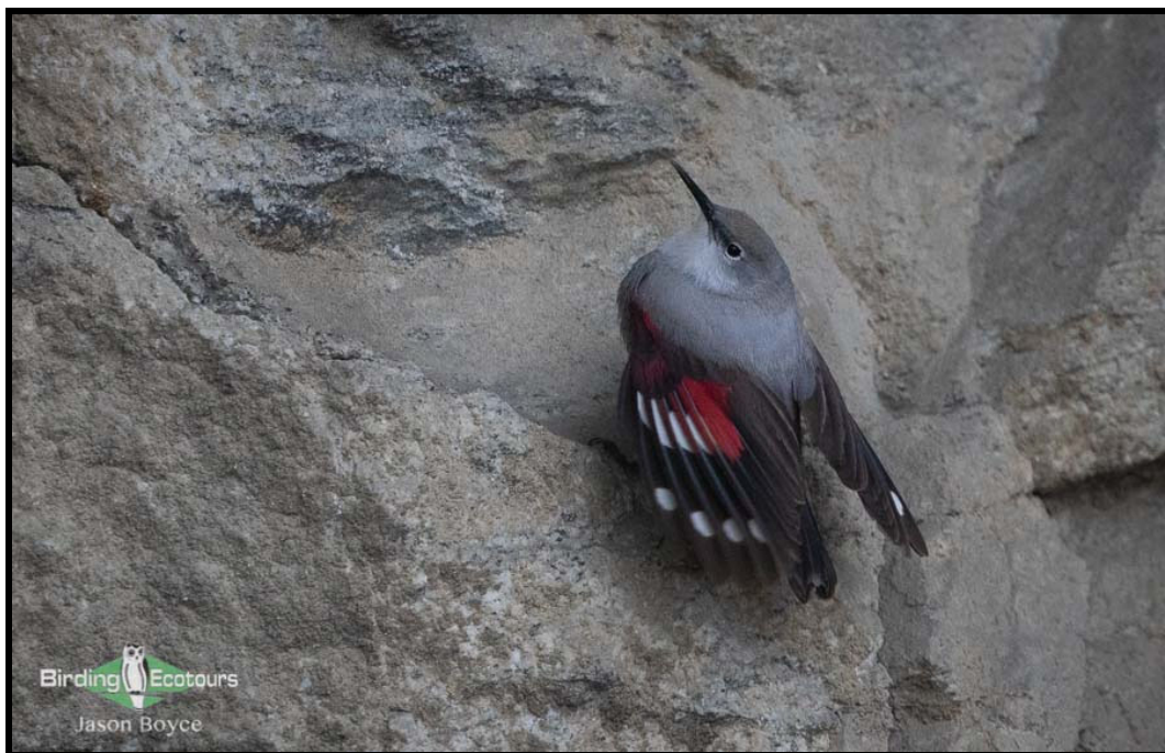
Wallcreeper — always a highlight.