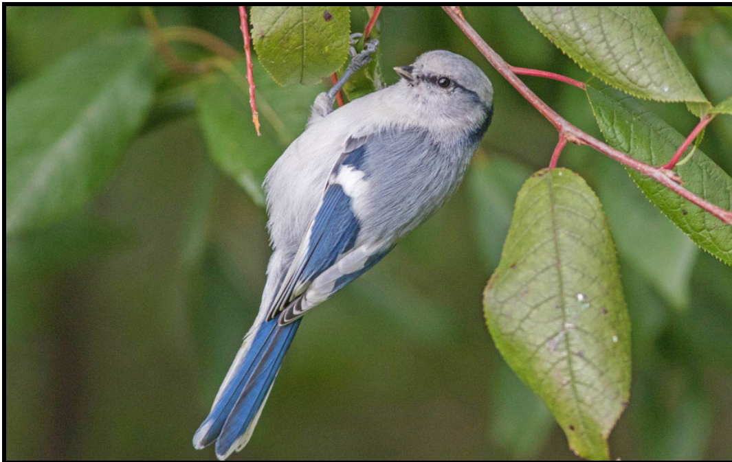
The beautiful Azure Tit will be enjoyed while in Mongolia (photo Natural Heritage Center of Mongolia).