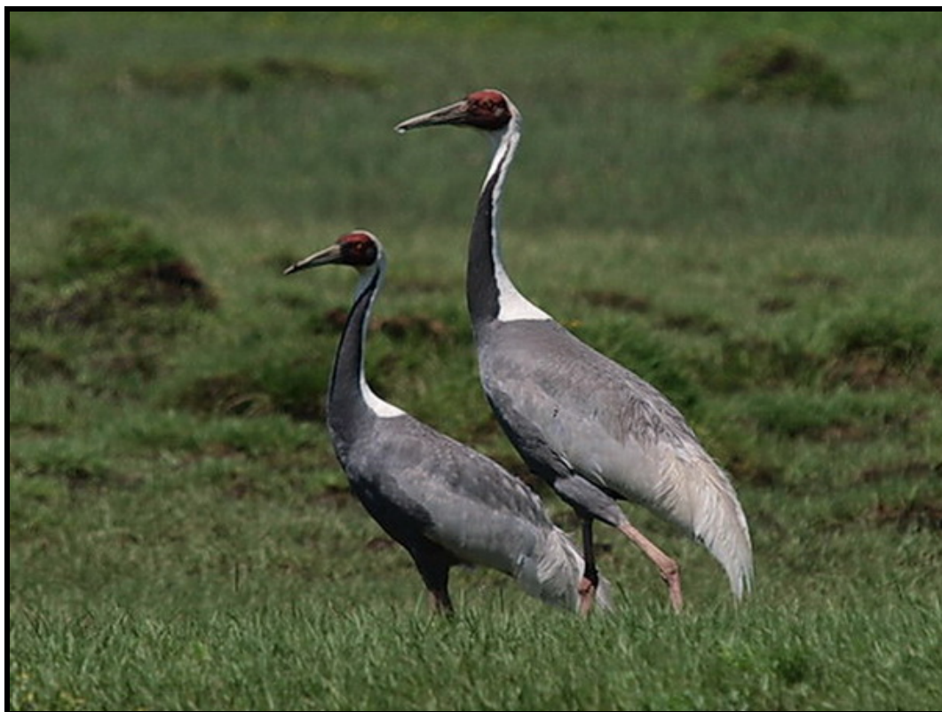
White-naped Crane is one of our big target species on this tour. This huge bird stands at between 47 and 59 inches (1.2 and 1.5 meters) tall and has a wingspan of over 78 inches (2 meters).

Wagtail , and Red-throated Thrush . With luck we may even encounter the Critically Endangered (BirdLife International) Siberian Crane .