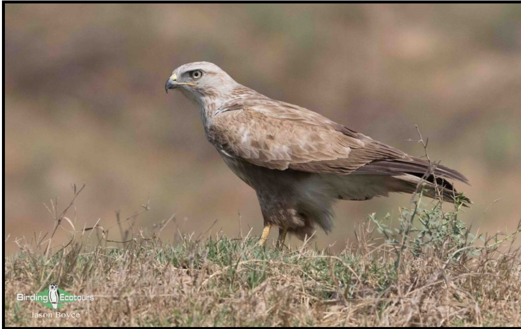
Long-legged Buzzard — one of the many raptors we should see on this trip.

Please note that the itinerary cannot be guaranteed as it is only a rough guide and can be changed (usually slightly) due to factors such as availability of accommodation, updated information on the state of accommodation, roads or birding sites, and the discretion of the guides and other factors.