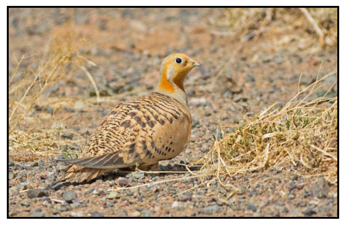
Pallas's Sandgrouse can be found in the Chaka area.

We will enjoy two full days birding around the Chaka area. Some of the areas we might visit while here include: <u>Chaka Valley</u>, <u>Chaka Marsh</u>, and <u>Chaka Salt Lake</u> and <u>flats</u>. There are a lot of targets for us here, with some very special gamebirds being possible, such as Tibetan Snowcock , Himalayan Snowcock , Tibetan Partridge , Chukar Partridge , Daurian Partridge , and Przevalski's Partridge . While scanning the ground we will also look for Pallas's Sandgrouse , Henderson's Ground Jay , and Ground Tit , along with a long list of larks, pipits and relatives likely to include Mongolian Lark , Horned Lark , Hume's Short-toed Lark , Asian Short-toed Lark , Oriental Skylark , Desert Wheatear , Isabelline Wheatear , Brown Accentor , and Rosy Pipit .