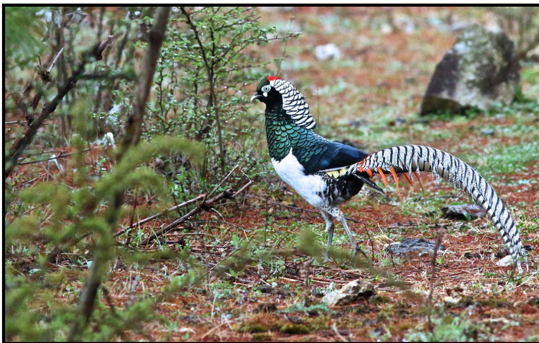
There are many stunning gamebirds possible on this Sichuan tour, one of the best must be Lady Amherst's Pheasant.

We will spend the full day birding at, and around the excellent Labahe Nature Reserve , where we will look for plenty more exciting birds like Temminck's Tragopan , Lady Amherst's Pheasant , Specked Wood Pigeon , Himalayan Swiftlet , Salim Ali's Swift , Bearded Vulture , Himalayan Vulture , Eurasian Three-toed Woodpecker (and eight other species), Long-tailed Minivet , Spotted Nutcracker , Fire-capped Tit , Pere David's Tit , Chinese Cupwing , Pygmy Cupwing , Asian House Martin , Collared Finchbill , Black Bulbul , Sichuan Leaf Warbler , and Large-billed Leaf Warbler .