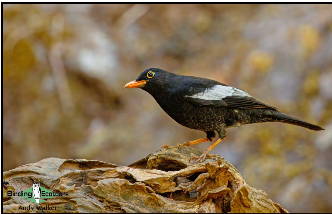
Grey-winged Blackbird is a beautiful member of the thrush family.

There are many other birds to keep us occupied in the Lijiang area, such as Black-tailed Crane , Salim Ali's Swift , Common Pheasant , Grey Nightjar , Great Spotted Woodpecker , Spotted