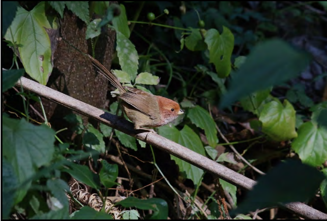
Brown-winged Parrotbill is one of our localized targets in Yunnan.