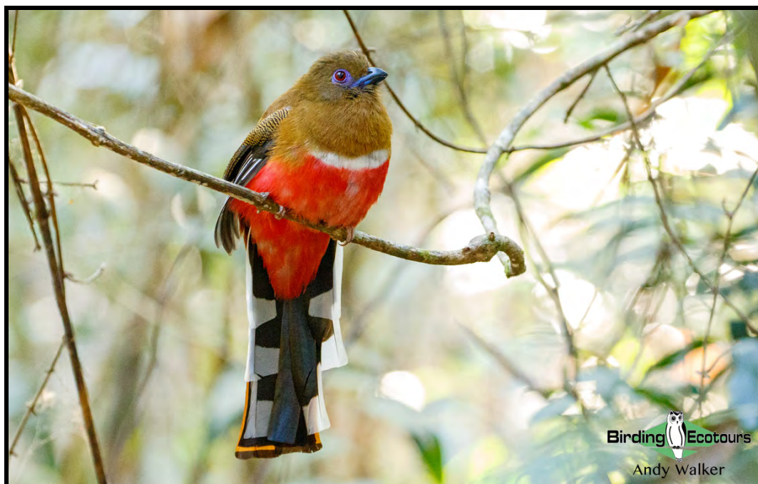
A female Red-headed Trogon quietly watches us. The male is even more spectacular!

The area is also wonderful for good-looking and colorful birds like Greater Yellowname , Bay Woodpecker , Great Barbet , Golden-throated Barbet , Blue-throated Barbet , Red-headed Trogon , Long-tailed Broadbill , Orange-bellied Leafbird , Maroon Oriole , White-browed Bush Robin , Golden Bush Robin , and an impressive list of sunbirds, including Fork-tailed Sunbird , Mrs. Gould's Sunbird , Green-tailed Sunbird , Fire-tailed Sunbird , and Black-throated Sunbird .