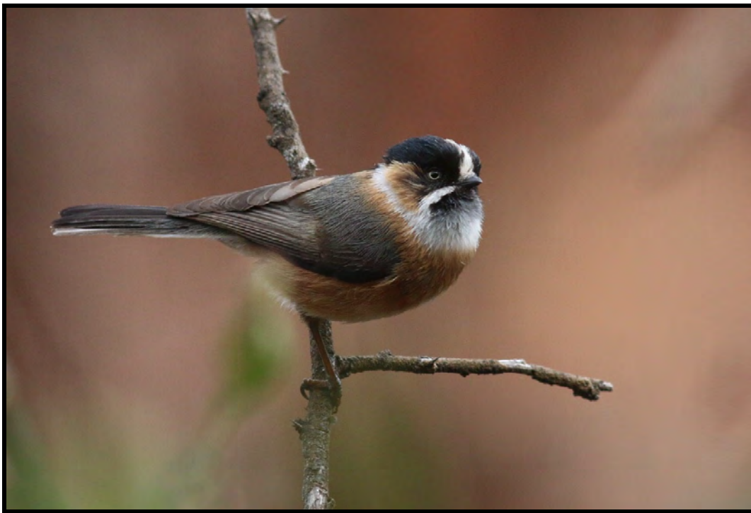
Black-browed Bushtit can be found in Zixi Mountain Forest Park.