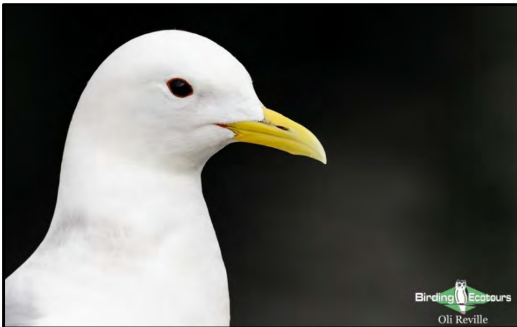
The beautiful Black-legged Kittiwake is a rare, but regular migrant seabird along the Baltic Coast and is a very attractive species.

In the neighboring harbor and its surroundings we will focus on waterbirds including Common Eider , Velvet Scoter , Common Scoter , Red-breasted Merganser , and Sandwich Tern . On the