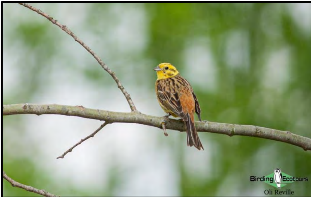
Yellowhammer is a striking passerine and relatively common in the wet meadows of the Biebrza Marshes.

These grasslands also hold plenty of other top birds and while here we may come across Meadow Pipit , Yellowhammer , Eurasian Skylark , Woodlark , White Wagtail , Eurasian Tree Sparrow , Common Reed Bunting , Northern Raven , Eurasian Magpie , Eurasian Jay , Western Jackdaw , Hooded Crow , and Stock Dove . With luck we may also hear Eurasian Eagle-Owl calling from these areas at dusk and we will hope to see this secretive large owl.