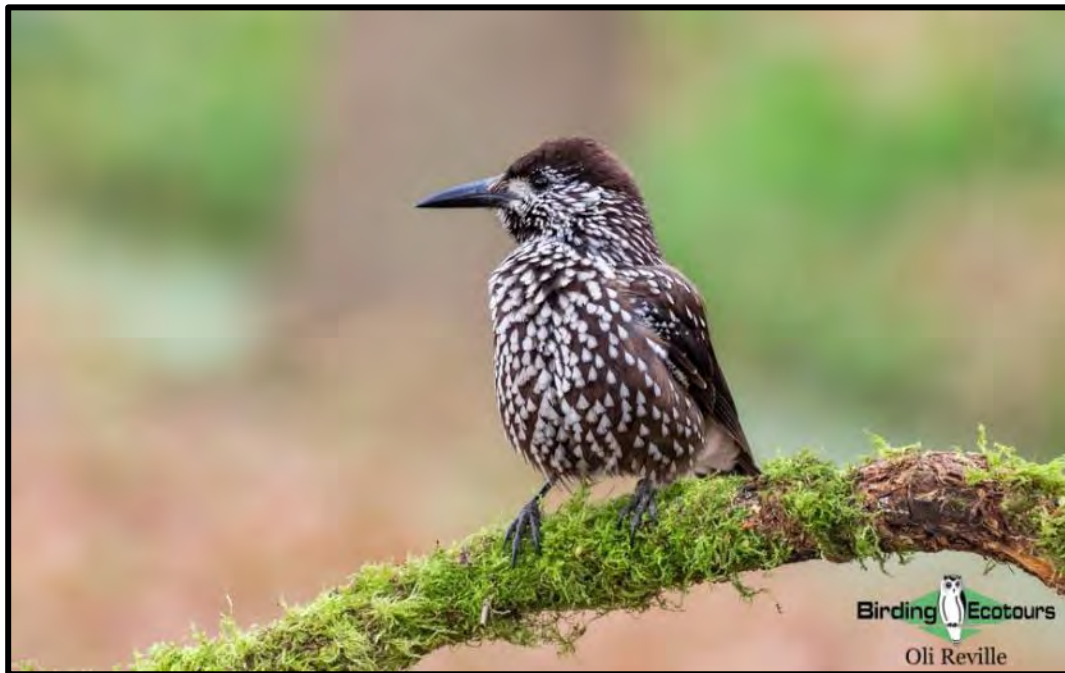
Spotted Nutcracker is a stunning species of the deep forests of Białowieża.

As we move deeper into the forest, we will start to come across the area's most mysterious and special species. By moving quietly along forest trails we might spot the elusive Hazel Grouse scurrying along the forest floor, while above us Spotted Nutcracker can be found atop the large trees here. A drive at night should give us some of the forest's special owls as well, with Tawny Owl and Eurasian Pygmy Owl the most common, although the latter can also regularly be seen in the day. These night drives should also give us our best chance of seeing the rare (European) Grey Wolf and October is the best month to see this mystical mammal in the forests.