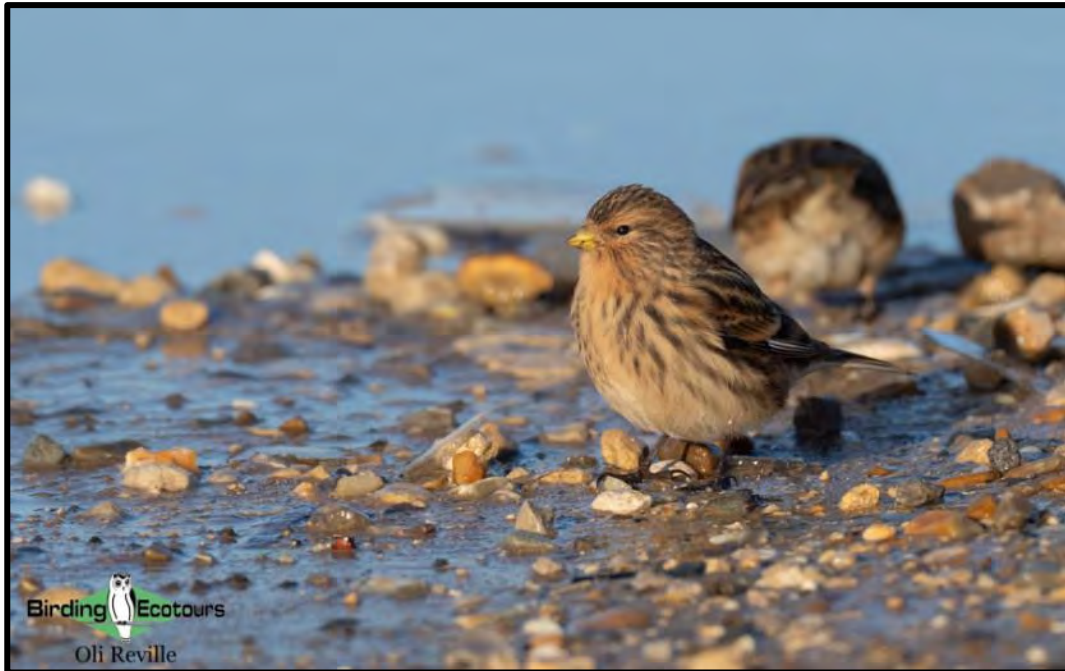
The dainty Twite is a common migrant on the Hel Peninsula.