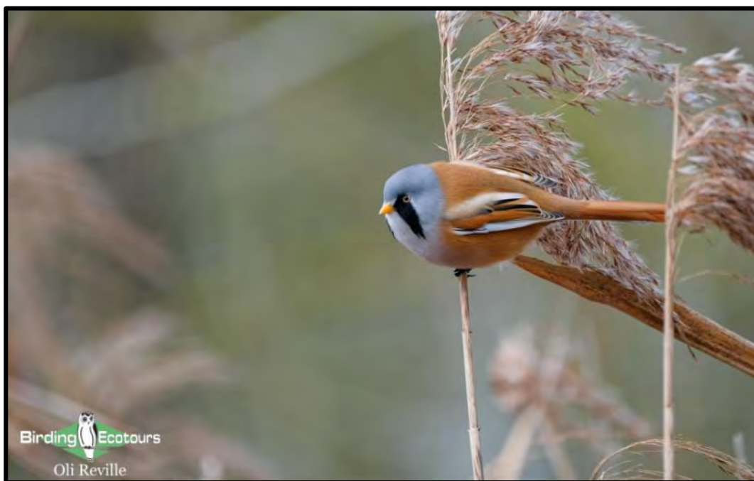
Bearded Reedling (Tit) is a gorgeous bird that we will look for in reedbed habitats.

The variety of small birds attracts birds of prey and we could find Eurasian Sparrowhawk , White-tailed Eagle , and Common Buzzard hunting in the area. We will look for clues given by the shorebirds and wildfowl to the presence of these predators! The ponds here attract plenty of gulls, with Caspian Gull being likely and the much rarer Pallas's Gull also frequently recorded here in fall. Finally, the reeds, scrub, and wooded surrounds of the ponds attract passerines such as Bearded Reedling (Tit), Goldcrest , Yellowhammer , Common Reed Bunting , Great Grey Shrike , Woodlark , Redwing , Eurasian Linnet , Brambling , Eurasian Bullfinch , Eurasian Tree Sparrow , and Black Redstart .