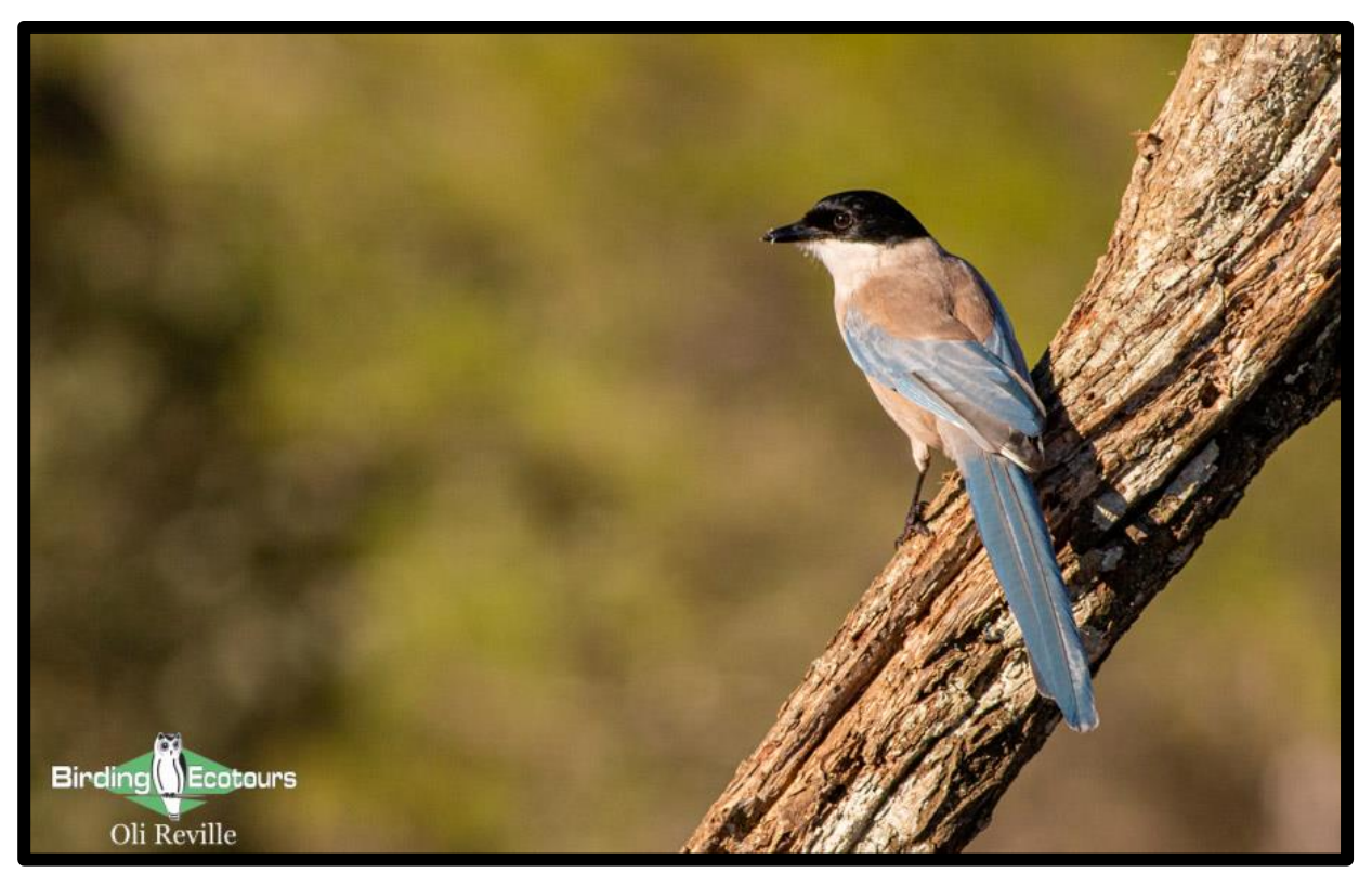
The regionally endemic Iberian Magpie will be one of many exciting target birds during our spring birding tour in Spain.