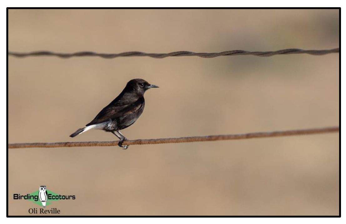
Black Wheatear is a localized target bird on our <u>Spain: Spring Birding Extravaganza</u> tour.

During our Spain spring tour we will be staying in a range of two-star to four-star hotels. All the hotels are of a traditional style and have been hand-picked to offer the best experience in their respective area. Hotels are located in areas that enable short drives to excellent birding areas.