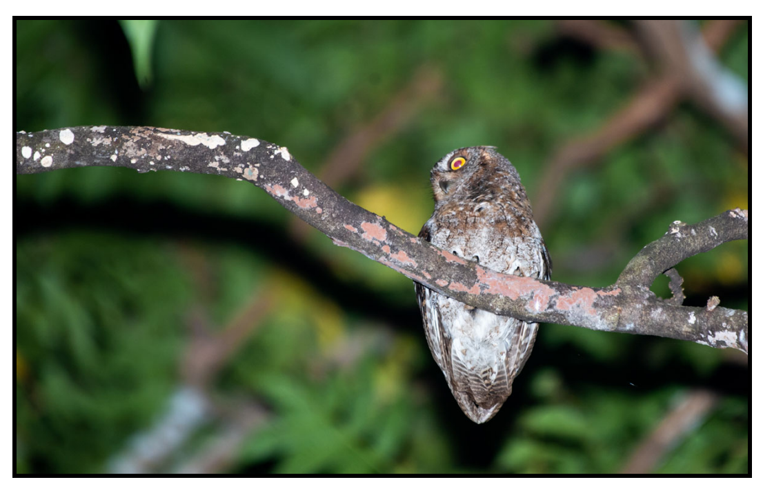
The endemic subspecies of Ryukyu Scops Owl can only be found on Lanyu Island and might warrant full species status as Lanyu Scops Owl in the future.

With an indigenous culture that is closer to that of the <u>Philippines</u>, Lanyu is a nice contrast to mainland Taiwan. Taiwan Green Pigeon , Philippine Cuckoo-Dove , Brown-eared Bulbul , Japanese Paradise Flycatcher , the endemic subspecies of Ryukyu (Lanyu/Elegant) Scops Owl , and Lowland White-eye are the main targets here and can be expected, as well as other passage passerines, possibly including raptors, shrikes, warblers, and buntings. It is a fun, small, island to explore and gives the opportunity to find some interesting species.