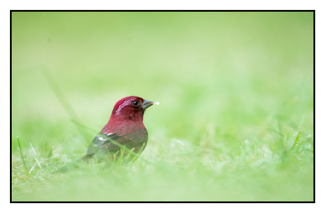
The gorgeous Taiwan Rosefinch can be found quietly eating seeds on the ground in the mountains.

Overnight (two nights): Anmashan Lodge, Dasyueshan