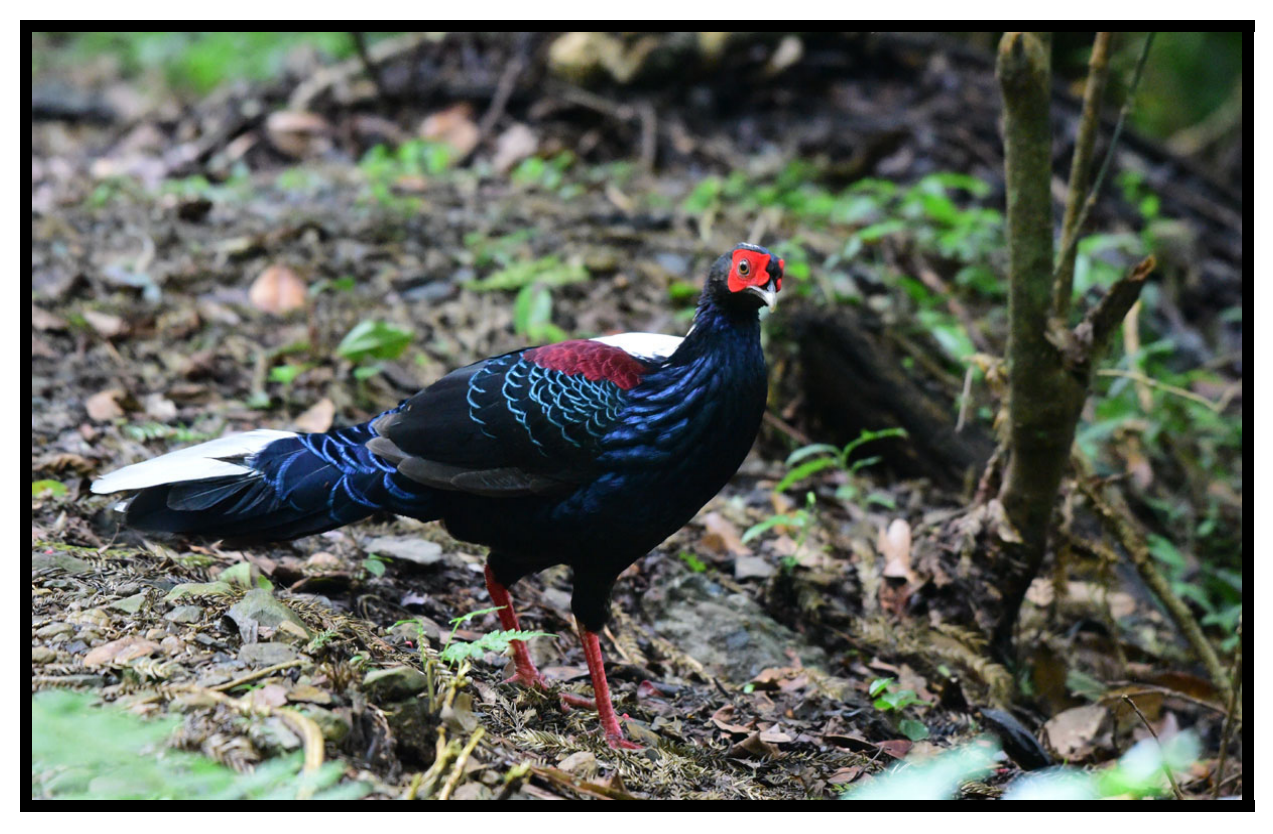
Swinhoe's Pheasant is one of the many stunning endemic species we will search for on this trip.