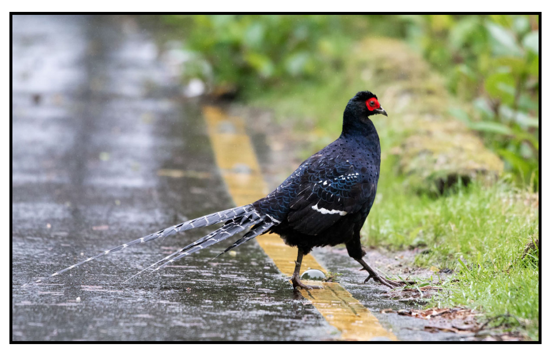
The endemic Mikado Pheasant is a highly prized target species.

The main target in the forests above our cabins is the graceful Mikado Pheasant . While staking them out along the road, the very confiding White-whiskered Laughingthrush and Maritime (Formosan) Striped Squirrel will likely pose for you. Nearby we will be on alert for White-browed Bush Robin and the smart Collared Bush Robin . As we get into hemlock and dwarf bamboo forest at the highest points, we will meet the distinctive local version of Spotted Nutcracker as well as Brown-flanked Bush Warbler , Yellow-bellied Bush Warbler , Taiwan Bush Warbler , and Taiwan Shortwing .