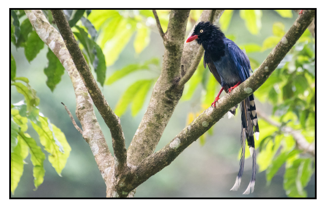
Taiwan Blue Magpie is a gorgeous bird, and we will be looking out for this colorful endemic during our Taiwan birdwatching tour.

We usually find all of Taiwan's endemic birds on our spring tour, as well as a high percentage of all subspecies likely to get elevated to full species status in the future. Some of the endemic highlights of this great birding tour include Taiwan Partridge, Taiwan Bamboo Partridge, Swinhoe's Pheasant, Mikado Pheasant, Taiwan Barbet, Taiwan Blue Magpie, Yellow Tit, White-whiskered Laughingthrush, Taiwan Barwing, Steere's Liocichla, White-eared Sibia, Taiwan Hwamei, Taiwan Bush Warbler, Taiwan Niltava, Collared Bush Robin, Taiwan Thrush, Flamecrest, Taiwan Yuhina, Taiwan Bullfinch, and Taiwan Rosefinch.