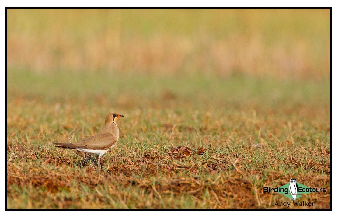
Oriental Pratincoles should have returned from their Australian wintering grounds in time for our Taiwan tour.