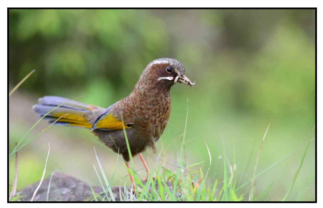
The endemic White-whiskered Laughingthrush is often incredibly confiding.