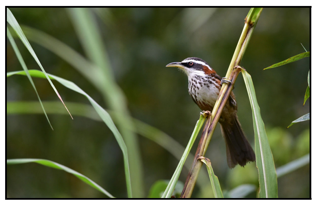
Taiwan Scimitar Babbler is an attractive endemic bird.

Most of the endemic birds are found in the mountains, meaning birding takes place in some absolutely gorgeous scenery with nice cool temperatures, a pleasant change from the warmer lowlands where there are also plenty of excellent birds to be found, including several more endemics, and the migratory and highly sought-after Fairy Pitta. A few of the species occurring in Taiwan with distinctive local subspecies (and potential future splits) include Himalayan Owl, Ryukyu Scops Owl, Dusky Fulvetta, Golden Parrotbill, Alpine Accentor, and White-browed Bush Robin, and many more.