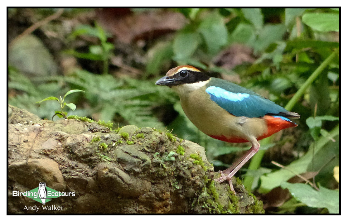
Fairy Pitta breed near <u>Huben</u> in Taiwan and is probably one of the most reliable places to see this gorgeous species in the world.

Please note that the itinerary cannot be guaranteed as it is only a rough guide and can be changed (usually slightly) due to factors such as availability of accommodation, updated information on the state of accommodation, roads, or birding sites, the discretion of the guides and other factors. In addition, we sometimes have to use a different international guide from the one advertised due to tour scheduling.