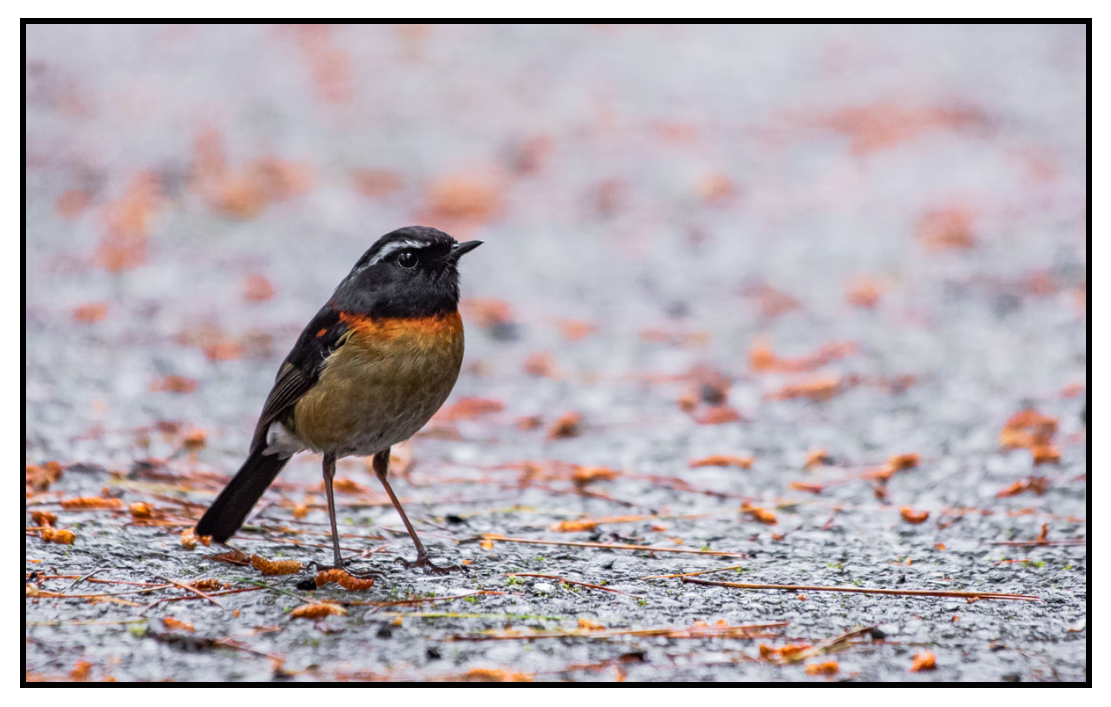
The endemic Collared Bush Robin is a rather dainty and approachable bird of the higher elevations that we will spend time birding in while on Taiwan.