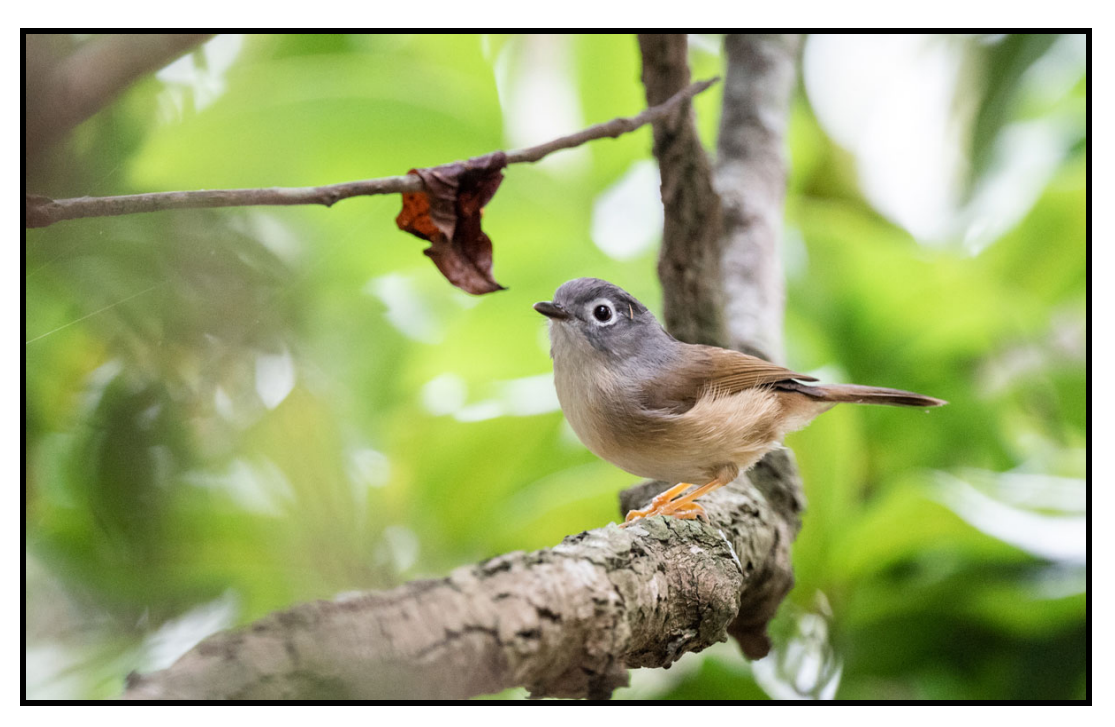
Grey-cheeked Fulvetta usually give their presence away by their raucous calls and they can be seen in Dasyueshan National Forest.

As we get higher, we will hopefully find Bronzed Drongo , Black Bulbul , Striated Prinia , the striking Taiwan Niltava , White-bellied Erpornis , hopefully White-backed Woodpecker and Grey-headed Woodpecker , and probably <u>Formosan Rock Macaque</u>.