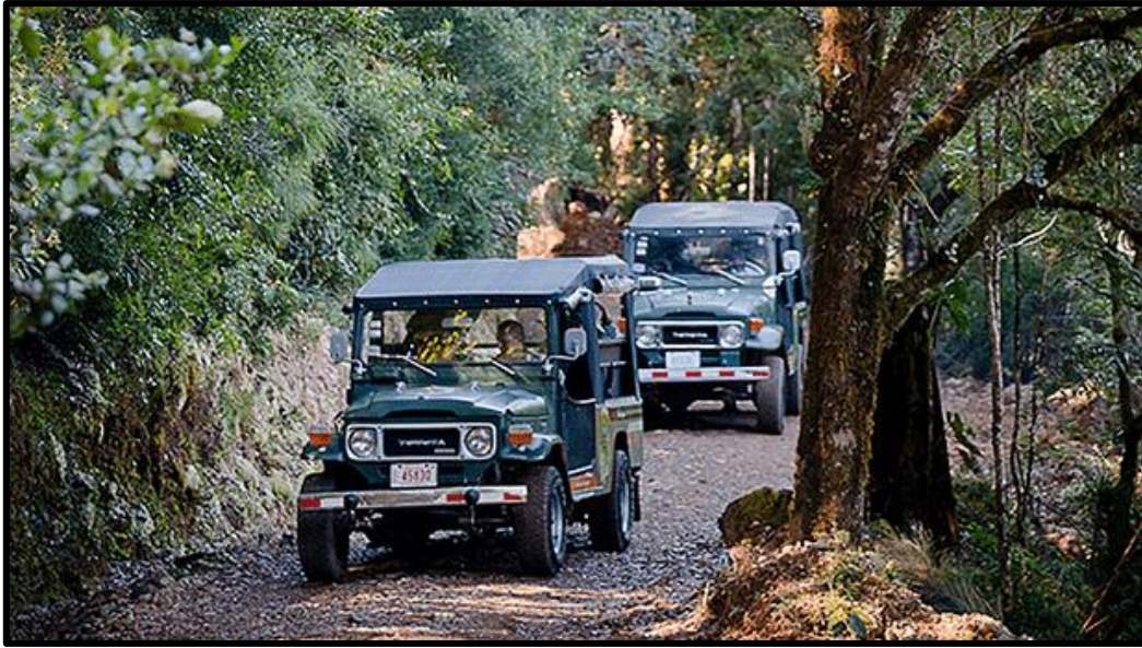
A 10-minute ride in 4x4 vehicles might be required to reach certain spots along the tour.