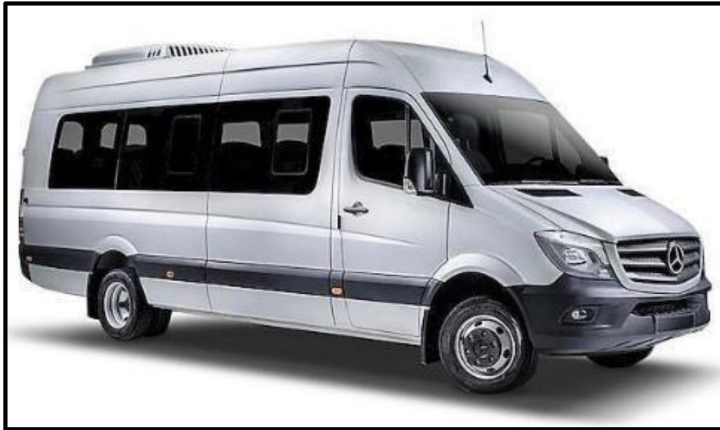
An example of the van we will use while on our Costa Rica Premium Tour.

We will have a private van for the whole tour with plenty of room for everybody. We will also take an enjoyable boat ride along the Rio Tarcoles. Please be sure to check the information regarding our vehicle seat rotation policy in our Costa Rica general information document, here . At Savegre Lodge, we will be transferred to the start of the creek trail in the back of an open-top 4x4 jeep however this is only a 10-minute ride. Participants need to be fit enough to get in and out of the vehicle.