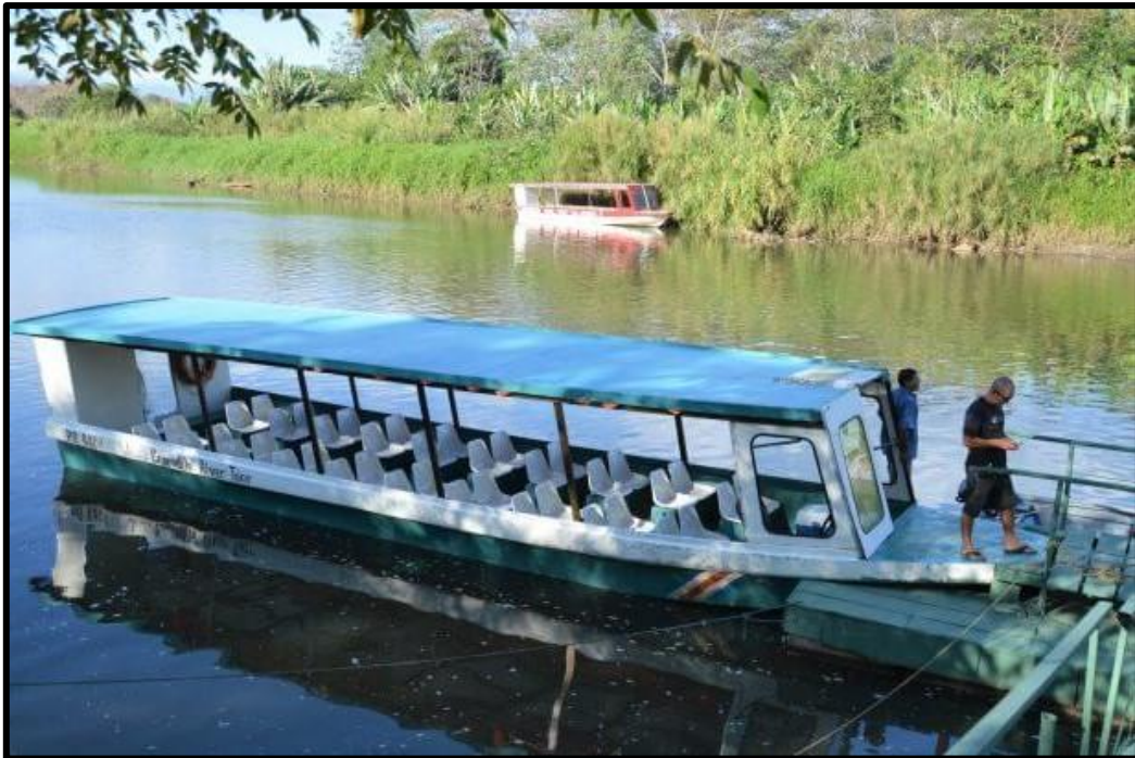
An example of the boat we use along the Tarcoles River.