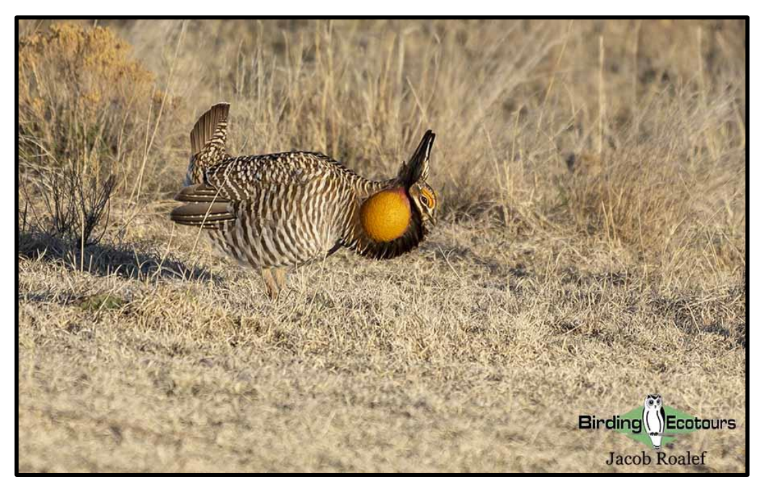
Greater Prairie Chicken is one of the many fantastic grouse species we should encounter on this tour.

This tour begins in the <u>mile-high city of Denver</u>, visiting its various pristine birding locations before heading west and up into the dizzying heights of the <u>Rocky Mountains</u>. Up here, the search is on for the tricky White-tailed Ptarmigan and rosy finches. We continue onwards for our first few leks of the trip and then head southwest to Grand Junction and Gunnison, birding along the