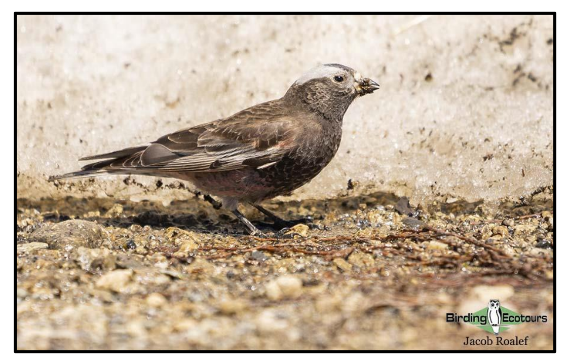
The Black Rosy Finch is arguably one of the prettiest North American birds.