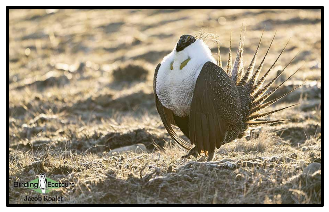
The stunning display of (Greater) Sage Grouse is a real highlight of the tour.