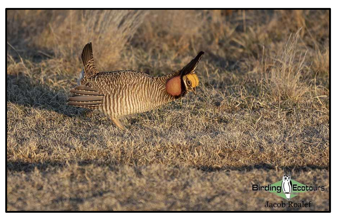
We will also visit a Lesser Prairie Chicken lek.