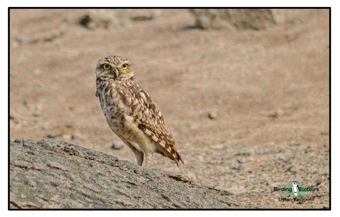
There will be many chances to see the curious Burrowing Owl.