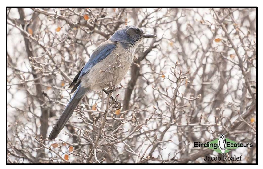
Woodhouse's Scrub Jay can be seen in Gunnison National Park.