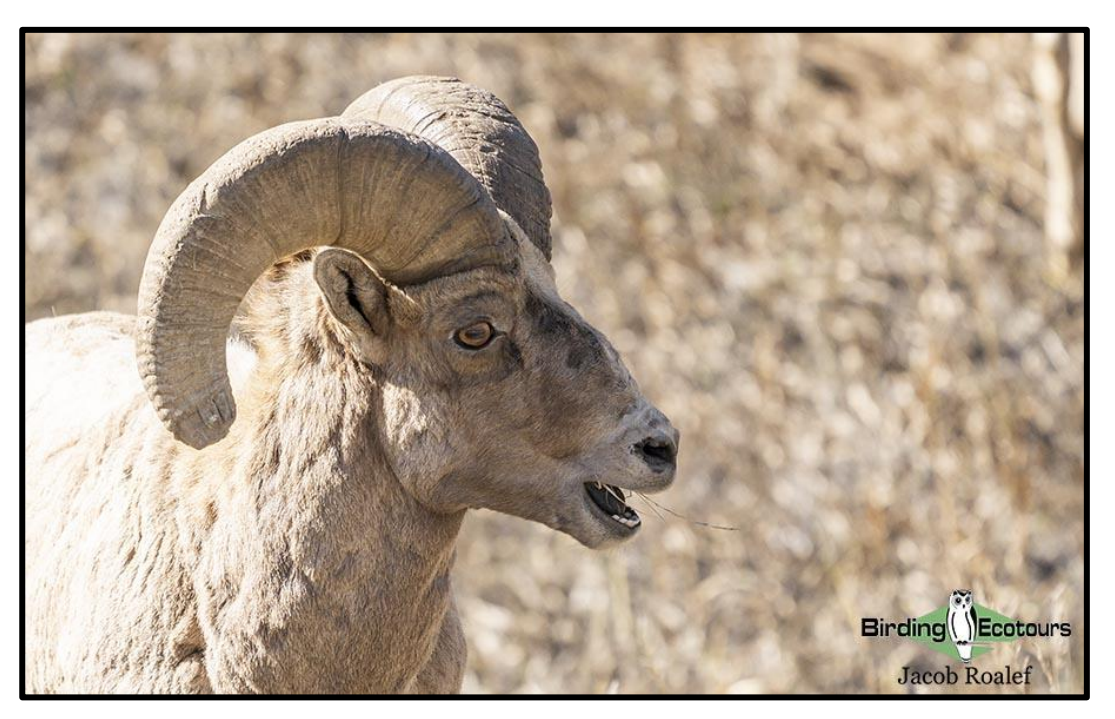
Bighorn Sheep are a possibility on this tour too.