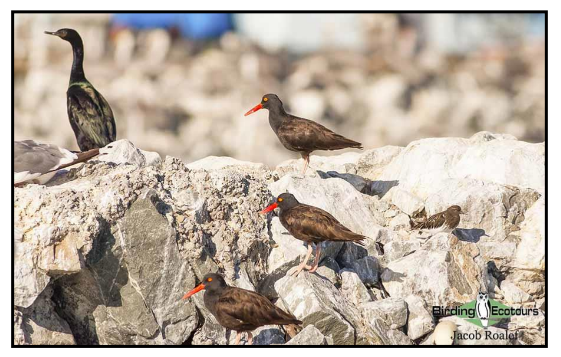
A typical coastal mix of Pelagic Cormorant, Black Oystercatchers, and Black Turnstone.