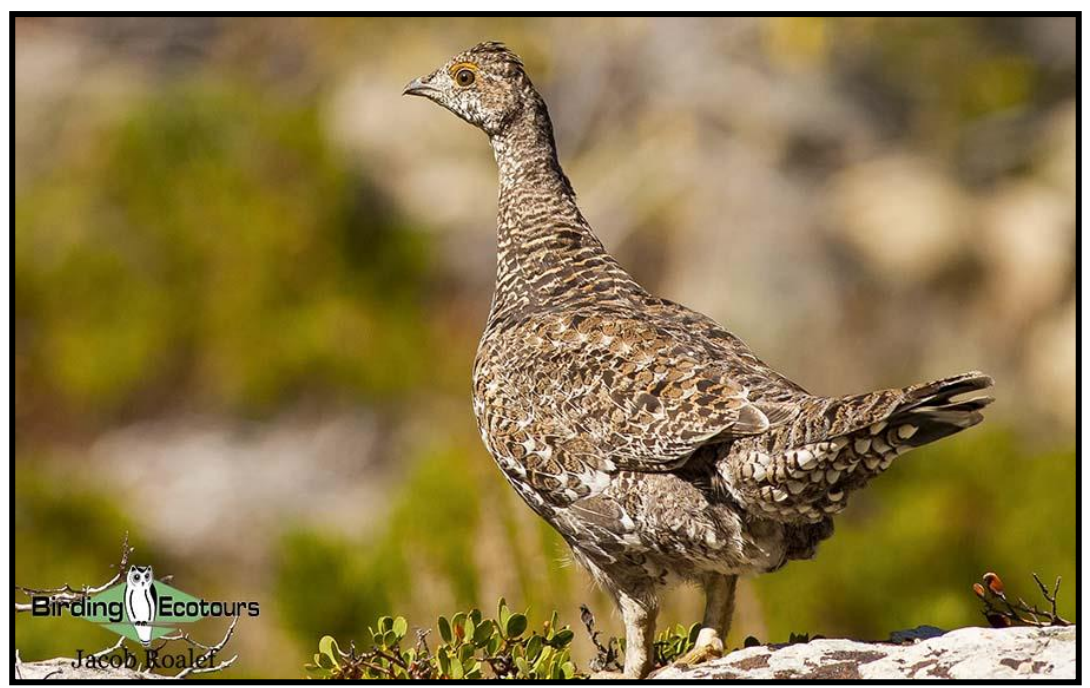
Sooty Grouse will be targeted in the Sierra Nevada region.