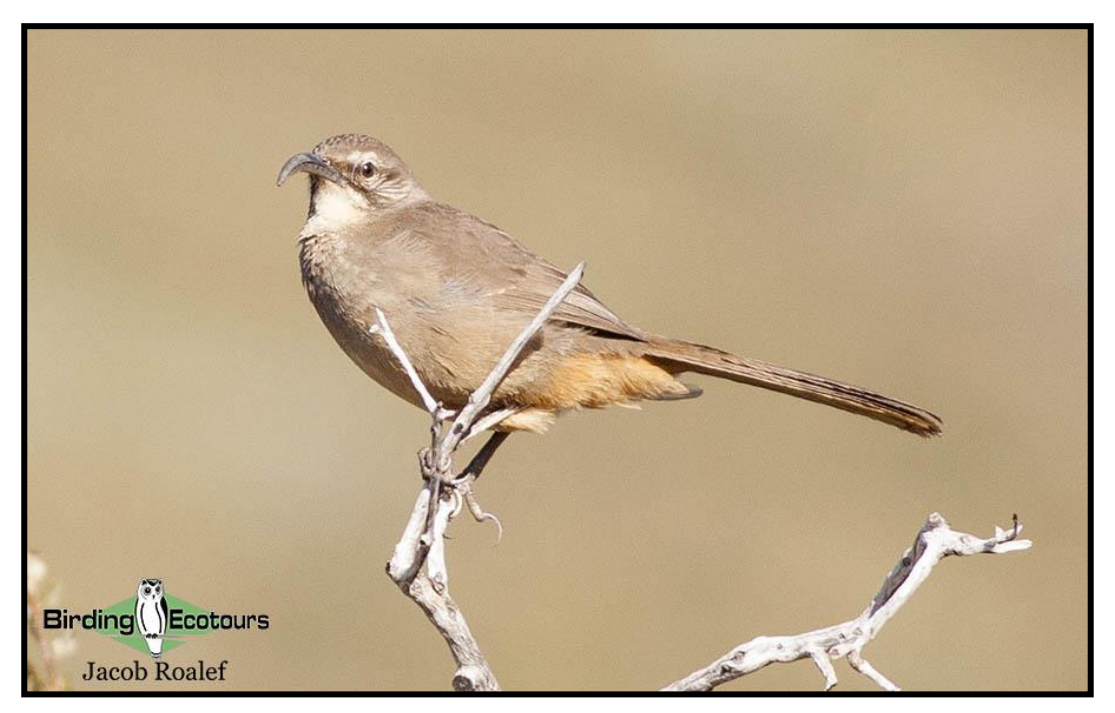
California Thrasher is typically found in thickets and shrubs.