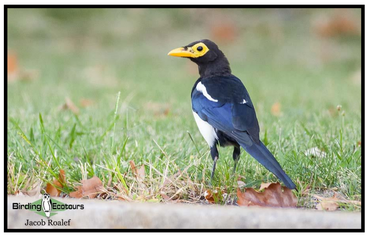
The bold Yellow-billed Magpie is a top target and endemic to California.

04 - 13 SEPTEMBER 2023 04 - 13 SEPTEMBER 2024