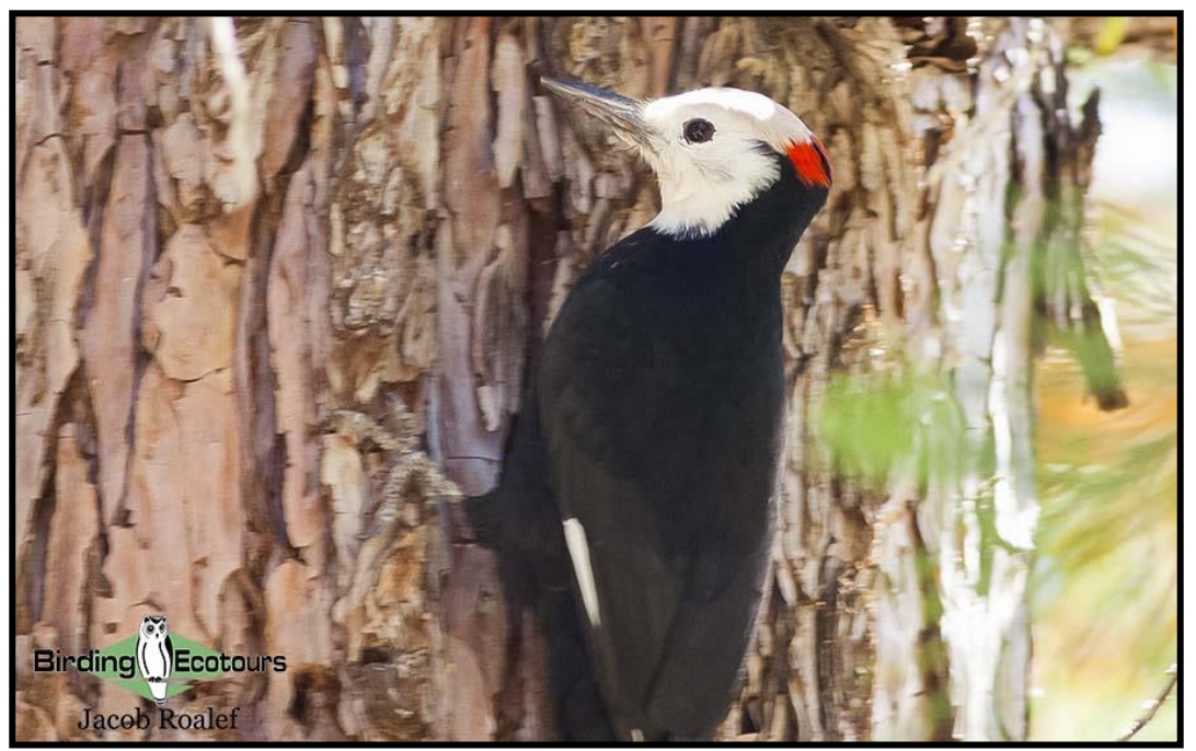
The stunning White-headed Woodpecker always causes a moment of awe.

If you wish to continue the adventure and enjoy a full comprehensive tour of California, please check out our set departure birding tour to southern California immediately following this one. This trip includes stops in various habitats for California Gnatcatcher , Island Scrub Jay , Allen's Hummingbird and a trip to the Salton Sea. Please see <u>the separate itinerary</u> for more information.