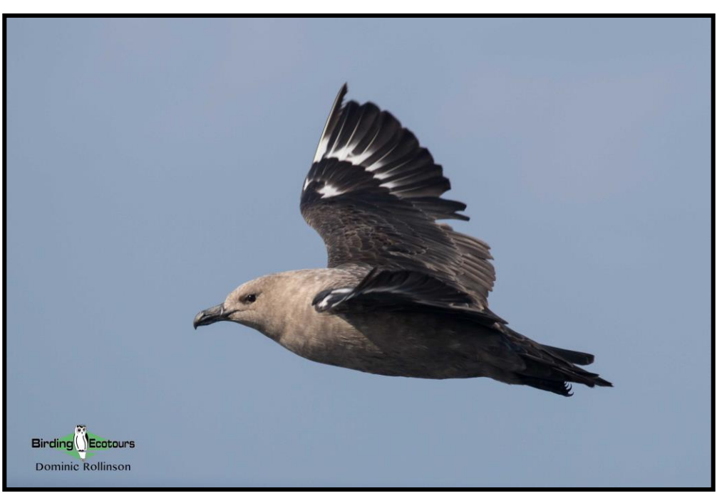
South Polar Skua may be seen on the pelagic trip.