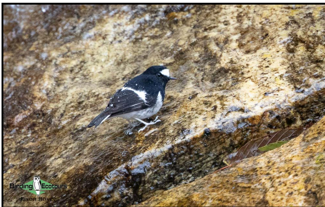
The diminutive Little Forktail can easily be missed.

stalking the birds in the forest we will all also keep an eye to the sky for Mountain Hawk-Eagle , Crested (Oriental) Honey Buzzard , and flocks of Himalayan Swiftlets .