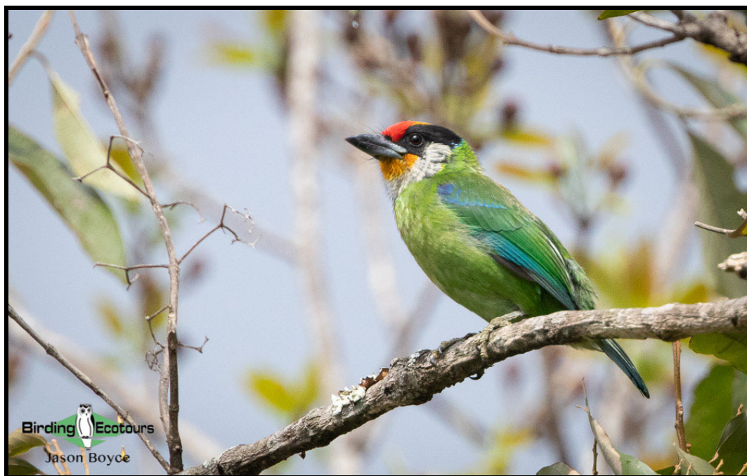
Golden-throated Barbet is quite common but more often heard before it is seen.