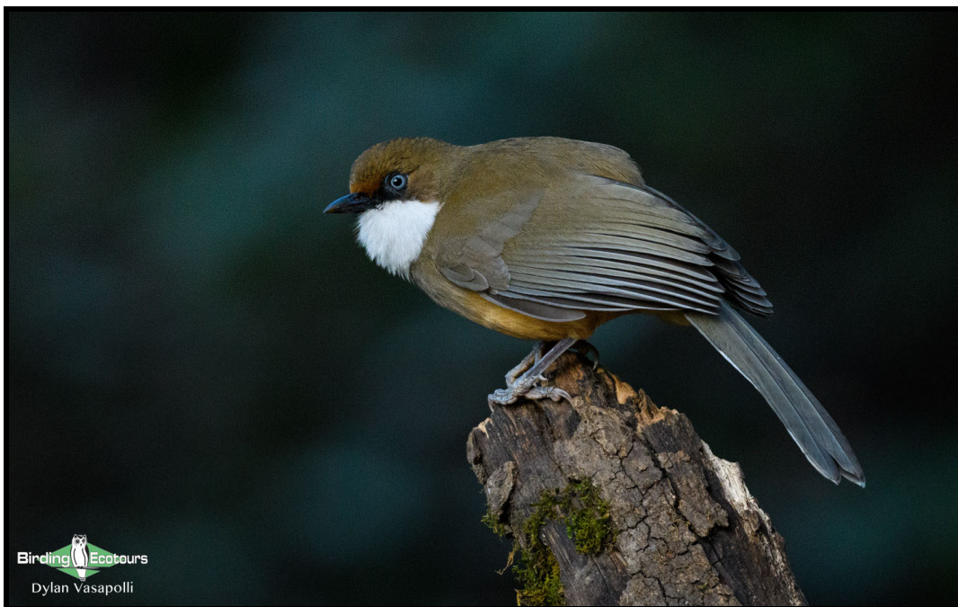
White-throated Laughingthrush can be extremely gregarious, and it is not unusual to see raucous flocks of over 60 birds moving about, and they often show well, as shown here!