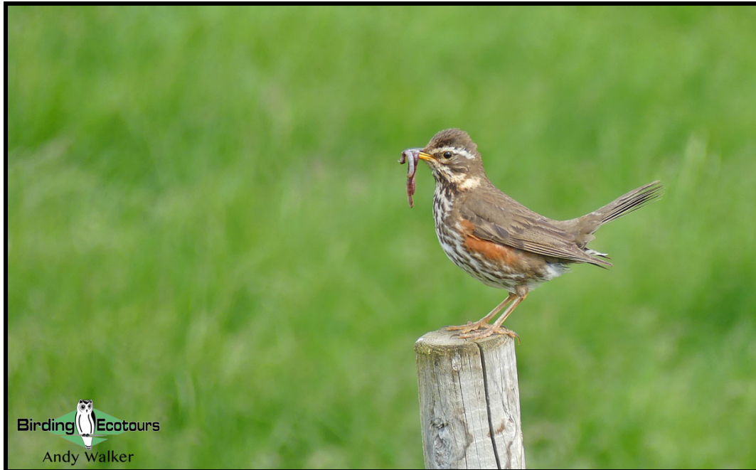
Redwing is one of several common breeding passerines to grace Iceland.

More land-based highlights include Rock Ptarmigan , White-tailed Eagle , Gyr Falcon , Goldcrest , Eurasian Wren , Northern Wheatear , Red (Common) Crossbill , Common (Icelandic) Redpoll , Redwing , Common Blackbird , White Wagtail , and Snow Bunting .