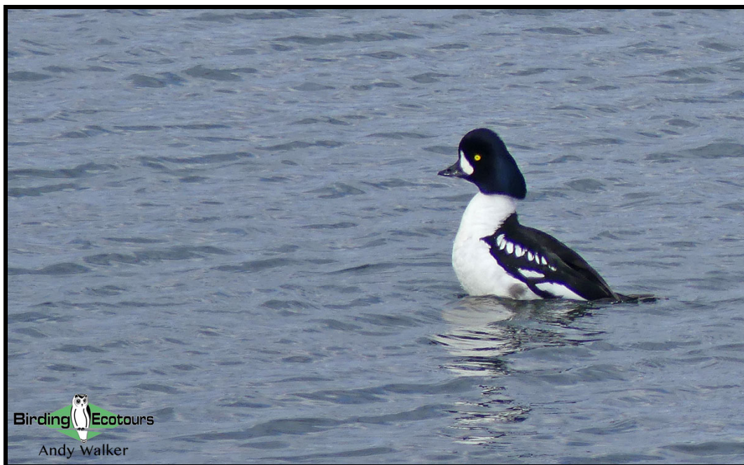
Barrow's Goldeneye is one of the many waterfowl species we will encounter on this tour.

This is the center of duck habitat in Iceland and is a spectacular site. We will spend the day driving the 25 miles (40 kilometer) worth of road that circumnavigates the lake, making strategic stops in different areas preferred for different species. Over the course of the day, we will hope to find a wide range of species, including Greylag Goose , Whooper Swan , Gadwall , Barrow's Goldeneye , Red-breasted Merganser , Eurasian Wigeon , Harlequin Duck , Northern Shoveler , Eurasian Teal , Long-tailed Duck , Greater Scaup , and Common Scoter .