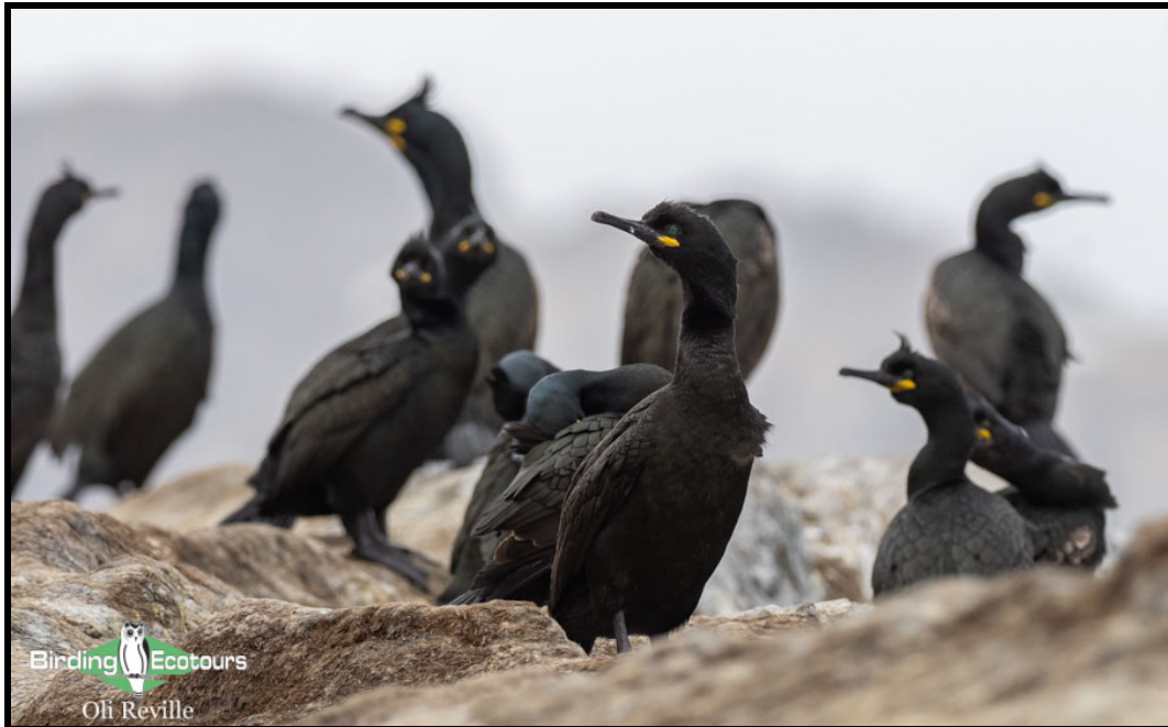
European Shag nest on the Snæfellsnes Peninsula and we will be sure to look out for them here.