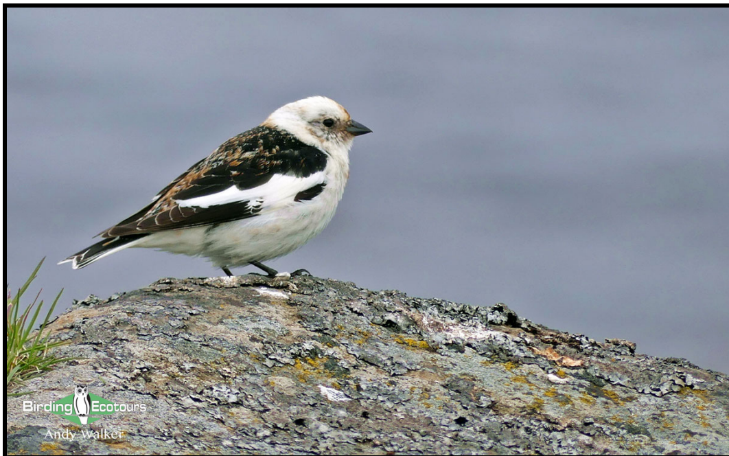
Snow Bunting can be found breeding at different sites across Iceland and we often enjoy great views of them whilst birding on Flatey Island.