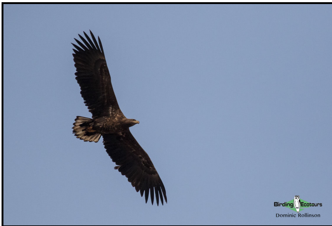
White-tailed Eagle is a huge bird, they can be seen on the Snæfellsnes Peninsula.

Overnight: Olafsvik, Snæfellsnes Peninsula