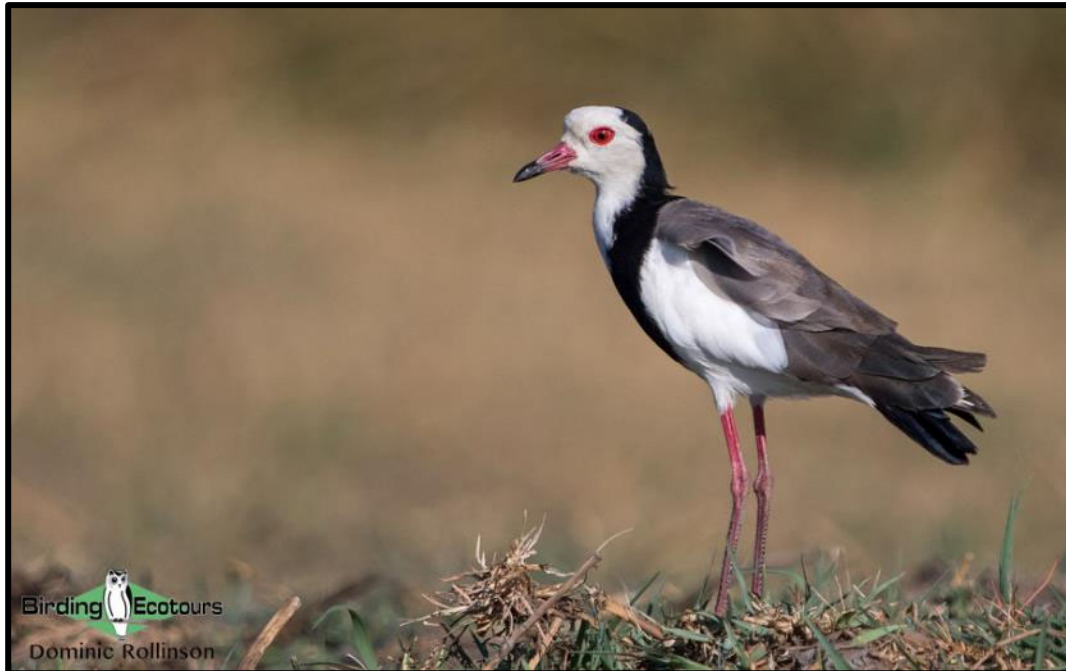
The strikingly colored Long-toed Lapwing can be seen at Lake Naivasha.

Up to 80 waterbird species have been recorded during censuses, including White-backed Duck , Saddle-billed Stork , Marabou Stork , African Spoonbill , Great Crested Grebe , the ubiquitous but attractive African Jacana , and various striking lapwing species such as Long-toed and Spur-winged Lapwings .