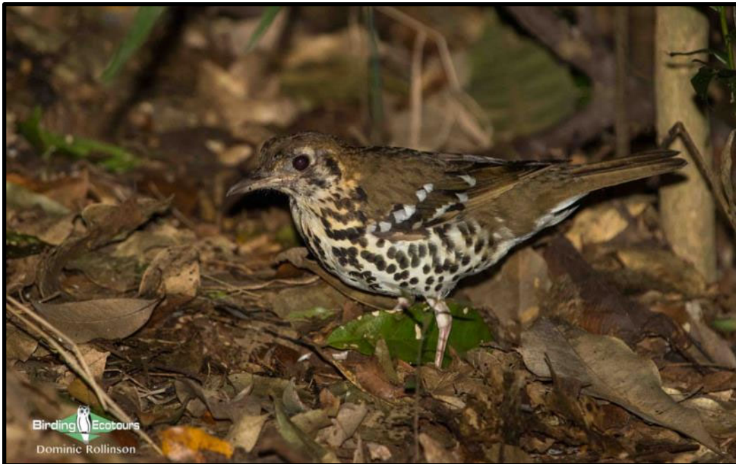
The sought-after Spotted Ground Thrush can be found at Arabuko-Sokoke National Reserve.