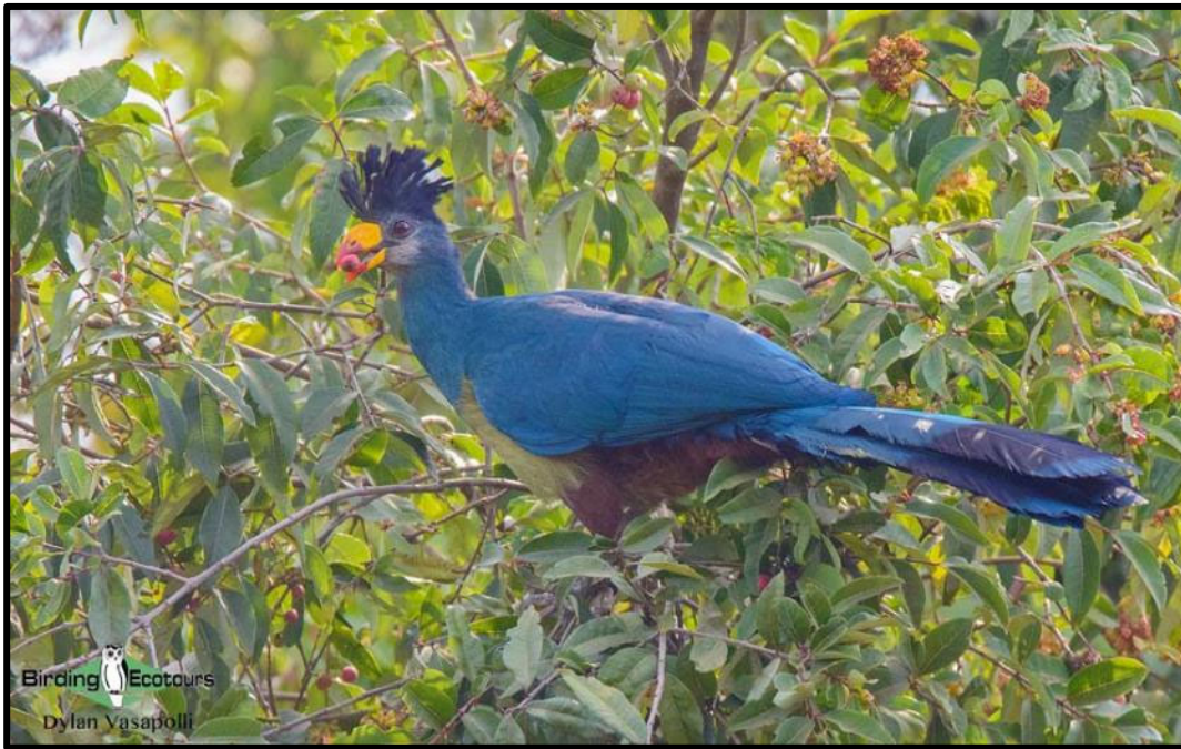
Great Blue Turaco is loud and conspicuous in Kakamega Forest.