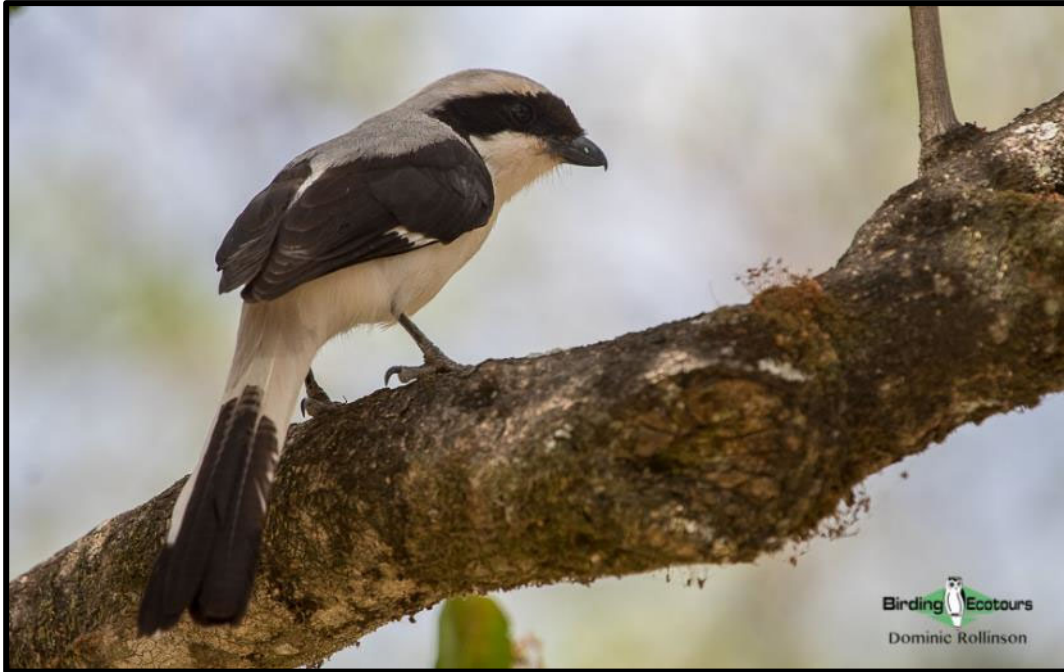
Grey-backed Fiscal may be seen at Lake Nakuru National Park.