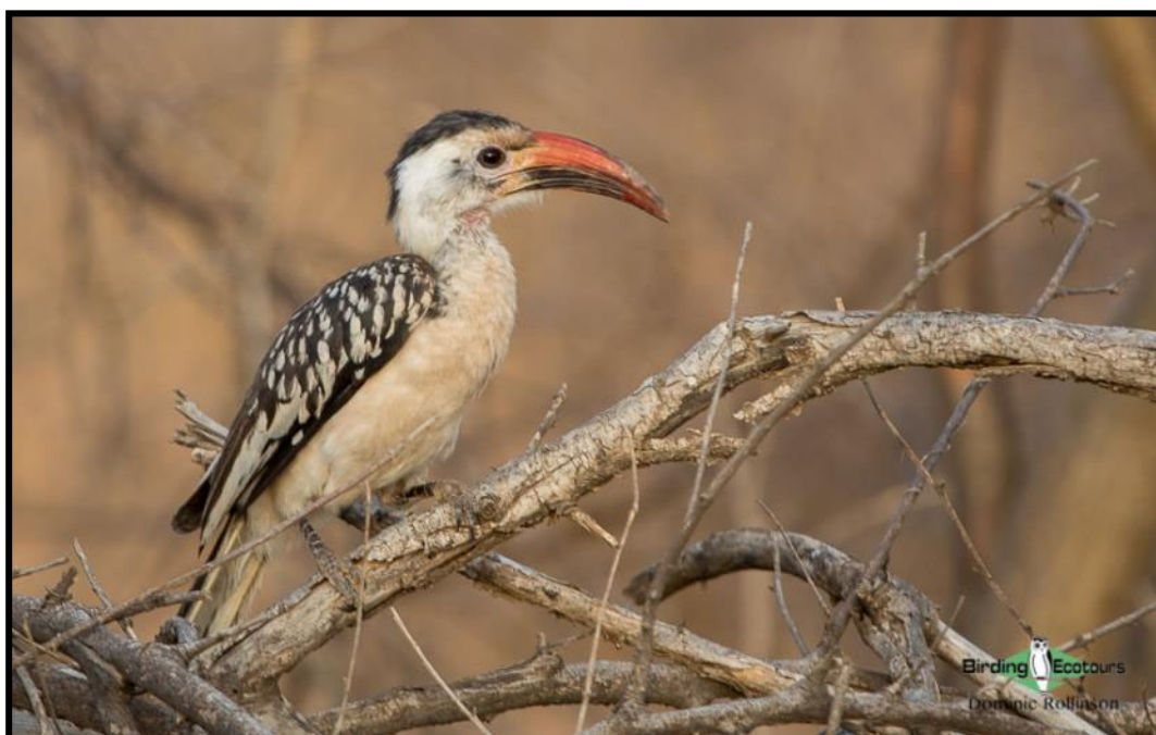
Northern Red-billed Hornbill is one of a number of hornbill species we should see in Kenya.