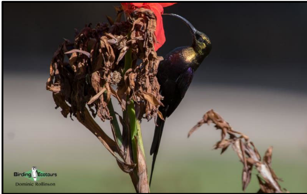
Tacazze Sunbird is one of the many beauties we will look for at Thomson's Falls.

We'll depart, after breakfast, for Olpajeta Wildlife Conservancy , allowing time to search for several key species along the way. We will also have a stopover at Thomson's Falls at Nyahururu which is one of Kenya's highest towns, at 7,700 feet (2,360 meters) above sea level. Just outside the town lies Thomson's Falls on the Ewaso Narok River. It falls an impressive 230 feet (72 meters), with the mist feeding the dense forest below. At Thomson's Falls we're likely to see Chestnut-winged and Slender-billed Starlings , Rock Martin , Grey Cuckooshrike , Kikuyu White-eye , and Tacazze and Collared Sunbirds . We will have our lunch here before proceeding to Olpajeta, however we will have a stop en route at Wajee Camp to look for the Vulnerable (IUCN) Kenyan endemic Hinde's Babbler as well as Holub's Golden Weaver .