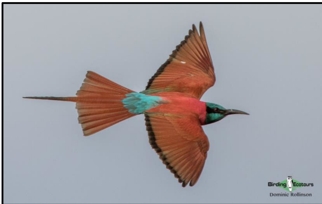
The vivid colors of Northern Carmine Bee-eater will leave you awestruck.

After a two-hour boat ride, we have an hour or so to search for terrestrial beauties here like Eastern Violet-backed Sunbird , Spotted Palm Thrush and Abyssinian Roller among others, before we break for lunch. In the late afternoon we resume birding, now along the cliffs, looking for Hemprich's Hornbill , Bristle-crowned Starling , Verreaux's Eagle , and Rock Hyrax , the eagle's main prey. With the help of a local naturalist, we'll walk along the famous Tugen Hills, known for their great diversity of raptors and owls, as well as interesting passerines. Here we hope to find Three-banded Courser , Slender-tailed Nightjar , Greyish Eagle-Owl , Verreaux's Eagle-Owl , Pearl-spotted Owlet , Lichtenstein's Sandgrouse , White-bellied Canary , Brown-tailed Rock Chat , Jackson's Hornbill , Speckle-fronted Weaver , White-billed and White-headed Buffalo Weavers , Dark Chanting Goshawk , African Grey and Nubian Woodpeckers , Red-and-yellow and D'Arnaud's Barbets , and Purple Roller , and many others.