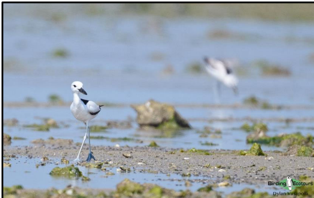
We may be lucky enough to encounter Crab-plover along the Indian Ocean coastline.

Kenya has a spectacularly diverse array of habitats packed into a small area. These range from humid tropical lowland forests with localized denizens such as Sokoke Scops Owl near the idyllic Indian Ocean coastline (which boasts Crab-plover ), to snow-capped mountains at over 16,000 feet (5,000 meters) above sea level! In between the sea and the high mountains are vast arid savannas and grasslands that are famous for their endless herds of wildlife, opportunistic predators such as Africa's big cats, and a myriad of colorful bird species. Then there are the Great Rift Valley scarps and flamingo-filled lakes, highland grasslands, the Taita Hills, a staggeringly bird-diverse tropical rainforest in the form of Kakamega and last but not least the papyrus-lined Lake Victoria, the continent's biggest lake.