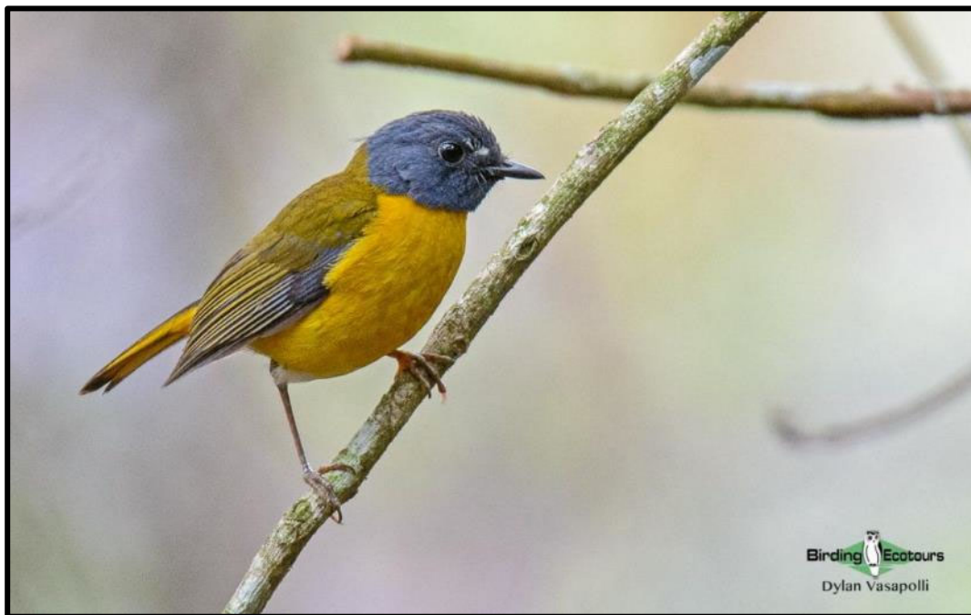
The pretty White-starred Robin can be seen in Afromontane forests in Kenya.

This morning we travel to Gatamaiyu Forest , part of the chain of forest fragments that form the Kikuyu Escarpment Forest about 37 miles (59 kilometers) north-west of Nairobi. This is a tropical montane forest at the foot of the Aberdare range. The forest covers close to 12,000 acres (4,720 hectares). Here, we will look for the Vulnerable (IUCN) Abbott's Starling in the forest canopy, a denizen of a few Afromontane forests in East Africa. We will also look for other range-restricted species such as Jackson's Spurfowl and Hunter's Cisticola . With luck we may find Rufous-breasted Sparrowhawk and Africa's heaviest and most powerful (but not biggest) eagle, Crowned Eagle . Other species we hope to get acquainted with here are African Hill Babbler , White-starred Robin , Silvery-cheeked Hornbill , Tambourine Dove , Mountain Greenbul , the gorgeous and personality-filled Hartlaub's Turaco , Slender-billed Greenbul and Kikuyu White-eye among many others. We plan to finish our birding here in the late morning before rewarding ourselves with a picnic lunch.