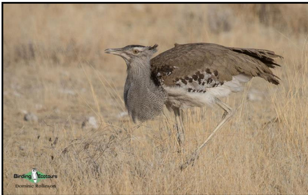
The massive Kori Bustard is often seen strolling across the open plains.

like a sudden surprising, stunning outlook from a viewpoint at the top of the escarpment over the width of the Great Rift Valley , with Rock Hyraxes also enjoying the view. All kinds of spectacular birds along with large (and small!) game animals abound, including Grey Crowned Crane , Secretarybird , Common Wildebeest , Thomson's Gazelle , Plains Zebra , Impala , Black-backed Jackal , Common Duiker , Vervet Monkey , and even (Maasai) Giraffe – roaming freely in the fields and using the roads together with the traffic, long before we even enter any game reserve.