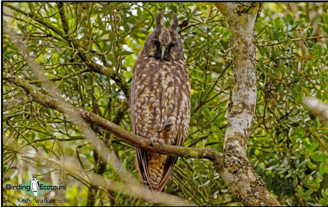
We will look for some owls at their day roosts, such as this Stygian Owl.

by Rufous-crested Coquette , Black-throated and Long-tailed Hermits , White-chinned and Golden-tailed Sapphire , Brown Violetear , and Grey-breasted Sabrewing . Others birds here include species like Rusty-backed Antwren , Black-faced Tanager , Wedge-tailed Grass Finch , Masked Duck , the endemic Huallaga Tanager , Lafresnaye's Piculet , Fiery-throated Fruiteater , Black-and-white Tody-Flycatcher , and others. At night we will try for Band-bellied Owl , Stygian Owl , Striped Owl , Black-banded Owl , Tropical Screech Owl , and Vermiculated Screech Owl . Ferruginous Pygmy Owl can be seen by day and at night.