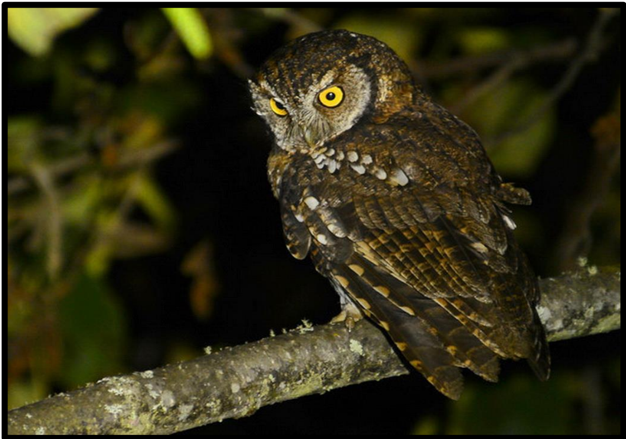
The endemic Koepcke's Screech Owl is one of our many fantastic owl targets on this trip.