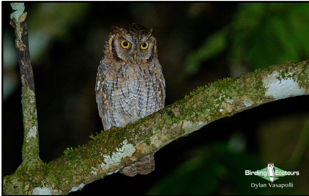
Tropical Screech Owl, another of our screech owl targets.

scarfed Tanager, Scarlet-bellied Mountain Tanager, Golden-headed Quetzal, Northern Mountain Cacique, Blackish Tapaculo, and the endemic Russet-mantled Softtail, and we will also try for the recently recorded Neblina Tapaculo. Our main target here will be the Andean Pygmy Owl.