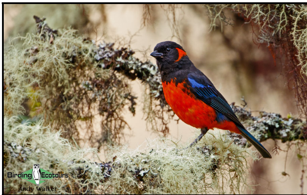
Scarlet-bellied Mountain Tanager can be seen along the Manu Road.

Overnight: Wayqecha Cloud Forest Biological Station