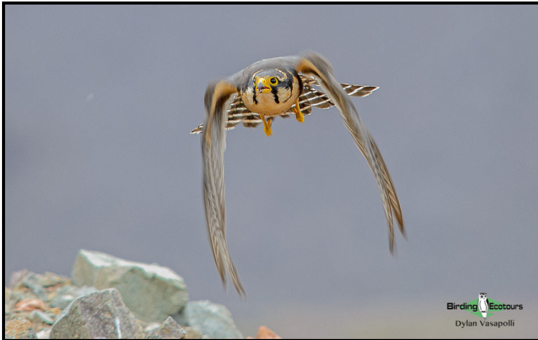
The attractive Aplomado Falcon