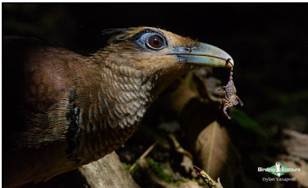
Rufous-vented Ground Cuckoo occurs in low densities in Manu National Park.

Tody-Flycatcher, Black-backed Tody-Flycatcher, Marcapata Spinetail, Rufous-fronted Antthrush, Amazonian Antpitta, Red-billed Pied Tanager, Rufous Twistwing, Purus and White-throated Jacamars, Orange-fronted Plushcrown, Fine-barred Piculet, Scarlet-hooded Barbet, and Blue-headed Macaw. We will be lucky if we have encounters with the rare Harpy Eagle and Rufous-vented Ground Cuckoo , both of which occur in the lowlands of the Manu National Park.