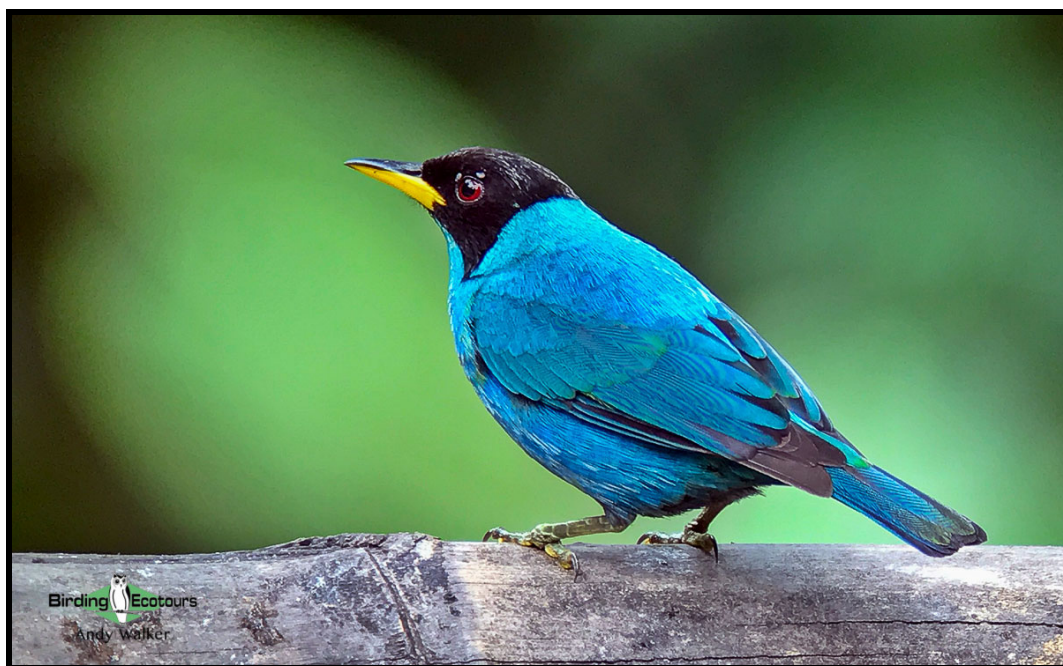
Green Honeycreepers can be seen at Cock of the Rock Lodge.