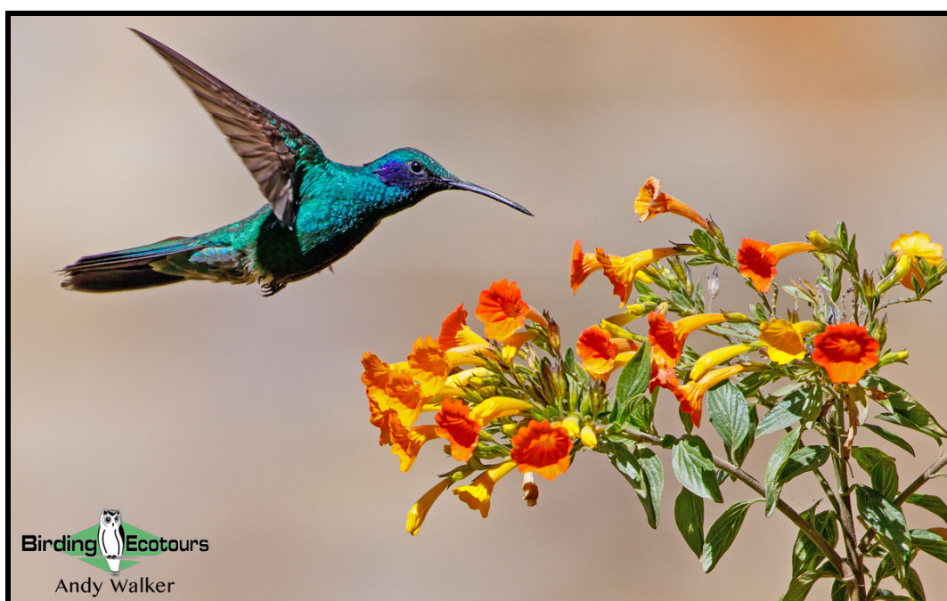
Sparkling Violetear often visits the feeders at Cock of the Rock Lodge.

The hummingbird feeders attract Violet-fronted Brilliant, Fork-tailed Woodnymph, Rufous-booted Racket-tail, Many-spotted Hummingbird, and Sparkling Violetear. The flowering bushes are good for Wire-crested Thorntail, Green Hermit, and Wedge-billed Hummingbird.