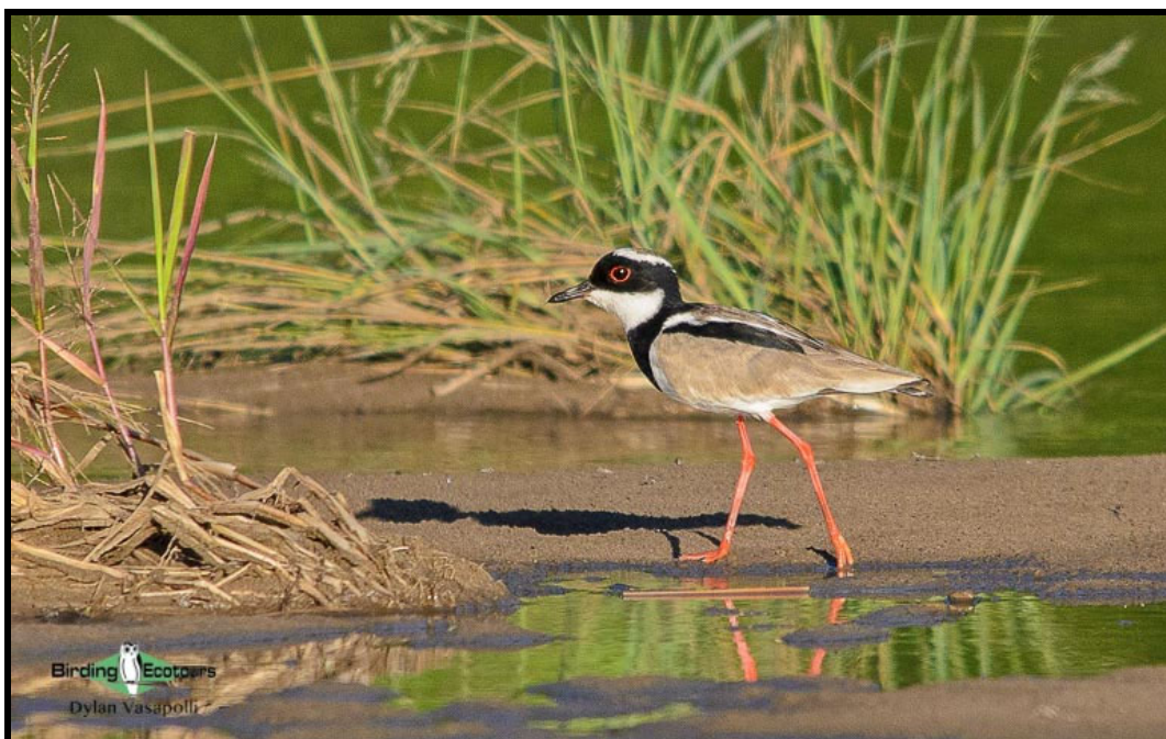
Pied Plover is regularly seen during our boat transfer.