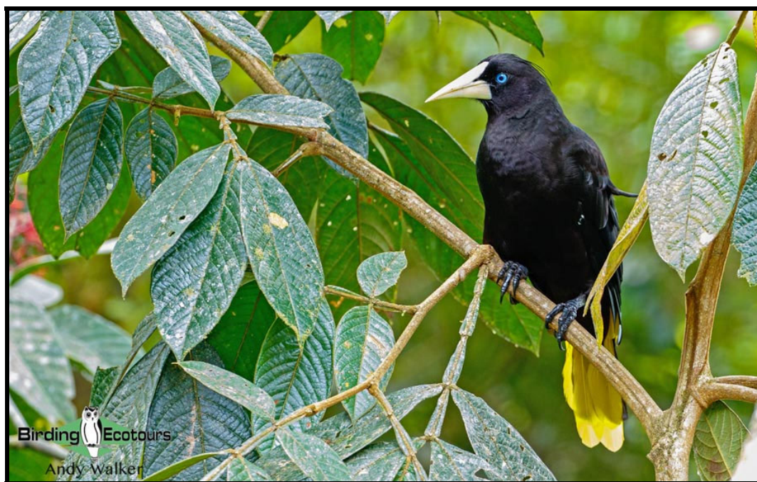
The unusual-looking Crested Oropendola.

Overnight: Villa Carmen Biological Station