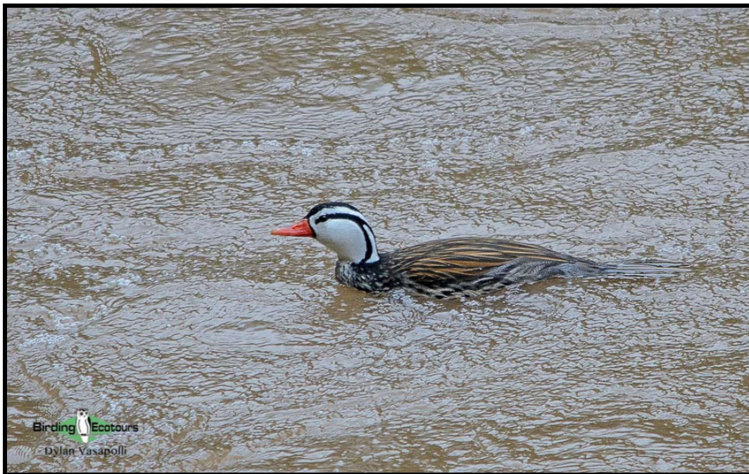
Torrent Duck can be seen in fast-flowing streams at high elevations.

Each habitat exhibits a unique ecosystem and avifauna with some of the most representative birds of this part of the world, such as Andean Cock-of-the-rock , Andean Condor , Torrent Duck , Sungrebe , Sunbittern , Hoatzin , Red-billed Scythebill , Paradise Tanager , Pale-winged Trumpeter , Razor-billed Curassow , Undulated Tinamou , Lyre-tailed Nightjar , Blue-and-yellow Macaw , Band-tailed Manakin , White-throated Toucan , Grey-breasted Mountain Toucan , Pavonine Quetzal , White-capped Dipper , and a lot of hummingbirds, including the endemic Bearded Mountaineer , Giant Hummingbird , and the handsome Rufous-booted Racket-tail .