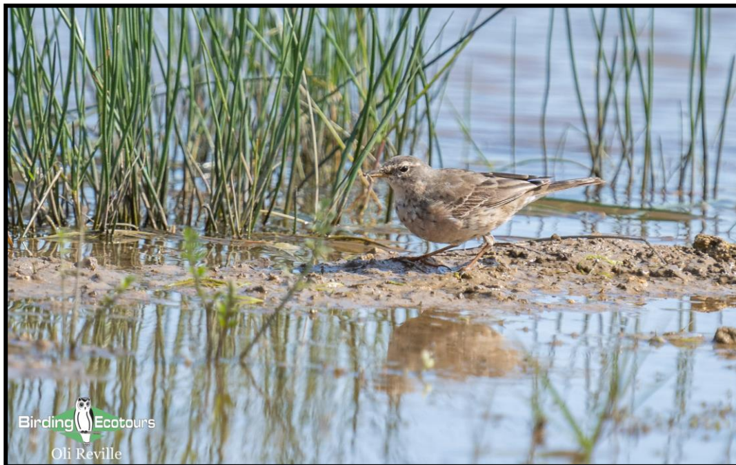
Water Pipit can make for a nice surprise at the excellent Potter Heigham marshes.

Geese and ducks use the site in winter with Pink-footed Goose , Common Shelduck , Eurasian Wigeon , Eurasian Teal , and Mallard making up most of the numbers. However, we will also stand a chance of Greater White-fronted Goose , Gadwall , Northern Pintail , and Tufted Duck . Birds of prey such as Western Marsh Harrier and Common Kestrel should be present throughout our visit and we may locate a Western Barn Owl as the day progresses. The site can also be a great spot to see, or hear, one of the Norfolk Broad's most iconic species, Common Crane . However, these are not guaranteed at this spot and that is why we will end the day at Stubbs Mill where we have a far higher chance of seeing this elegant and beautiful species.