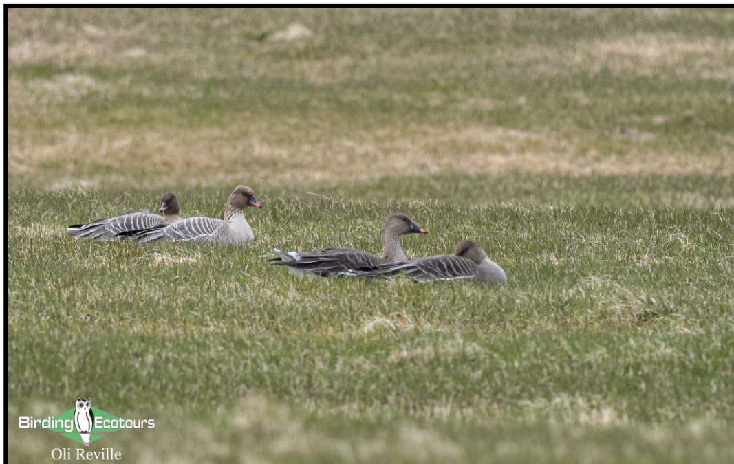
Both bean geese species can sometimes be found among the many Pink-footed Geese (left) that winter in the Yare Valley. Here two Taiga Bean Geese (right) join their more abundant cousin.

We will move through the reserve and stop at a series of hides that are in strategic positions for watching wildlife. Careful scanning of the waterways close to the path may give us a glimpse of the shy European Water Vole , an increasingly rare species in the United Kingdom (UK). We will pause and spend some time looking over the Yare River and across to the Wheatfen broad reedbeds. This spot is particularly good for birds of prey and gives us a further chance of Western Marsh Harrier , Short-eared Owl , and Hen Harrier , plus Peregrine Falcon and Merlin . Eurasian Bittern can also be evident between this spot and the superb tower hide on the reserve. The tower hide serves as a vantage point which gives us a great view over the reserve and we will spend some time here scanning the reedbeds. We will continue our loop around the reserve, stopping at points of interest, before making our way back to the visitor center. After a stop for a toilet break, we will drive a short way to our second site of the day where we will spend the afternoon.