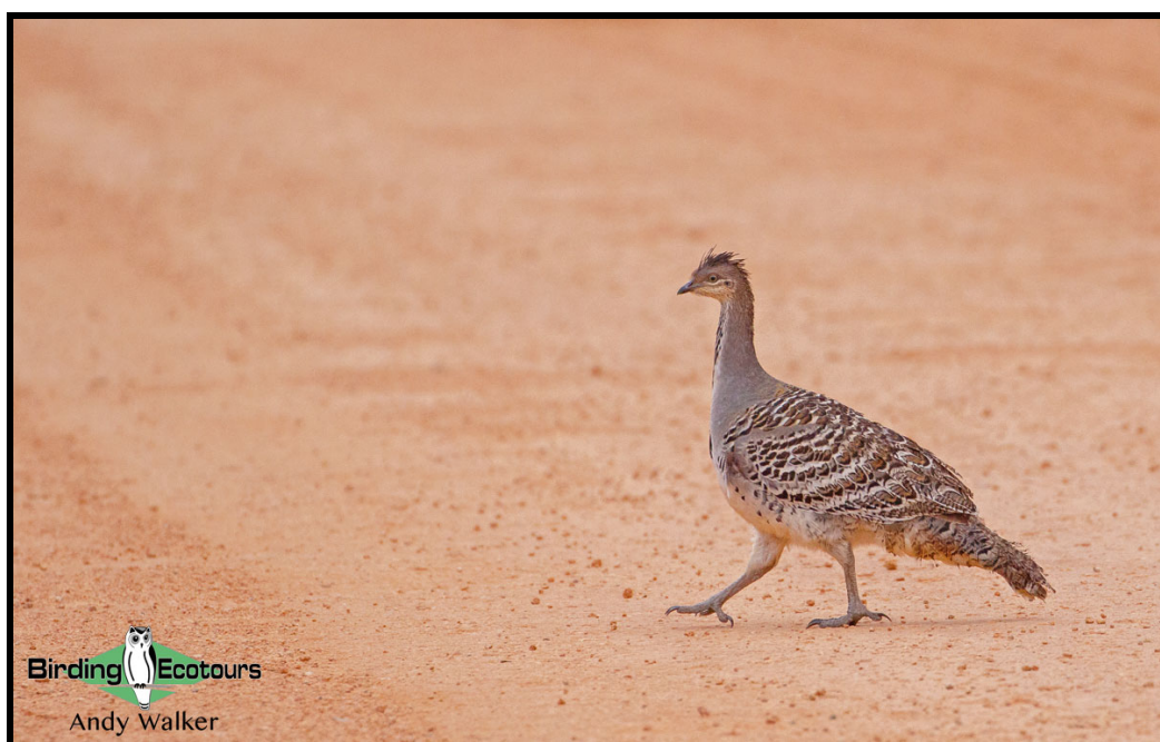
A top target while in mallee habitat will be Malleefowl .

Founded in 1921, Wyperfeld National Park protects a significant tract of semi-arid mallee woodland and heathland. Depending on local conditions we may visit this site as we are passing. High on our list of priorities here would be the appropriately named Malleefowl , Southern Scrub Robin , Splendid Fairywren , and Southern Whiteface , and other birds of the dry Australian interior are also possible.