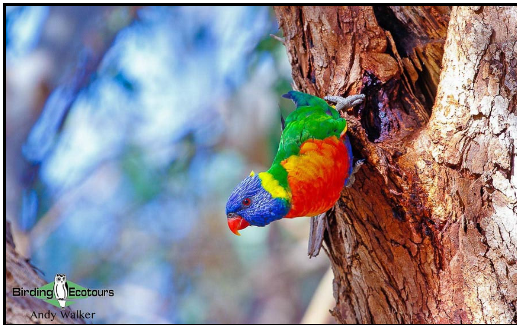
The gaudy Rainbow Lorikeet can be seen around Melbourne.