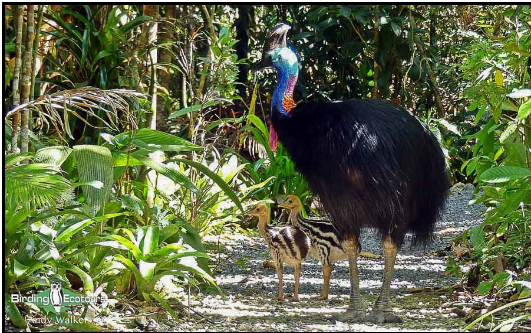
The massive Southern Cassowary can be seen in northern Queensland.

On the last leg of our journey we visit the Wet Tropics of far northern Queensland to explore one of the world's most ancient rainforests for key species such as Southern Cassowary and Buff-breasted Paradise Kingfisher . We also take a day trip to the Great Barrier Reef, where the colors and diversity of the fish and corals rival those of the birds, with a chance to swim with Green Turtles . Evening spotlighting sessions on many of these nights should also produce a host of endearing and unusual nocturnal birds and mammals, which may include Papuan Frogmouth and Barking Owl . Other target birds in the north include Great-billed Heron , Australian Bustard , Victoria's Riflebird , Tooth-billed Bowerbird , Great Bowerbird , Golden Bowerbird , Fernwren , and Chowchilla to name a few.