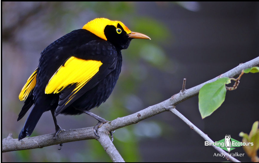
Gorgeous Regent Bowerbirds are often present around our rooms!