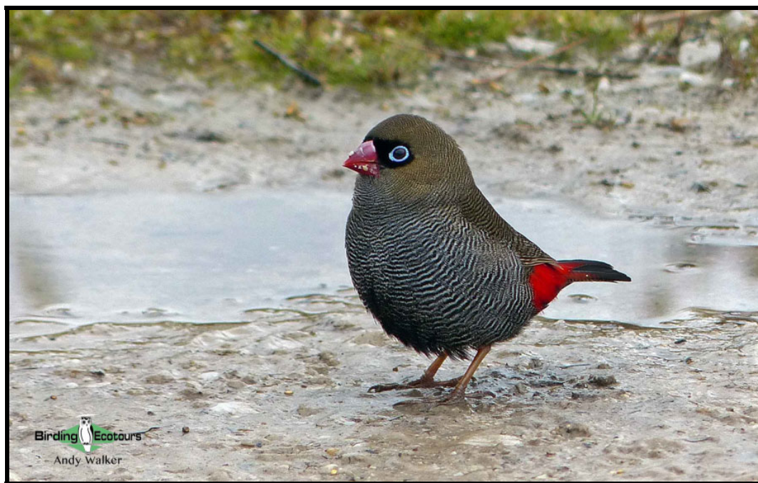
Beautiful Firetail inhabits low shrubs in central Victoria.