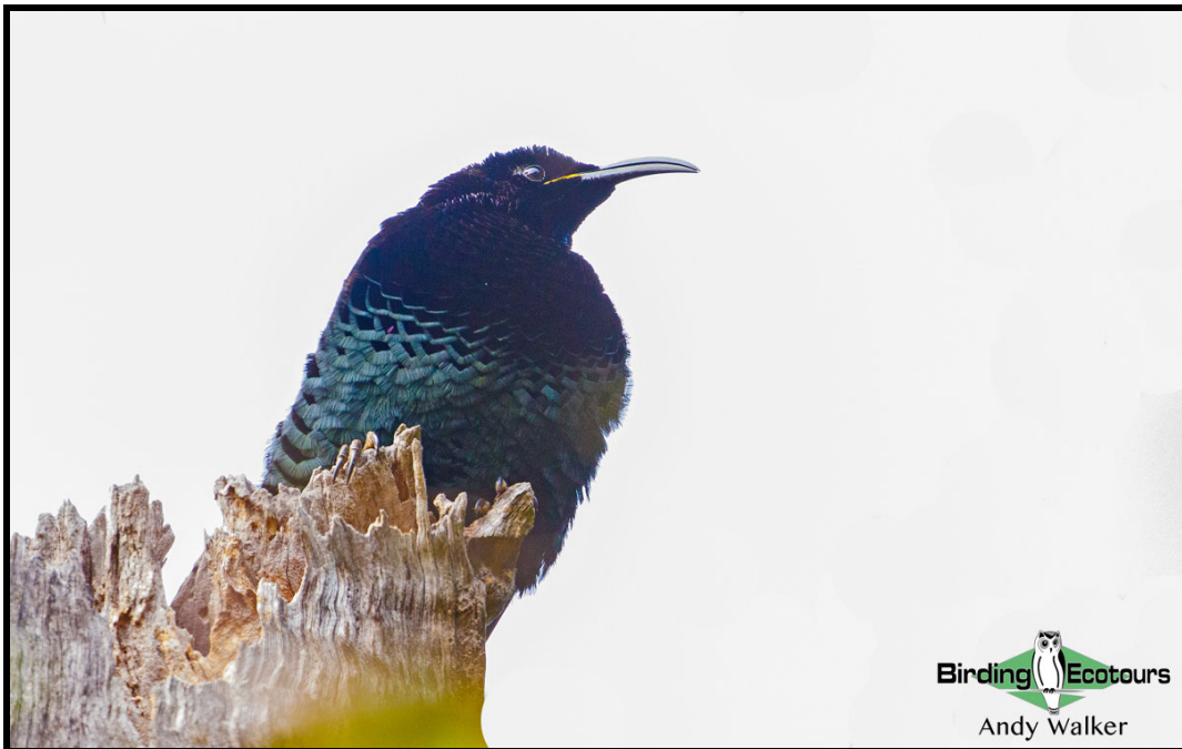
The Lamington area will offer us our first chance at seeing a bird-of-paradise; this being a Paradise Riflebird .