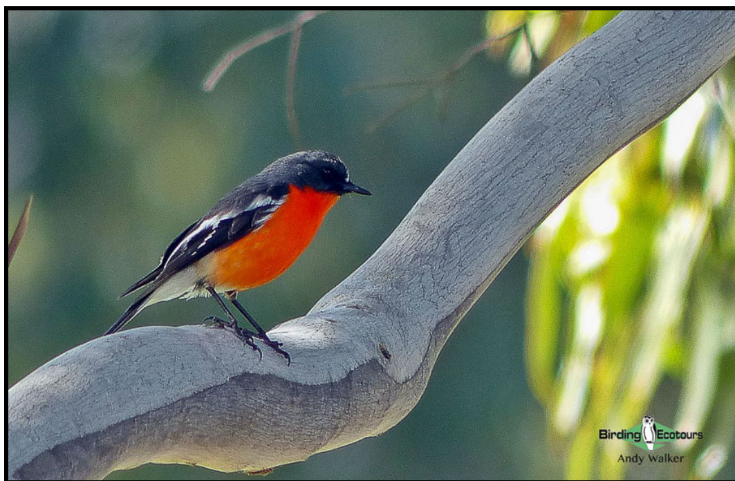
Flame Robin is one of the three robin species we can see around Melbourne.