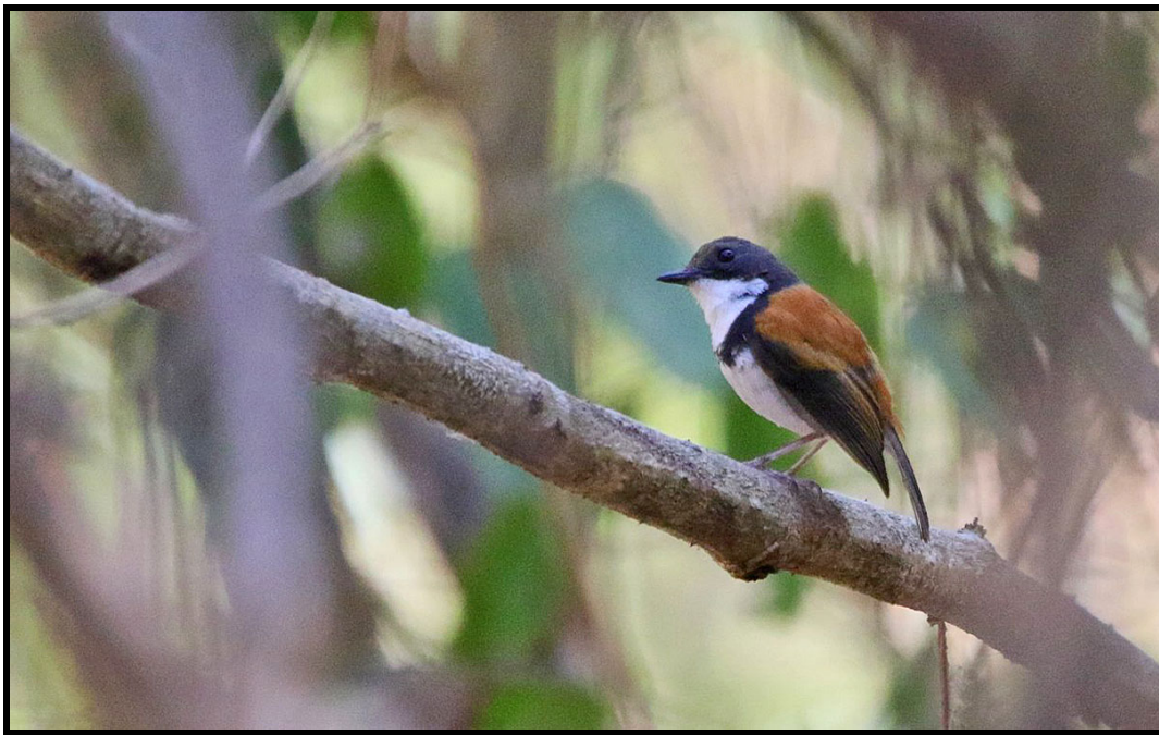
Black-banded Flycatcher , striking even by Ficedula standards and endemic to Timor.

We will make the most of a rare lie in before we take our late-morning flight to the small island of Alor. On clearing the airport we will make a stop at the Takpala traditional village to enjoy some hospitality and dancing prior to visiting the Hutan Nostalgia Nature Reserve for some birding. Here we hope to find Olive-headed Lorikeet , Timor Cuckoo-Dove , Little (Eucalypt) Cuckoo-Dove , and Spotted Kestrel . If time permits, we may make our first attempt to find Alor Boobook in the evening.