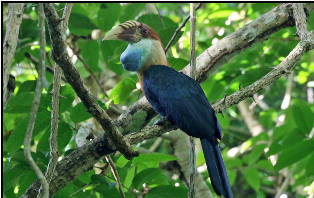
A medium-sized hornbill at 22 inches (55 centimeters), the endemic and uncommon Sumba Hornbill will be a major target during our time in the forests of Sumba.