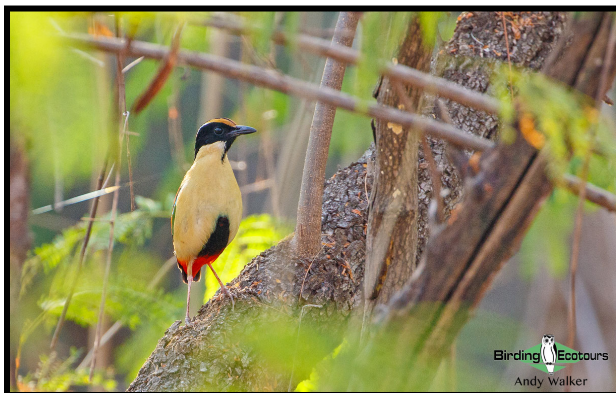
Ornate Pitta, one of many exciting targets on this multi-island tour.