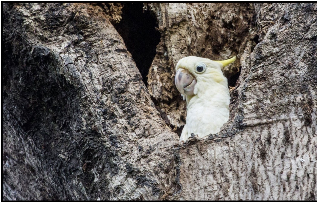
The Critically Endangered (BirdLife International) Yellow-crested Cockatoo will be a big target bird on Komodo Island.

The morning will be spent birding in Komodo National Park where we will look for the rare Yellow-crested Cockatoo (the yellow-crested subspecies rather than the citron-crested subspecies we will have looked for earlier on the tour on Sumba). There are other birds we will look for on Komodo Island, such as Flores Hawk-Eagle , Variable (Nusa Tenggara) Goshawk , Orange-footed Scrubfowl , Green Junglefowl , Barred Dove , and Lemon-bellied White-eye .