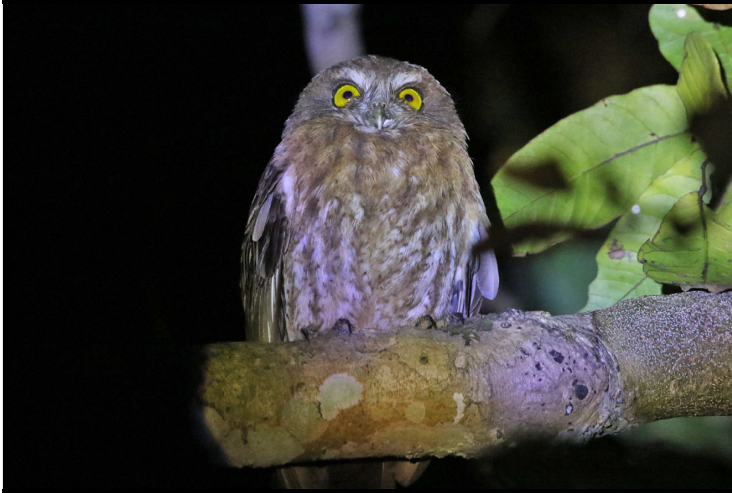
Little Sumba Hawk-Owl is one of two endemic Ninox owls we will be looking for in Billa Forest.