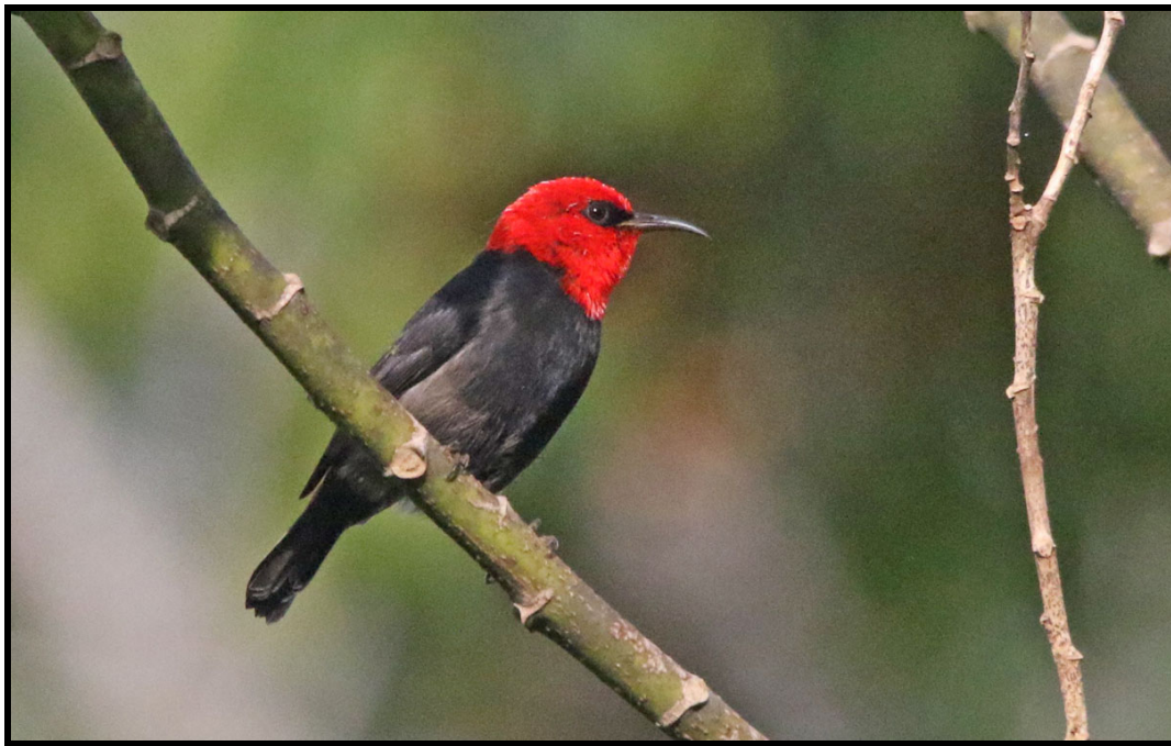
Sumba Myzomela is one of several range-restricted myzomelas (tiny honeyeaters) that we can enjoy on the tour

Our tour will focus on finding the island endemic birds, regional endemic birds, and many localized specials on offer here such as Sumba Hornbill , Sumba Buttonquail , Cinnamon-banded Kingfisher , Little Sumba Hawk-Owl , Sumba Boobook , Rote Boobook , Rote Myzomela , “Mt Mutis Parrotfinch” (a currently undescribed species), Black-breasted (Timor) Myzomela , Timor Imperial Pigeon , Timor Friarbird , Timor Sparrow , Orange-sided Thrush , Black-banded Flycatcher , Alor Myzomela , Alor Boobook , Flores Hawk-Eagle , Flores Scops Owl , Wallace’s Scops Owl , Chestnut-capped Thrush , Chestnut-backed Thrush , Flores Crow , Flores Monarch , Elegant Pitta , Ornate Pitta (split in 2021 from Elegant Pitta ), Glittering Kingfisher , Yellow-crested Cockatoo (yellow-crested and citron-crested subspecies, considered separate species by some), Sunda Pygmy Woodpecker , and many more, including an exciting range of parrots, fruit doves, sunbirds, and raptors. Komodo Dragons are likely to be a non-avian highlight when we step into a Jurassic world on the island they share their name with.