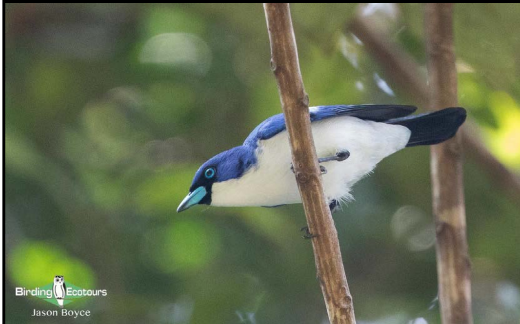
An inquisitive Blue Vanga .