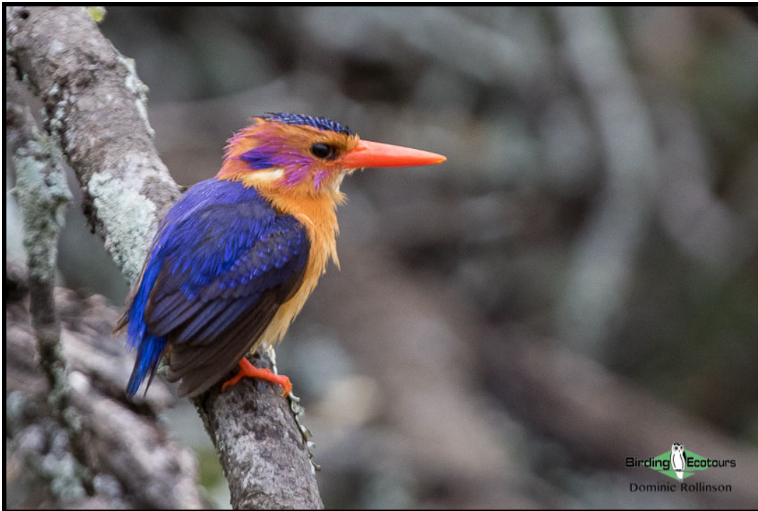
The tiny African Pygmy Kingfisher is an intra-African migrant to the area.

After lunch and relaxing for a few hours we will finish the day with a boat cruise in Chobe. Besides the birds mentioned earlier we will look for huge flocks of Collared and, if we are lucky, Black-winged Pratincoles, Southern Carmine and White-fronted Bee-eater colonies, Water Thick-knee, African Marsh Harrier, and Pink-backed and Great White Pelicans. The beautiful African Skimmer and African Fish Eagle are always present in good numbers. Between the birding we will also enjoy great game viewing, and seeing a baby elephant holding on to its mother's tail while crossing the river is an unforgettable sight.