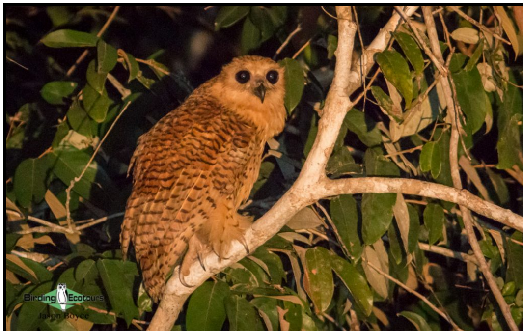
Pel's Fishing Owl is always a big target on a trip to the Okavango area.

Some of the birds we will be looking for include Pel's Fishing Owl , White-backed Night Heron , African Finfoot , Western Banded Snake Eagle , Rock Pratincole , Hartlaub's Babbler , Luapula and Chirping Cisticolas , Schalow's Turaco , Brown Firefinch , Coppery-tailed and White-browed Coucals , African Skimmer , Swamp Boubou , Copper Sunbird , Holub's Golden and Southern Brown-throated Weavers , Greater Swamp Warbler , Slaty Egret , and African Pygmy Goose .