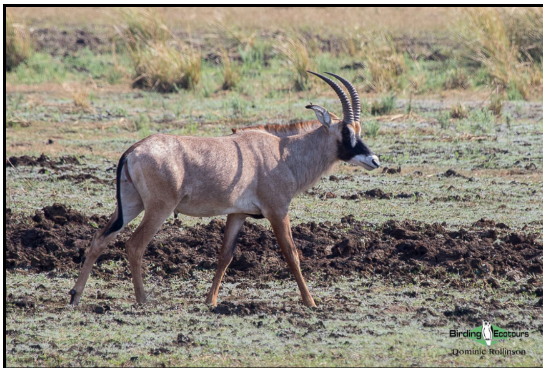
The rare Roan Antelope may be encountered on this trip.

With an early start we have the advantage of having the park to ourselves, since other game drive vehicles will only start making their way into the park. While looking for any nocturnal animals and birds that might still be out and about, we will make our way towards the teak and broadleaved woodland of the Kalwezi Valley and Nantanga cutline. Here we will focus our attention on finding Arnot's Chat, Broad-tailed and Long-tailed Paradise Whydahs, Racket-tailed and Broad-billed Rollers, Tree and Wood Pipits, Dusky Lark, Dickinson's Kestrel, White-breasted Cuckooshrike, Bronze-winged Courser, Orange-winged Pytilia, Green-capped Eremomela, African Cuckoo-Hawk, Ayers's Hawk-Eagle, and Lizard Buzzard.