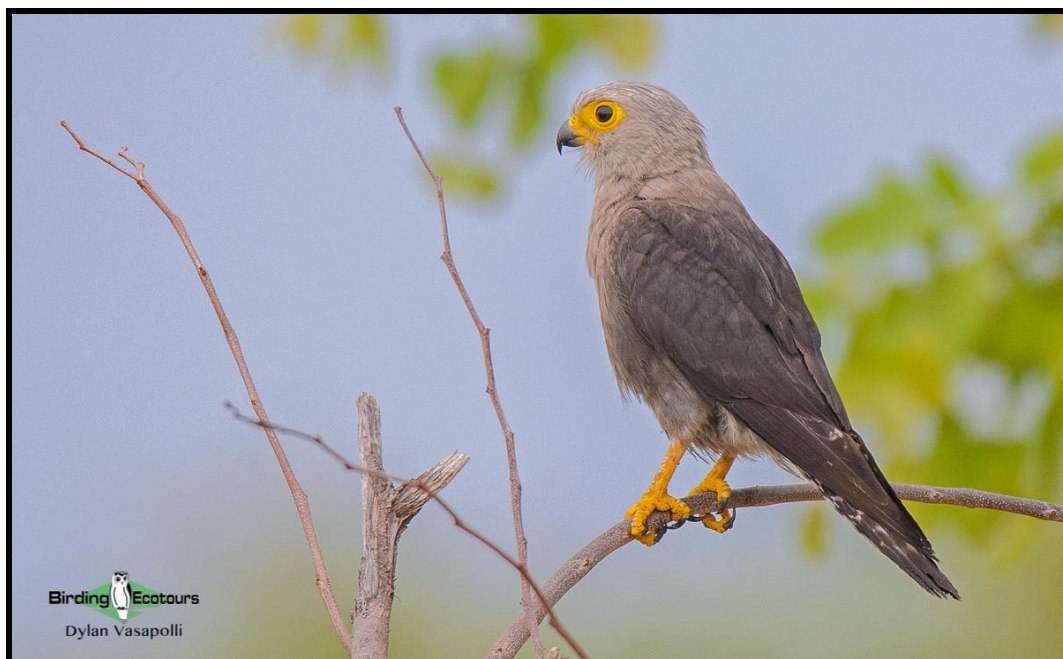
Dickinson's Kestrel; another raptor target.