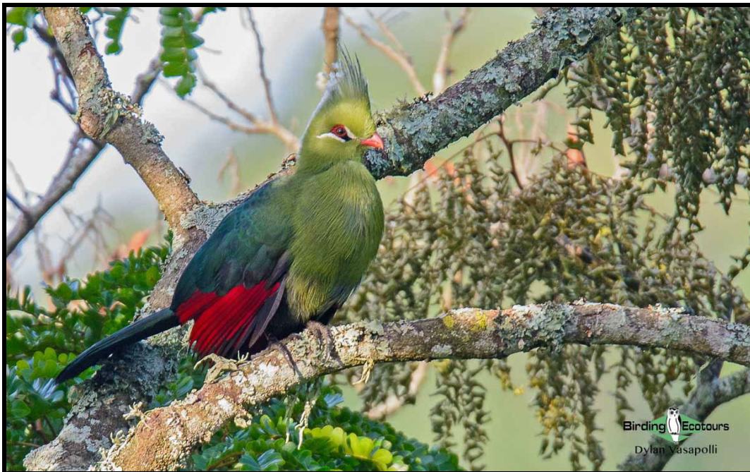
The loud and brightly-colored Schalow's Turaco is found on Impalila Island.