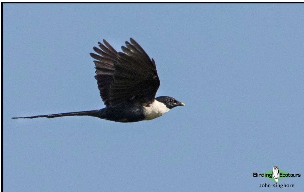
White-necked Myna is a stunning yet widespread species on Sulawesi.

We will spend the morning in the same highland forest area as the previous afternoon and will look for Lompobattang Flycatcher , Black-ringed White-eye , Red-eared Fruit Dove , and Hylocitrea , once again, along with other species such as Piping Crow , Bay Coucal , Sulawesi Blue Flycatcher , Sulawesi Myzomela , Sulawesi Fantail , Sulawesi Leaf Warbler , Malia – a large (c12 inches/30 centimeters), bizarre and slightly enigmatic endemic bird, that is now considered to be part of the Locustellidae (Grassbirds and Allies) family, Sulawesi Swiftlet , Sulawesi Serpent Eagle , Sulawesi Thrush , Sulawesi Drongo , Black-crowned White-eye , Warbling (Mountain) White-eye , Sulphur-vented Whistler , Spot-tailed Sparrowhawk , Golden-mantled Racket-tail , Turquoise Flycatcher , Citrine Canary-flycatcher , Snowy-browed Flycatcher , Crimson-crowned Flowerpecker , Sulawesi Bush Warbler , White-necked Myna , Fiery-browed Starling , and Dark-eared Myza .