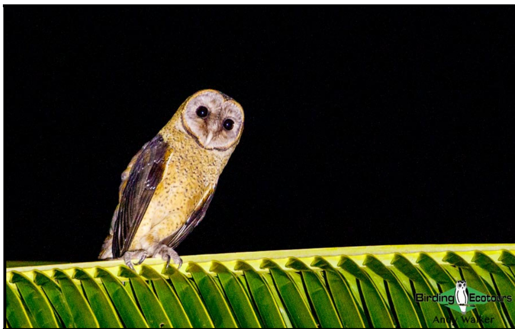
Sulawesi Masked Owl is one of several exciting nightbirds possible on the tour.