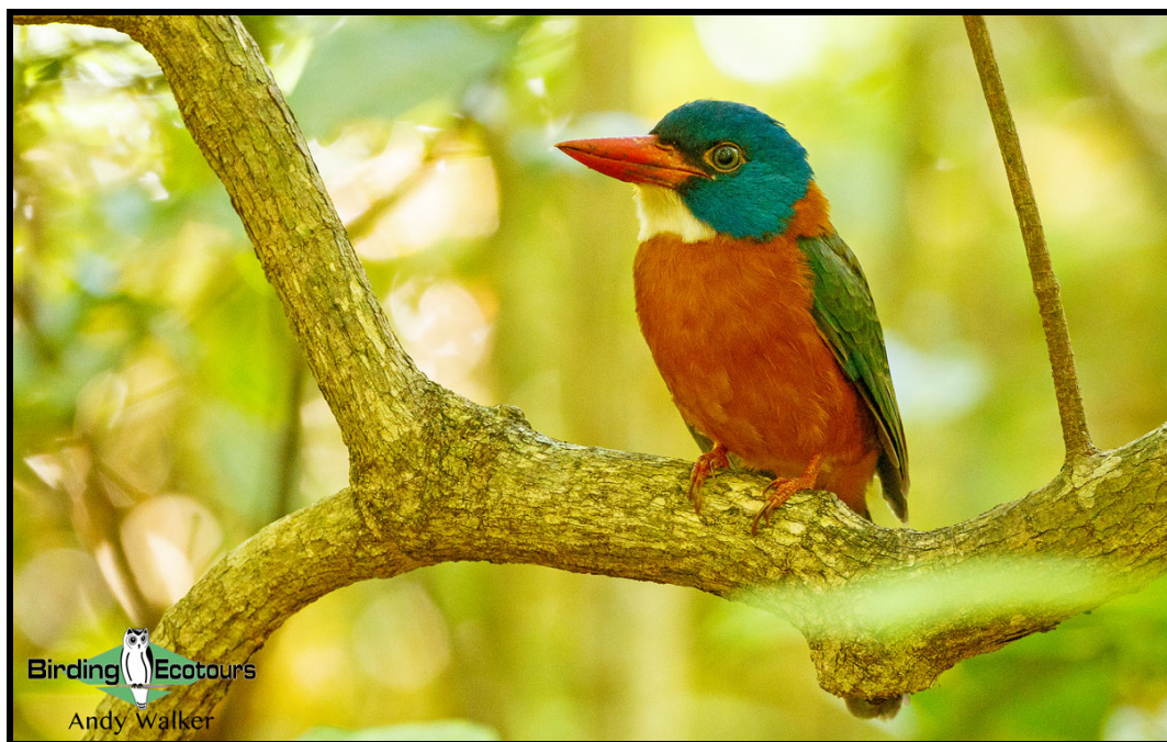
A large Green-backed Kingfisher waits patiently for its prey (usually a lizard) low in the forest understorey in northern Sulawesi, where it is an endemic.

The above is just a few of the potential highlight birds we will be looking for. Some of the many other targets include Gurney's Eagle , Sulawesi Nightjar , Purple-bearded Bee-eater , Sulawesi Pitta , North Moluccan Pitta , Invisible Rail , Blue-faced Rail , Grey-headed Fruit Dove , White-necked Myna , Red-backed Thrush , Ashy Woodpecker , Knobbed Hornbill , Sulawesi Hornbill , Blyth's Hornbill , Yellow-billed Malkoha , Ochre-bellied Boobook , Halmahera Boobook , Scaly-breasted Kingfisher , Beach Kingfisher , Great-billed Kingfisher , Azure Dollarbird , Sulawesi Blue Flycatcher , Great Shortwing , Sulawesi Streaked Flycatcher , Malia , Rufous-bellied Triller , Piping Crow , Black-ringed White-eye , Lompobattang Flycatcher , (Halmahera) Paradise-crow (a member of the bird-of-paradise family), and Goliath Coucal . There are also plenty of brightly colored parrots (especially on Halmahera, which has a more Australasian feel than Sulawesi) such as White Cockatoo , Eclectus Parrot , Great-billed Parrot , Violet-necked Lory , Chattering Lory , Moluccan King Parrot , and Moluccan Hanging Parrot . A highly rewarding and thoroughly exciting tour is guaranteed here!