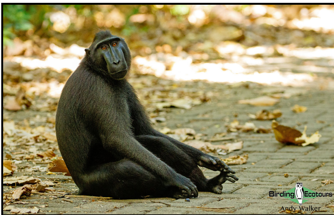
The Celebes Crested Macaque is a rather interesting mammal, very reminiscent of some of the African primates.

The park is also great for three really cool mammals, the tiny Spectral Tarsier (the smallest monkey in the world), (Sulawesi) Celebes (Black-) Crested Macaque , and (Sulawesi) Bear Cuscus – a marsupial! We are, after all, in that fascinating Wallacean mix-zone between Asia and Australasia.