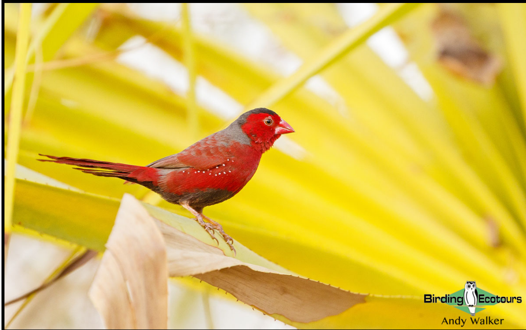
Crimson Finch is another finch species we hope to find on this tour.

As we spend the day exploring other areas nearby, we will look out for several other species that we may have yet to see during the tour, such as Apostlebird , Australian Bustard , Black-fronted Dotterel , Red-kneed Dotterel , Fairy Martin , Grey-crowned Babbler , Diamond Dove , Common Bronzewing , and Spotted Harrier .