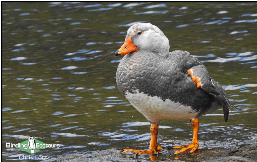
We should find Fuegian Steamer Duck in some of the more open areas near to Ushuaia.

Birding some of the more open areas throughout the day should hopefully produce sightings of some of the following: Upland and Ashy-headed Geese, Black-faced Ibis, South American Snipe, Rufous-chested Plover, Short-eared Owl, Dark-bellied and Grey-flanked Cinclodes and Austral Negrito . We will of course keep an eye to the sky looking out for the massive Andean Condor as well as other raptors such as Black-chested Buzzard-Eagle and Chimango and White-throated Caracaras .