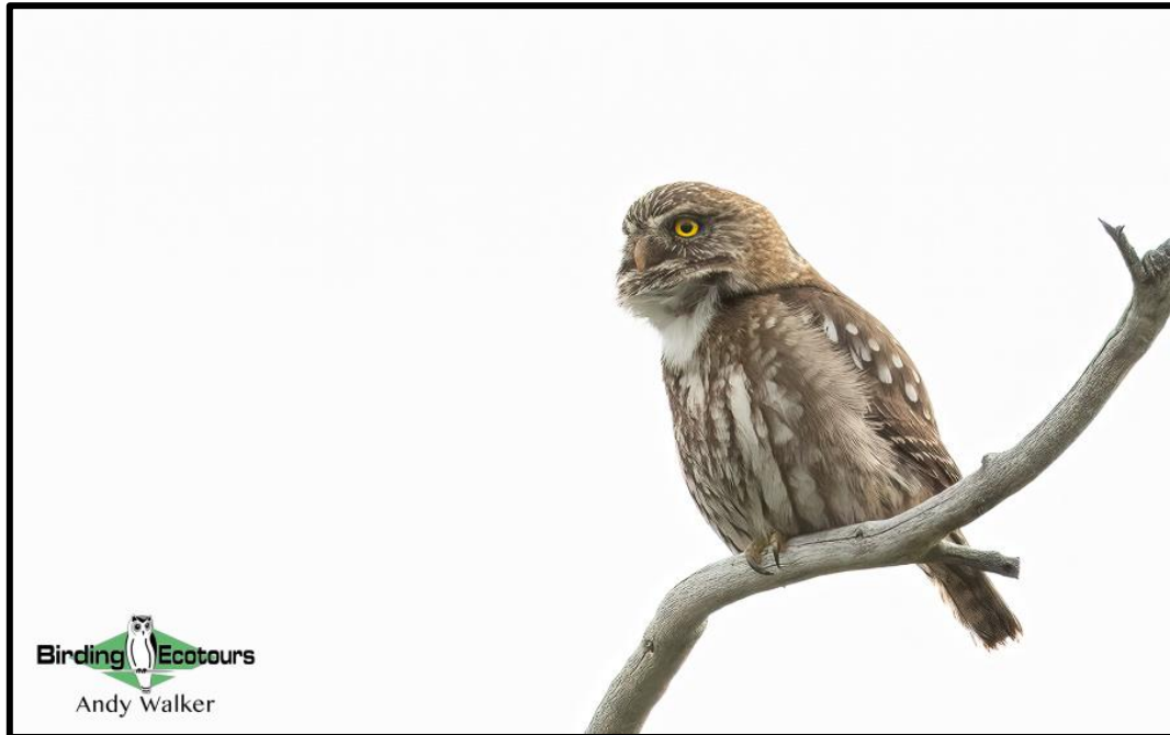
The cute Austral Pygmy Owl is another beech forest specialist.

The Patagonian beech forests will be searched for special birds such as Magellanic Woodpecker , Austral Pygmy Owl , White-throated Treerunner , Austral Parakeet , Thorn-tailed Rayadito , White-crested Elaenia , Patagonian Sierra Finch and Black-chinned Siskin .