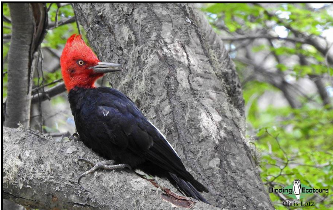
Magellanic Woodpecker will be one of the key target species, sought in the beech forests east of Ushuaia.

Birding some of the more open areas throughout the day should produce sightings of some of the following: Upland and Ashy-headed Geese, Black-faced Ibis, South American Snipe, Rufous-chested Dotterel, Short-eared Owl, Dark-bellied and Grey-flanked Cinclodes and Austral Negrito . We will of course keep an eye to the sky looking out for the massive Andean Condor as well as other raptors such as Black-chested Buzzard-Eagle and Chimango and White-throated Caracaras .