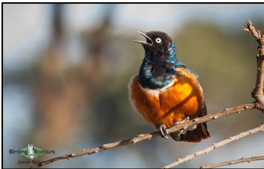
The aptly named Superb Starling .