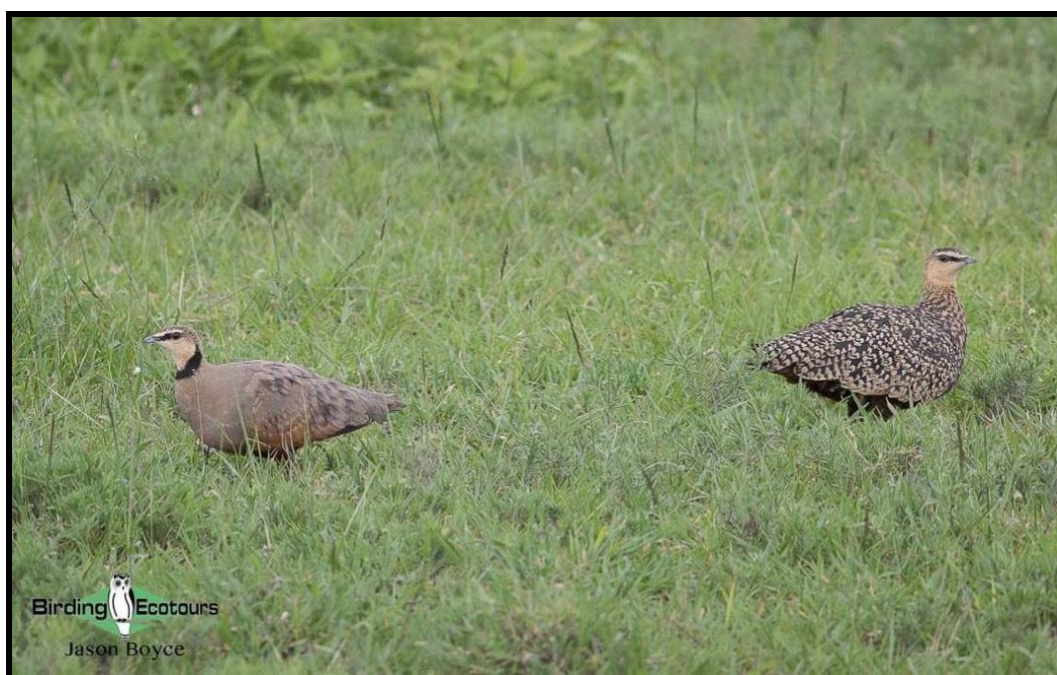
Yellow-throated Sandgrouse can be seen anywhere within the crater.