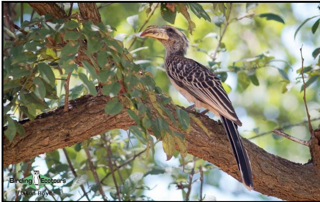
A Pale-billed Hornbill seen in miombo-type woodlands

where we search for miombo-woodland birds – and we have to be quite careful, as there are stacks of big game (some pretty dangerous) around. Racket-tailed Roller sits quietly on more concealed perches in thicker woodland than other rollers. Shelley's Sunbird and various other more widespread sunbird species might be around. Miombo Rock Thrush sings beautifully from under the canopy. Pale-billed Hornbill , Böhm's Bee-eater , Dickinson's Kestrel , and a bunch of other brilliant birds will also be looked for.