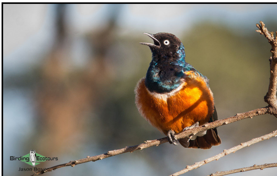
The aptly named Superb Starling .