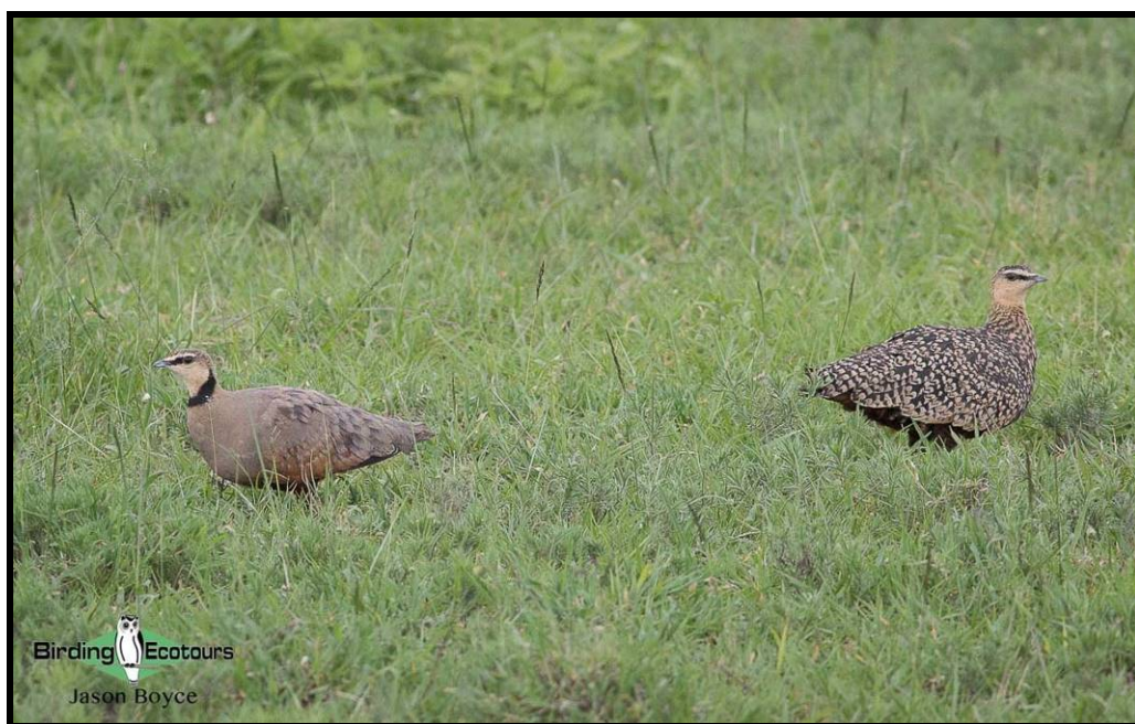
Yellow-throated Sandgrouse can be seen anywhere within the crater.

Overnight: a lodge on the crater rim with spectacular views onto the floor far below