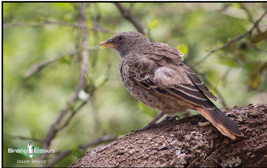
Rufous-tailed Weaver is not too difficult to find.

Eventually this epic Tanzania birding tour ends at the tropical Indian Ocean city of Dar es Salaam, from where there is the option of joining a short extension to Pemba Island for its four endemics and/or a "rough" extension to some of the more remote Eastern Arc Mountains for endemics we won't see on the main tour. Please ask us at info@birdingecotours.com if you are interested in either or both of these extensions.