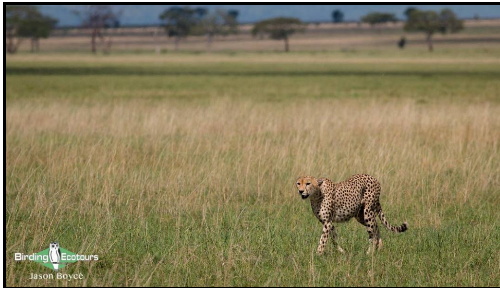
Cheetah in a savanna landscape is quite a scene.