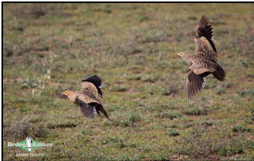
A male and female Chestnut-bellied Sandgrouse touch down.