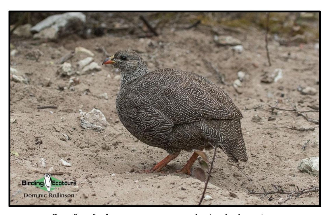
Cape Spurfowl were very common and quite cheeky at times.

We finished off the day with a walk around the campsite, which was relatively quiet although we did find Cape Spurfowl , calling Grey-winged Francolins , African Hoopoe , Fiscal Flycatcher , Great Crested Grebes in the nearby wetland, and great visuals of Fiery-necked Nightjar as it got dark. We enjoyed a tasty South African braai (barbecue) with the nightjars calling in the background, before heading to bed for the night.