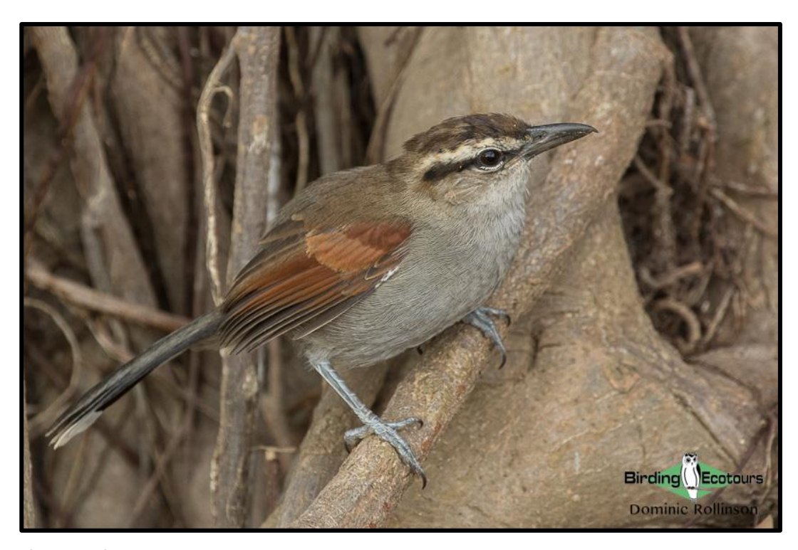
Southern Tchagra was an important target which was rather numerous in De Hoop Nature Reserve.

We awoke just before sunrise and spent the next few hours wandering around the <u>campsite</u> which was incredibly productive. It didn't take long to locate one of our major targets Southern Tchagra , and they actually proved quite numerous in the campsite over the morning. Our next target Knysna Woodpecker took a lot more effort but eventually we were rewarded with point-blank views of a bird as it went about feeding, completely oblivious to our presence. Other good birds here included the likes of Horus , Alpine , White-rumped and African Black Swifts , Willow Warbler , Spotted Eagle-Owl , Speckled and Red-faced Mousebirds , Bar-throated Apalis , Southern Double-collared Sunbird , Pied Starling and Water Thick-knees along the shoreline. A small flock of Namaqua Sandgrouse were seen as we departed the campsite.