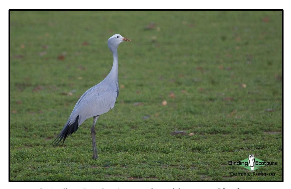
The Agulhas Plains host large numbers of the majestic Blue Crane .

This short two-day birding trip into the Agulhas Plains (Overberg region) was put together to target a number of specials which are best found in this region, a few of which are endemics or near-endemics to South Africa. Some of these species occur here at their most westerly extent and thus this is the closest they can be seen to Cape Town. This trip was highly successful, with some of the highlights including Horus Swift, Namaqua Sandgrouse, Blue Crane, Denham's Bustard, Karoo Korhaan, Cape Gannet, African Penguin, Cape, Crowned and Bank Cormorants, Secretarybird, Cape Vulture, Knysna Woodpecker, Southern Tchagra, Cape Rockjumper, Agulhas Long-billed, Cape Clapper and Large-billed Larks, Victorin's Warbler, Cape Sugarbird, Orange-breasted Sunbird and Swee Waxbill.