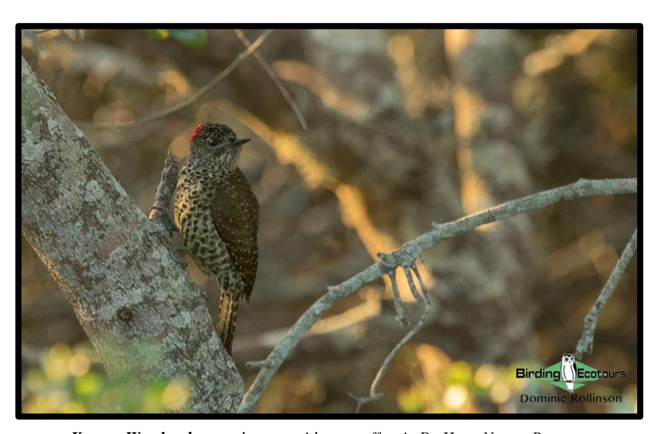
Knysna Woodpecker can be seen with some effort in De Hoop Nature Reserve.