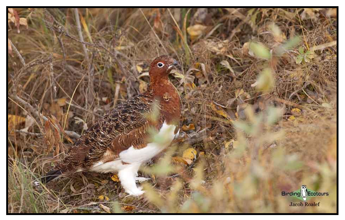
The striking Willow Ptarmigan is one of the top targets on this trip.

Then of course there is the wide array of fantastic birds that use these bountiful summer arctic habitats for their nesting and breeding season. Birds include Bald Eagle , Horned and Tufted Puffins , Ancient and Kittlitz's Murrelets , Long-tailed and Harlequin Ducks , Aleutian Tern , all four amazing Eider species ( Steller's , Spectacled , King , and Common ), all three Jaeger species ( Parasitic , Long-tailed , and Pomarine ), Bristle-thighed Curlew , Emperor Goose , and many others which can be found on or above the waters and bays, not to mention true stunners like Snowy Owl , Arctic Warbler , Gyrfalcon , Bluethroat , American Dipper , and Willow and Rock Ptarmigans in the tundra and alpine areas. There are indeed very few places that could challenge the scenery, birds, and other wildlife found in the majesty of Alaska.