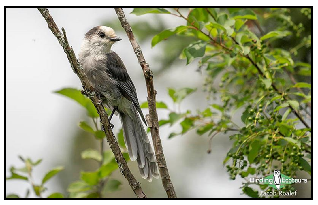
The cute Canada Jay is one of our many boreal targets.