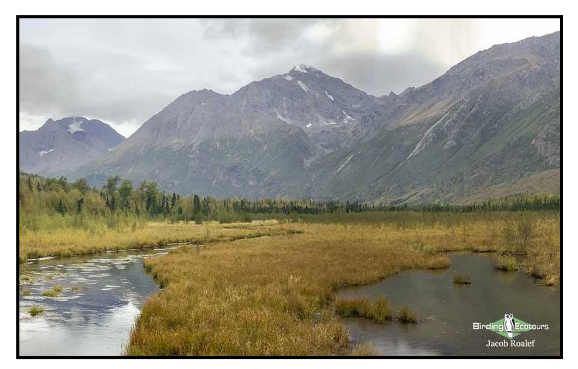
This tour will feature some stunning Alaskan scenery.