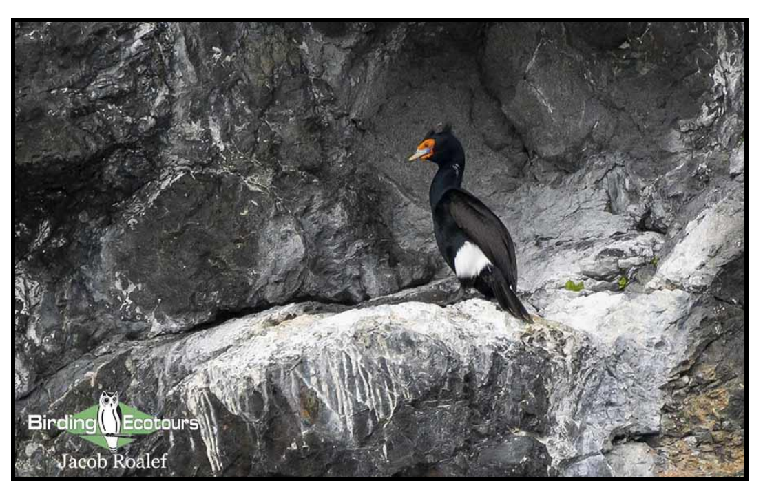
Sea birds, like Red-faced Cormorant, can be seen in Resurrection Bay.