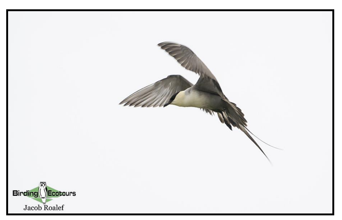
The dainty Long-tailed Jaeger.