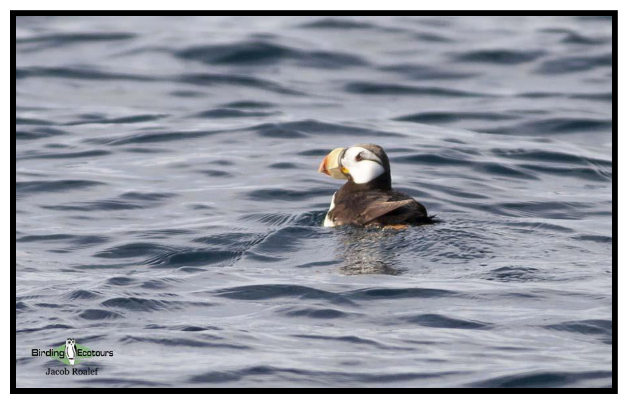
We will visit a large colony of Horned Puffins while in Seward.