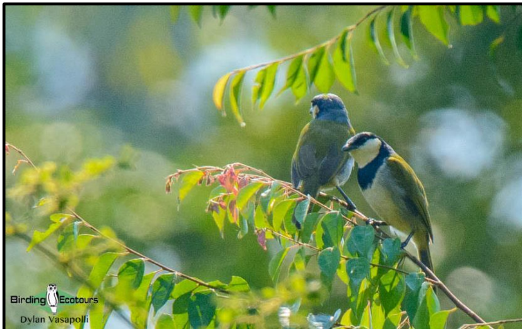
The strange Black-collared Bulbul is a sought-after species in south-central Africa.