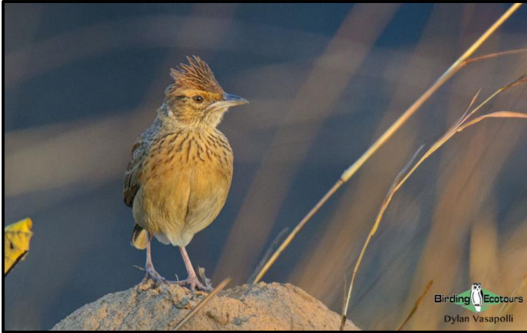
Mount Moco hosts many exciting species, and this Angolan Lark is one we hope to find!