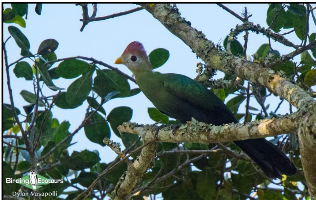
The national bird of Angola, Red-crested Turaco, is best found in the endemic-rich Kumbira Forest.