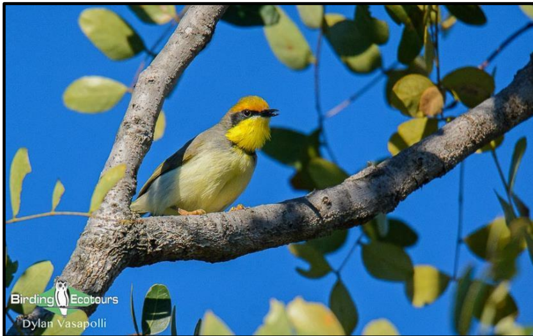
Black-necked Eremomela will be searched for in miombo woodland.

Angola has a massive diversity of species, nearly 1000 species occurring within its borders, of which thirteen are true endemic species, while countless other near-endemics and highly localized species feature prominently. This is all a testament to the many habitats within the country and ultimately the fantastic birding Angola possesses, making it without a doubt one of the finest birding countries in Africa and a destination not to be missed by any world birder.