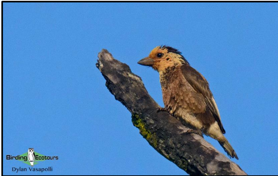
Angola is arguably the easiest place to see the scarce Anchieta's Barbet .