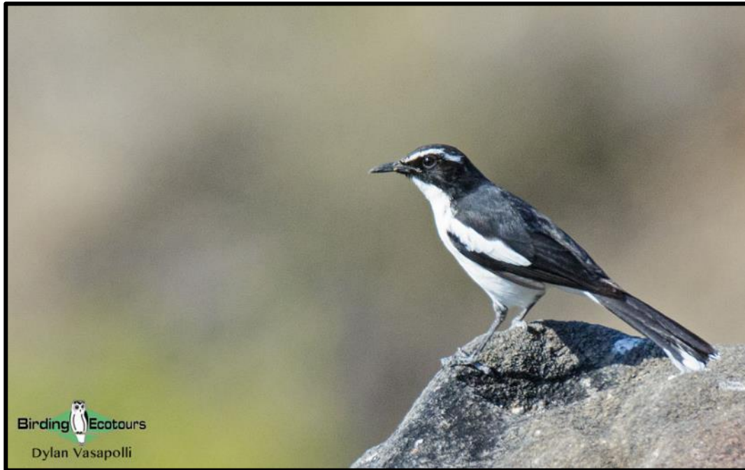
Angolan Cave Chat is a big target in the rocky mountains of the Tundavala escarpment.

our way up from the bottom, the scrubby habitat is arguably the least interesting, even though it does hold many interesting species like Red-backed Mousebird , Yellow-fronted Tinkerbird , Bennett's Woodpecker , Rattling and Tinkling Cisticolas , Hartlaub's Babbler , Miombo Rock Thrush , a host of Sunbirds including Ludwig's Double-collared and Oustalet's , and various seedeaters such as Blue , Violet-eared , and the endemic Angolan Waxbills as well as Brimstone Canary . The grasslands too don't have much interest, although top of the list here goes to the scarce Finsch's Francolin , while other species to be sought include Red-capped Lark , Wing-snapping Cisticola , Buffy Pipit , and Quailfinch .