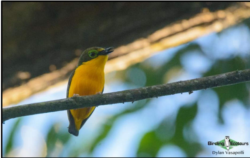
The stunning Yellow-bellied Wattle-eye provides a bright splash of color in the forests.