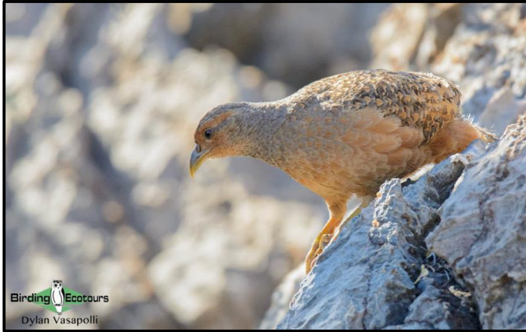
A denizen of the mountains, the Hartlaub's Spurfowl is one of the main targets near Benguela.

The surroundings are covered by typical dry acacia thornveld, which hosts a number of species including Acacia Pied Barbet , Pirit Batis , Bokmakierie , Brown-crowned Tchagra , African Red-eyed Bulbul , Long-billed Crombec , Cape Penduline Tit , Black-chested Prinia , Barred Wren-Warbler , Cape Starling , White-browed Scrub Robin , Red-billed Buffalo Weaver , White-browed Sparrow-Weaver , Green-winged Pytilia , Red-headed Finch , and Blue and Violet-eared Waxbills . Areas of open ground host Namaqua Dove and the stunning and unique White-tailed Shrike , and watching the latter 'giant batises' never fails to impress! We will also search overhead for Verreaux's and Booted Eagles and Bateleur , while both Mottled and Böhm's Spinetails frequent the skies above baobab trees. If we're lucky, we may even find scarcer species such as Orange River Francolin in the area. We will eventually have to tear ourselves away from the fine birding here, as we transfer to the large city of Lubango. This is a long drive, and we will likely arrive in the late afternoon, from where we will check into our comfortable lodge.