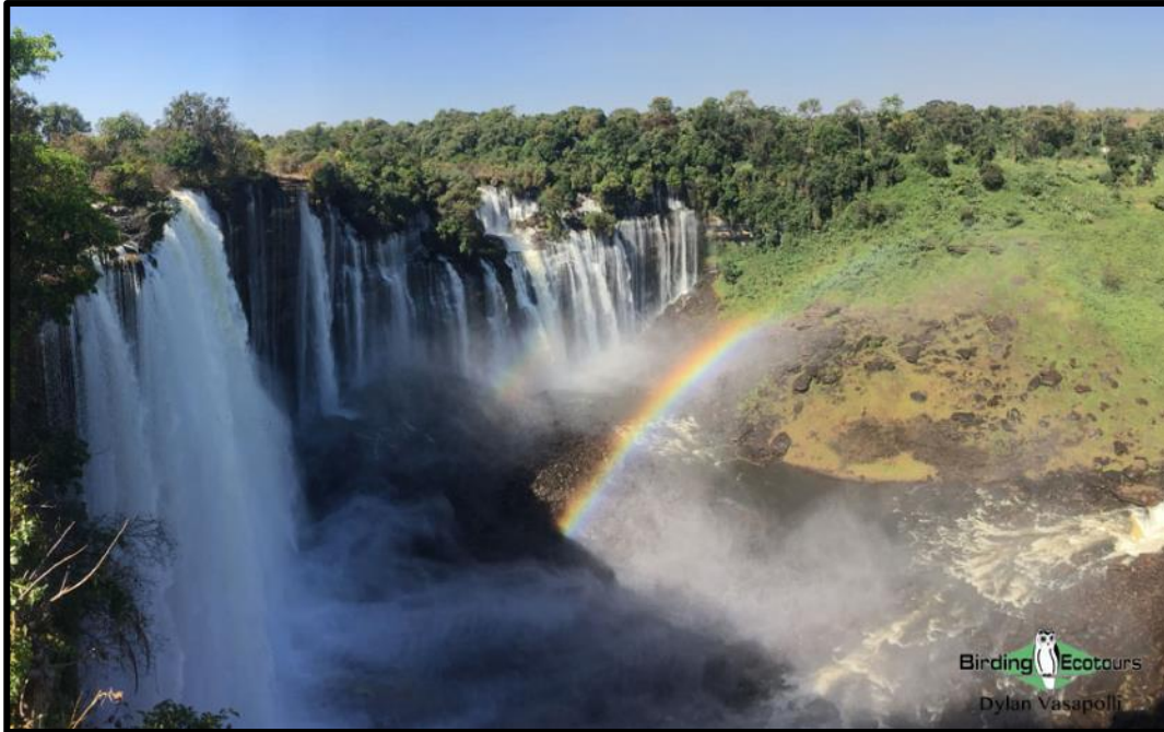
The Kalandula falls are exquisite, and one of the major natural attractions of the country!

Please note that the itinerary cannot be guaranteed as it is only a rough guide and can be changed (usually slightly) due to factors such as availability of accommodation, updated information on the state of accommodation, roads, or birding sites, the discretion of the guides and other factors. In addition, we sometimes have to use a different international guide from the one advertised due to tour scheduling.