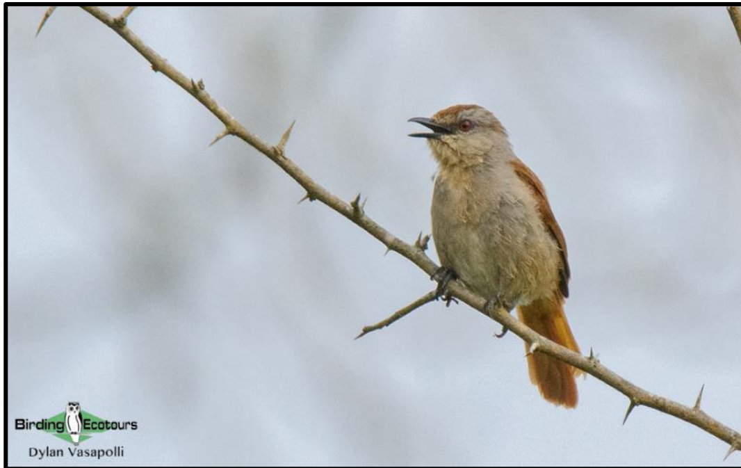
Rufous-tailed Palm Thrush has a beautiful song and is widespread in coastal Angola.

We have a full day to explore this area and will take a few specific tracks, venturing deeper into the area. We again see a slight habitat change, heading into a lush area, crisscrossed with dry riverbeds and dense thickets. It is these areas that hold the local major specials and where we will spend the bulk of our time. The dry riverbeds are home to large, mature, acacia-type trees, and we will search these areas for the highly prized and localized endemics, Monteiro's Bushshrike and Gabela Helmetshrike , along with the more widespread, near-endemic Red-backed Mousebird . The denser thickets host one of the other endemic targets of the area, White-fronted Wattle-eye , and also support the endemic Hartet's Camaroptera and the near-endemic Pale-olive Greenbul , although these latter two are more widespread and thus also possible elsewhere on the trip. This area also gives us our best chance for the difficult-to-see, endemic Grey-striped Francolin , and we will be sure to keep a beady eye on the tracks watching out for this scarce gamebird among its more common cousin, Red-necked Spurfowl . Also best sought in this area is the near-endemic Golden-backed Bishop , and although we will not be seeing these birds in their breeding plumage, their unique structure and plumage make them easy to identify.