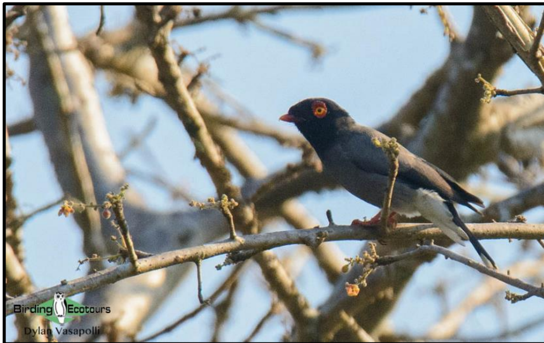
Gabela Helmetshrike is one of the prized birds occurring in Kissama National Park.