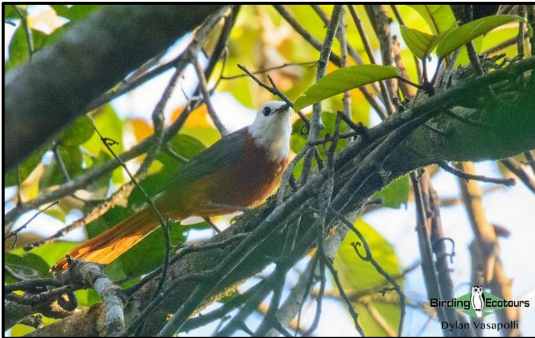
The Kalandula area is home to some superb birding, and the poorly known and recently rediscovered White-headed Robin-Chat is one of the hallmark species of the country!

spectacular bird is another one of the major avian drawing cards on this tour! Initially thought to be extinct, this species was only rediscovered as recently as in the 1990s, and it is now known only from three separate locations, with a very small number of birders fortunate enough to have seen it. This species' ringing call echoes through the forest, but it is a shy species, and patience is required to obtain visuals. While this will be our main target, there are a host of other tantalizing species occurring in these swamp forests and their surroundings as well. The diminutive White-spotted Flufftail frequents these swampy areas, while the vocal Ross's Turaco bounds through the tree tops. The upper reaches also play host to the shy Olive Long-tailed Cuckoo , Scaly-throated Honeyguide , Honeyguide Greenbul , and Brown-headed Apalis , while the denser reaches lower down host Grey-winged Robin-Chat , Cabanis's Greenbul , and Black-throated Wattle-eye . Stands of miombo-type woodland surround the swamp forests, and we will be spending some time slowly working our way through these woodlands as well.