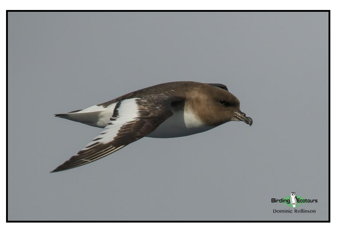
We stand a chance of encountering Antarctic Petrel on this trip.

These days will be spent admiring the magnificent scenery from the vessel. Be sure to have your camera ready as we pass spectacular icebergs. There is also a good possibility of spotting Fin Whale and Antarctic Petrel .