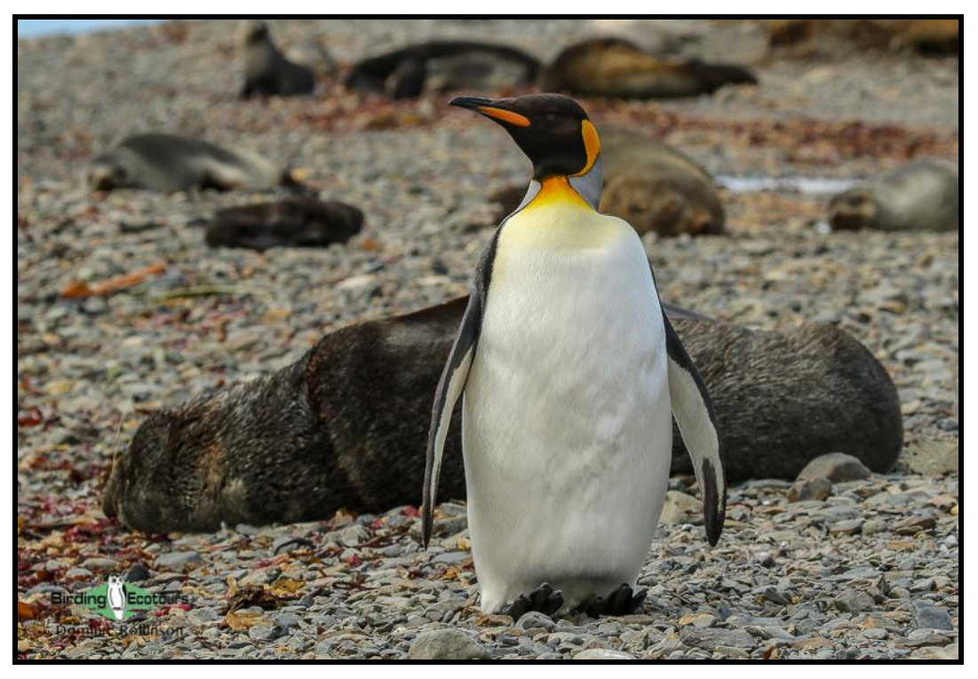
We will visit large colonies of King Penguins on the Falkland Islands.

This magnificent cruise starts in the world's southernmost city, Ushuaia. This Argentinean city is bounded by the famous Beagle Channel on one side and by the mountains of Tierra del Fuego ("Land of the Fire") on the other. We already start looking for "mainland" birds here before we set sail to the Falkland Islands, famed for the massive colonies of King Penguins (plus four other penguin species), Black-browed Albatross, and a fabulous suite of other charismatic birds as well as marine mammals. We then head to South Georgia, where we hope to find some endemic birds along with all the penguins, petrels and other seabirds, including one of the world's most iconic birds, the massive Wandering Albatross. The next island archipelago we will visit is the South Orkney Islands which will provide sightings of large numbers of seabirds against a dramatic backdrop of spectacular scenery. We'll eventually head to the Antarctic Peninsula itself, where we hope to see Snow Petrel and to add new penguin species to our list, among many other things. We'll try (ice-permitting) to sail into the Weddell Sea. On our way back to Ushuaia, we'll keep scanning the ocean for species we may have missed before perhaps a Sooty or Light-mantled Albatross! The tour ends in the world's southernmost city, Ushuaia. This Argentinean city is bounded by the famous Beagle Channel on one side and by the mountains of Tierra del Fuego ("Land of the Fire") on the other and is a spectacular place to find oneself in!