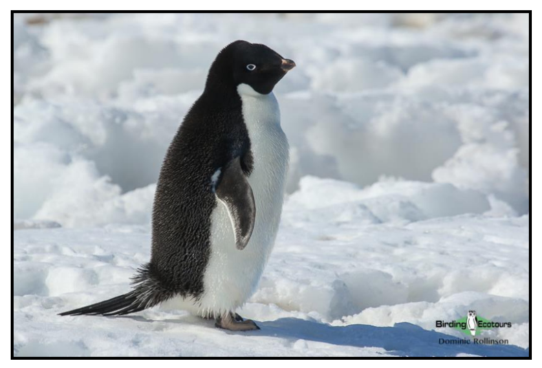
The cute Adelie Penguin should be seen at Brown Bluff!

forming a natural harbor for our vessel. On Deception Island, there is incredible birdlife! You can view species such as Antarctic Tern, Black-bellied and Wilson's Storm Petrels, South Polar Skua, Kelp Gull, and thousands of Cape Petrels.