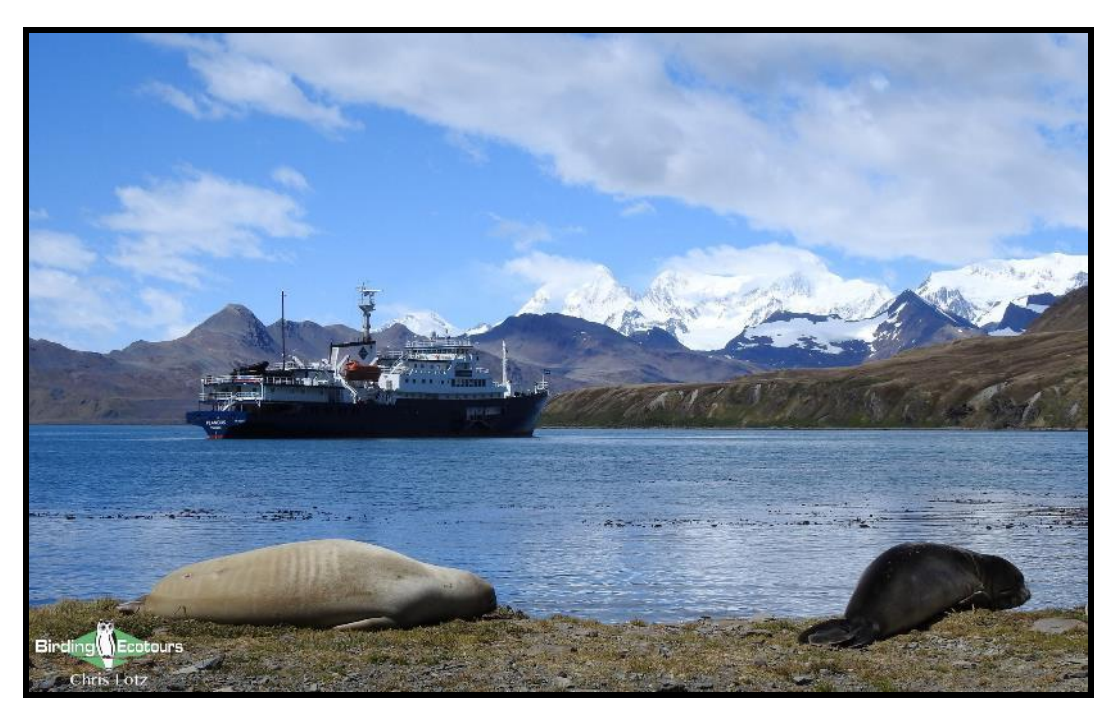
Southern Elephant Seals occur in large numbers on South Georgia.

The next two days will be spent en route to breathtaking South Georgia. Sailing across the Antarctic Convergence and entering the much cooler Antarctic waters, you can now expect significantly cooler temperatures. As we head toward the Antarctic Convergence, we should start to see several kinds of fabulous birds such as petrels, skuas, albatrosses, prions, and shearwaters.