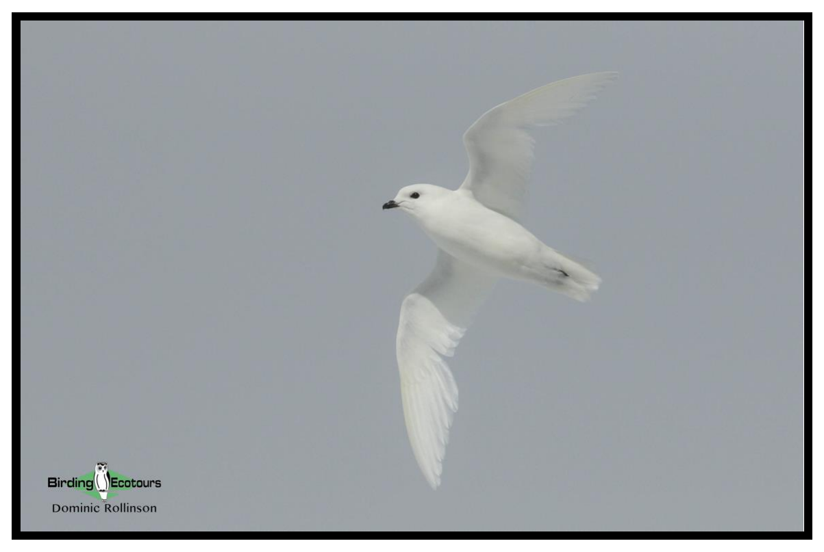
The angelic Snow Petrel should be seen as we head closer to the Antarctic Peninsula.