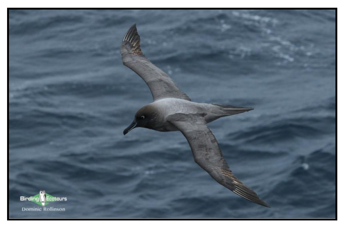
Light-mantled Albatross should be seen as we cruise through the Antarctic Convergence.

We spend the entire day at sea in the direction toward the Falkland Islands. The prevailing winds from the west will bring us a wide range of remarkable birds, such as diving and storm petrels, a variety of albatrosses, and some shearwaters.