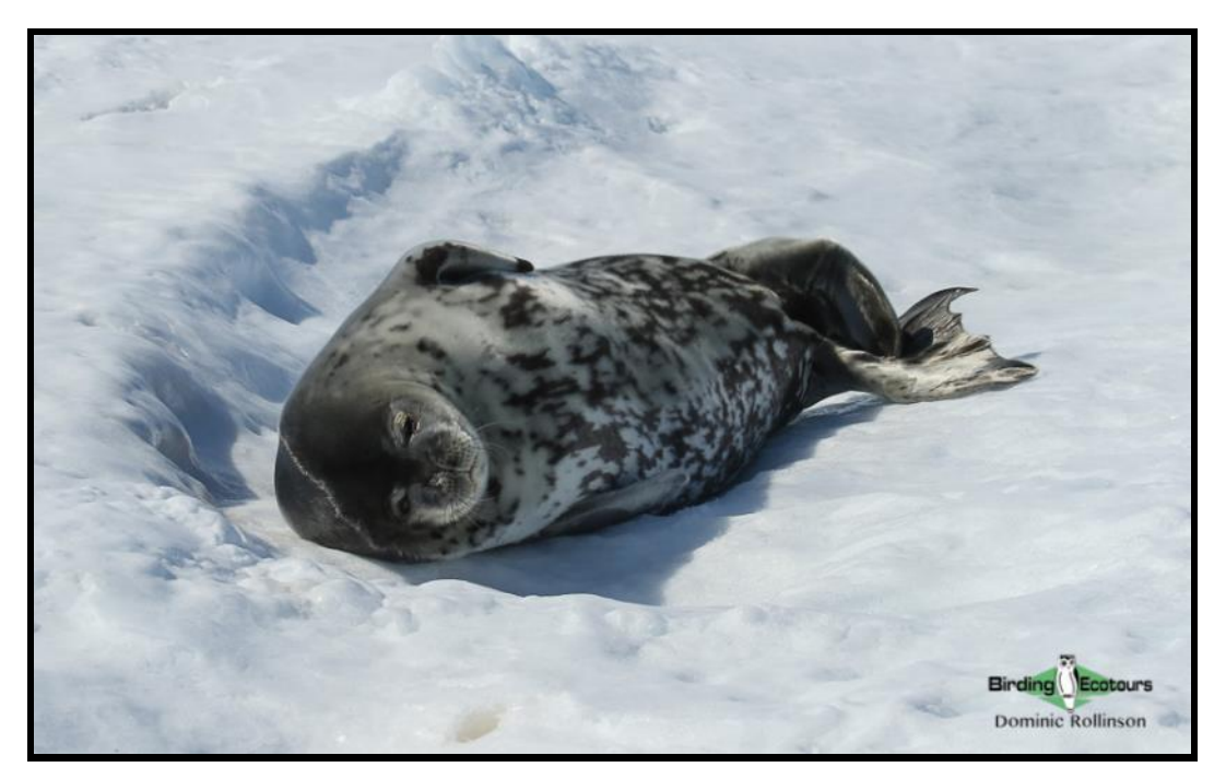
A cute Weddell Seal pup!

Although we spend the entire day at sea, there is certainly no shortage of seabirds! The birds and birding may change, especially if the vessel encounters sea ice, as this is where we are likely to observe some special, high Antarctic birds such as Snow Petrel or South Polar Skua .