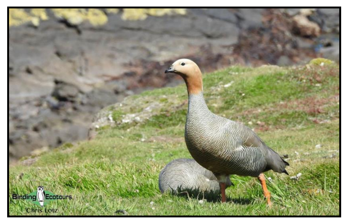
Ruddy-headed Goose can be seen on the Falkland Islands.

of Gentoo and Magellanic Penguins, passerines such as the endemic races of Blackish Cinclodes, White-bridled Finch, Dark-faced Ground Tyrant, Correndera Pipit, and Austral Thrush, as well as close-up views of waterfowl species including White-tufted Grebe, Upland, Kelp and Ruddy-headed Geese, Falkland Steamer Duck, Chiloe Wigeon, Yellow-billed Pintail and Silver Teal.