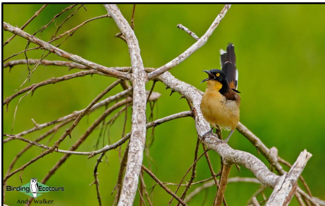
Birding the Iberá Marshlands may produce sightings of the striking Black-capped Donacobius .

Overnight: Estancia San Juan Poriahú, Ituzaingó