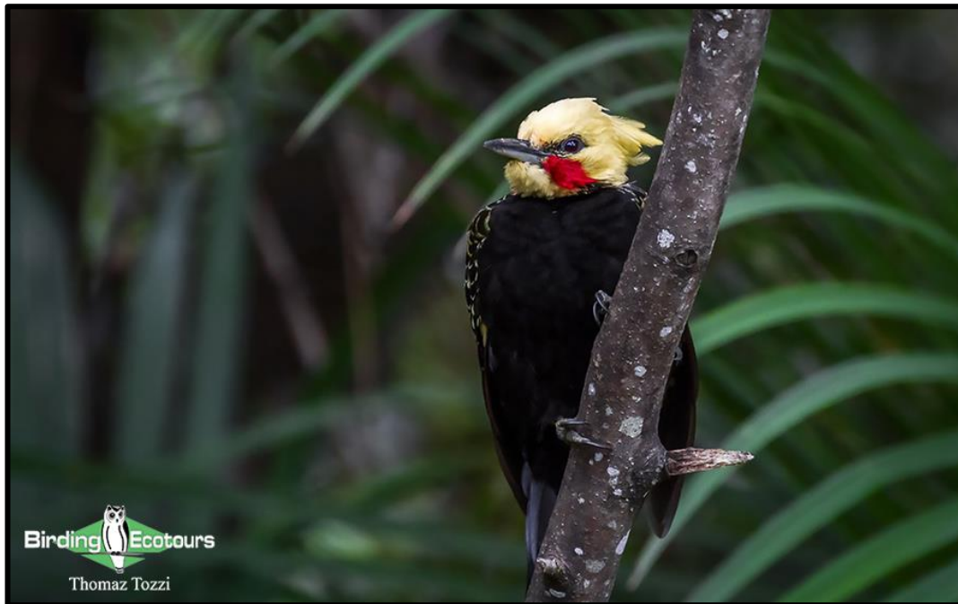
Blond-crested Woodpecker – another of the trip’s major targets.