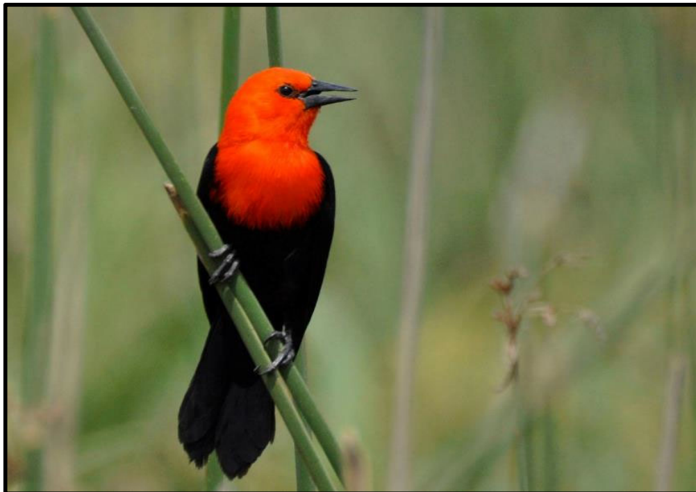
Birding the Iberá Marshlands may produce sightings of the beautiful Scarlet-headed Blackbird.

Overnight: Estancia San Juan Poriahú, Ituzaingó