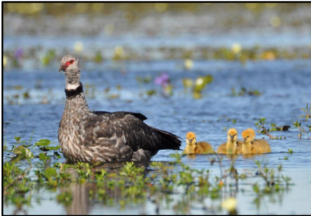
The Iberá Marshlands have good numbers of Southern Screamer.

Overnight: Hotel Dolmen/Hotel Pestana , Buenos Aires