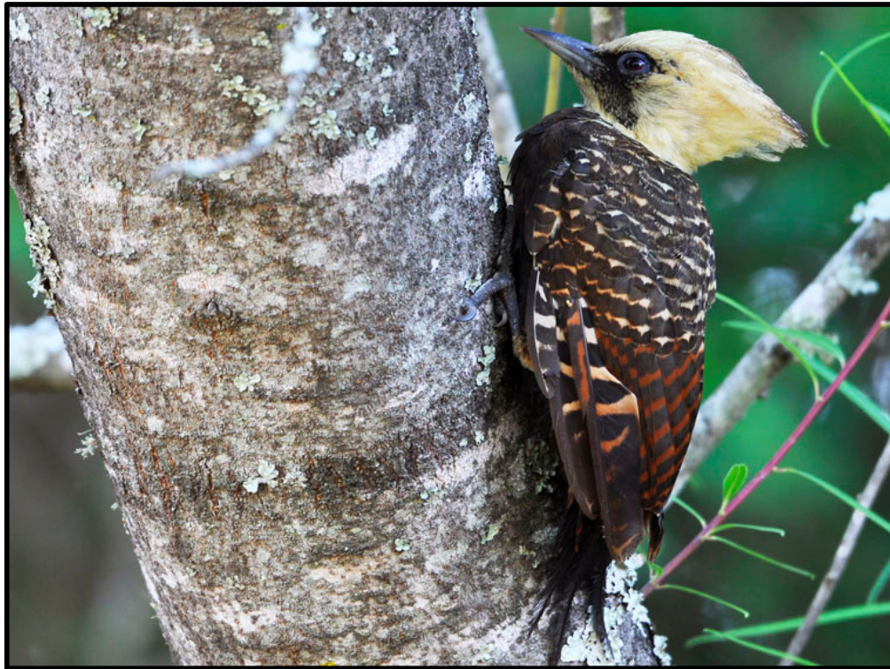
The large and impressive Blond-crested Woodpecker